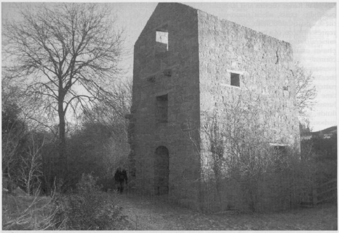
(Figure 5.77) Photograph of the restored engine-house at the Pennant Mine GCR site.