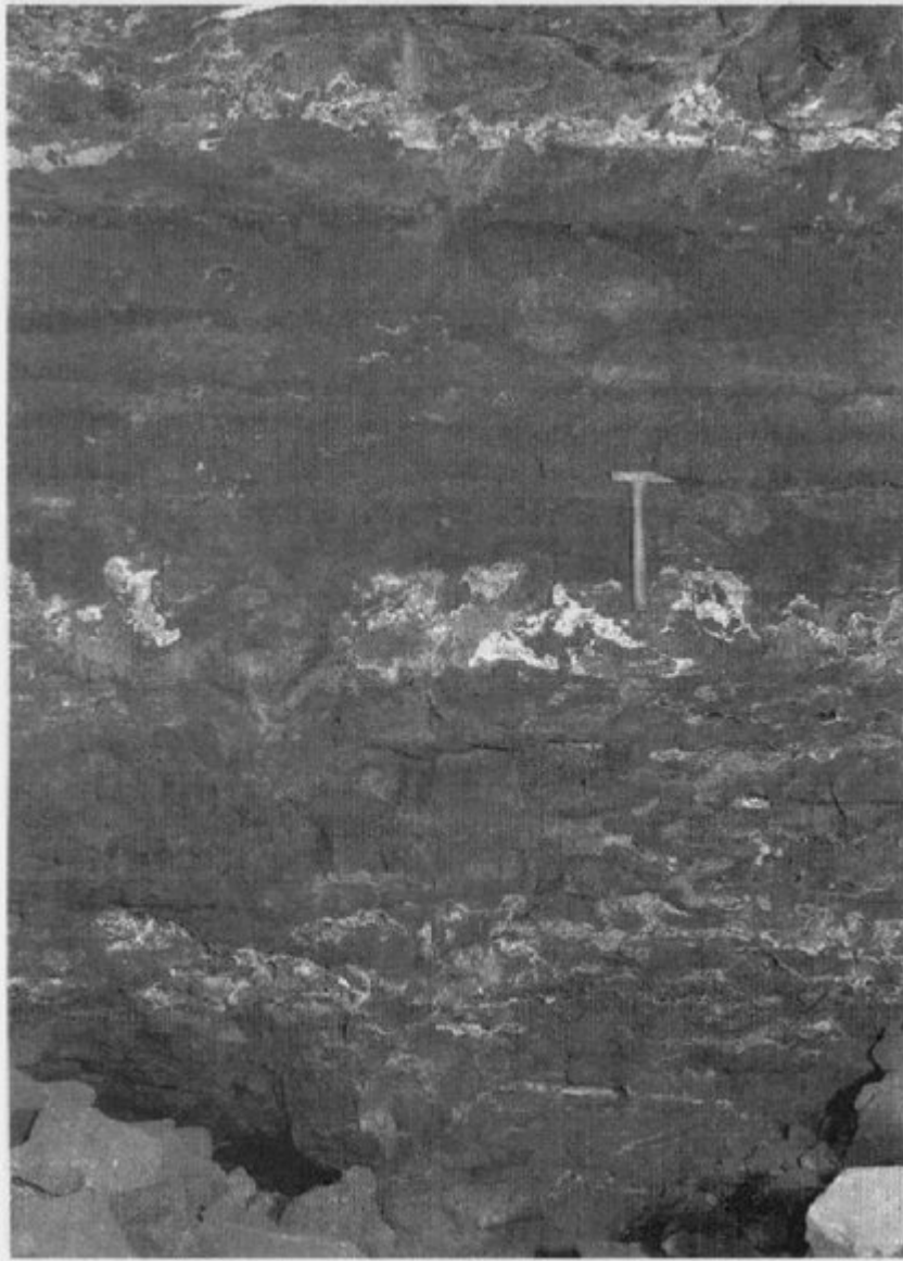
(Figure 3.4) Metasomatized Great Limestone in the Smallcleugh (or Handsome Mea) Flats at Smallcleugh Mine. The limestone has been replaced mainly by ankerite and some silica. The most intensely altered limestone contains roughly horizontal bands of vugs lined with crystals of ankerite, galena and sphalerite. Above the hammer a limestone bed with numerous shaly partings has escaped intense alteration.