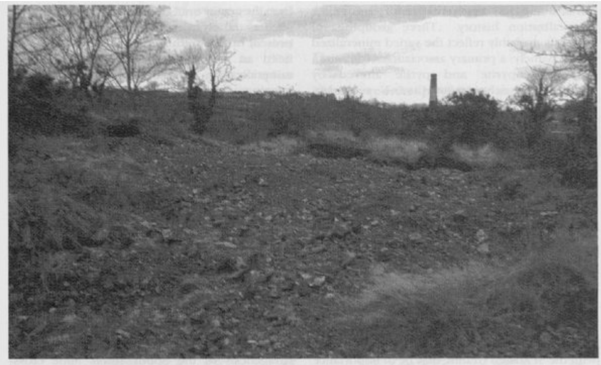
(Figure 7.45) Photograph of a dump area at South Terras Mine (Photo: JNCC.).