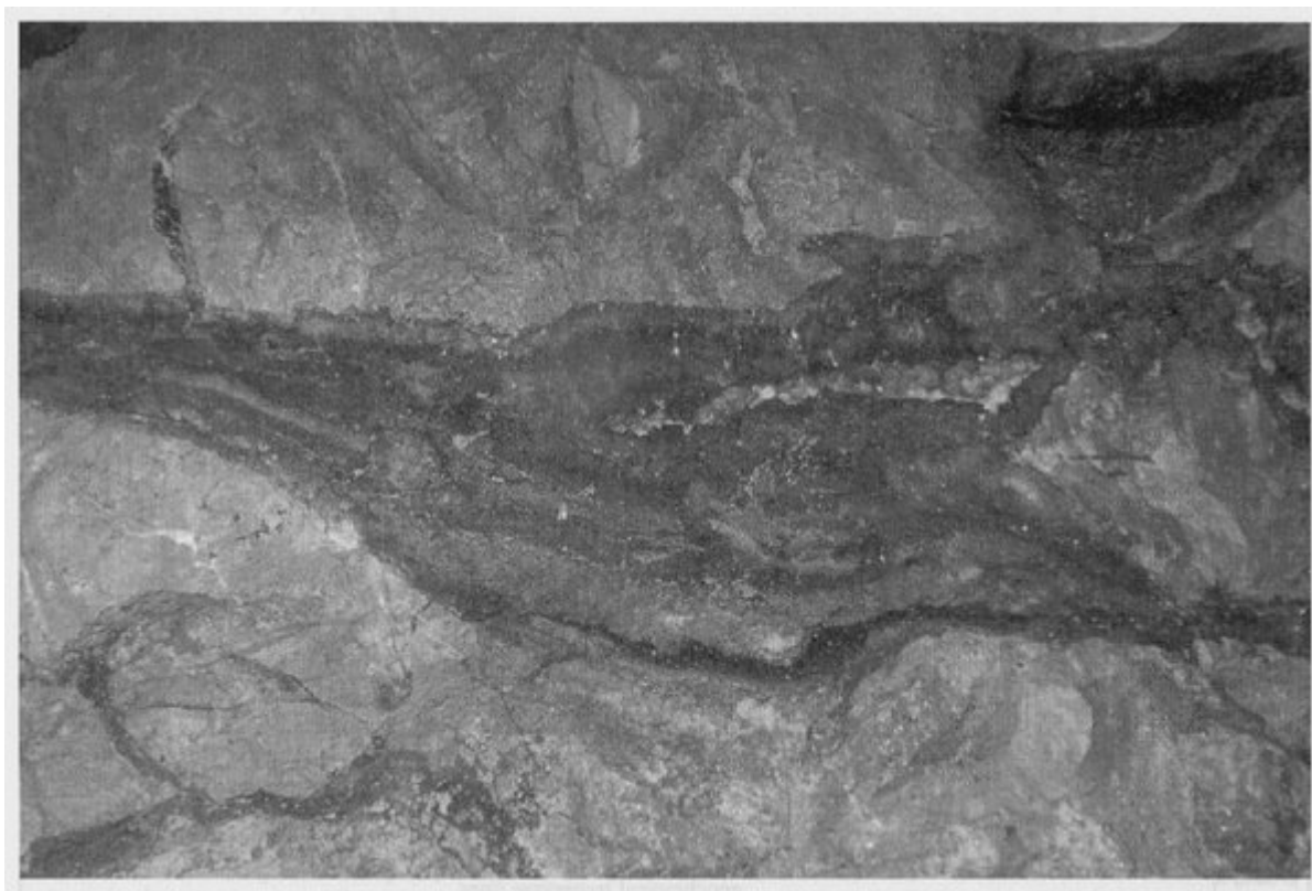
(Figure 4.21) The Blue John veins in Carboniferous limestone found within Treak Cliff Cavern, Castleton.