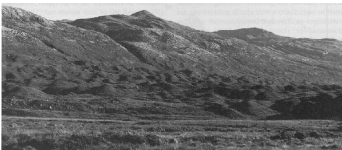
(Figure 6.14) Hummocky moraine at Coire a'Cheud-chnoic in Glen Torridon. A clear drift limit on the valley side demarcates the Loch Lomond Readvance deposits below, from the ice-scoured bedrock slopes above.