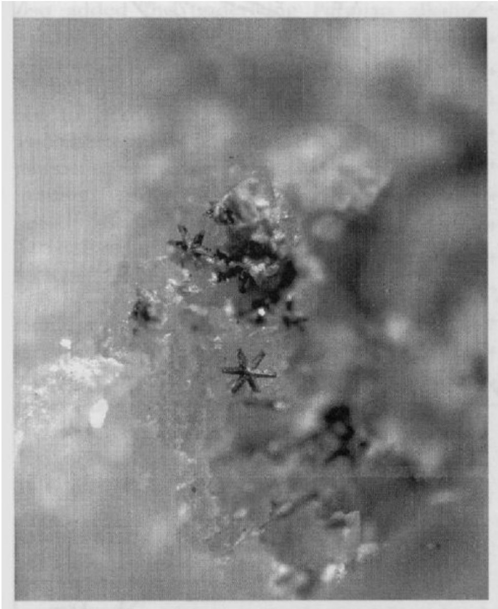
(Figure 7.47) Arsenopyrite, from Wheal Penrose, Cornwall. Tiny stellate repeated twins (trillings), with yellowish dolomite crystals and dark-brown sphalerite, in cavities of vein quartz