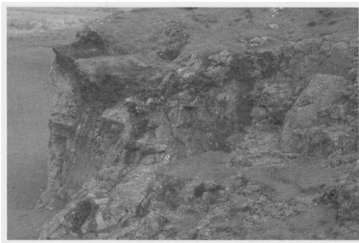
(Figure 4.22) The limestone quarry face (left) at Windy Knoll with the residual petroleum 'elaterite' deposits in the foreground. The black tarry material forms the matrix to pale fragmented limestone.