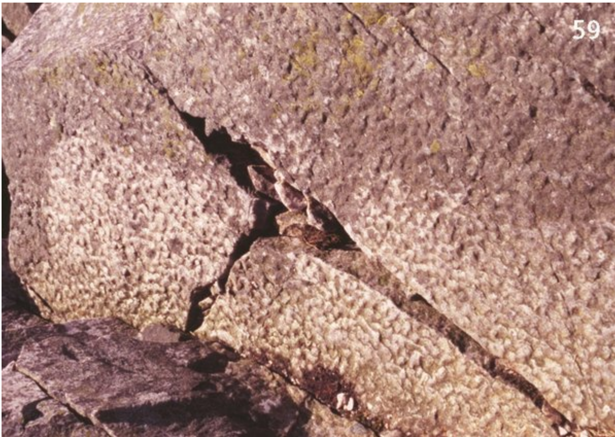
(Figure 59) Typical pitted sur-faces of Pipe Rock Member on the slopes around the Allt a'Choinne Mhill, Locality 8.6. (BGS photograph P530557, © NERC)