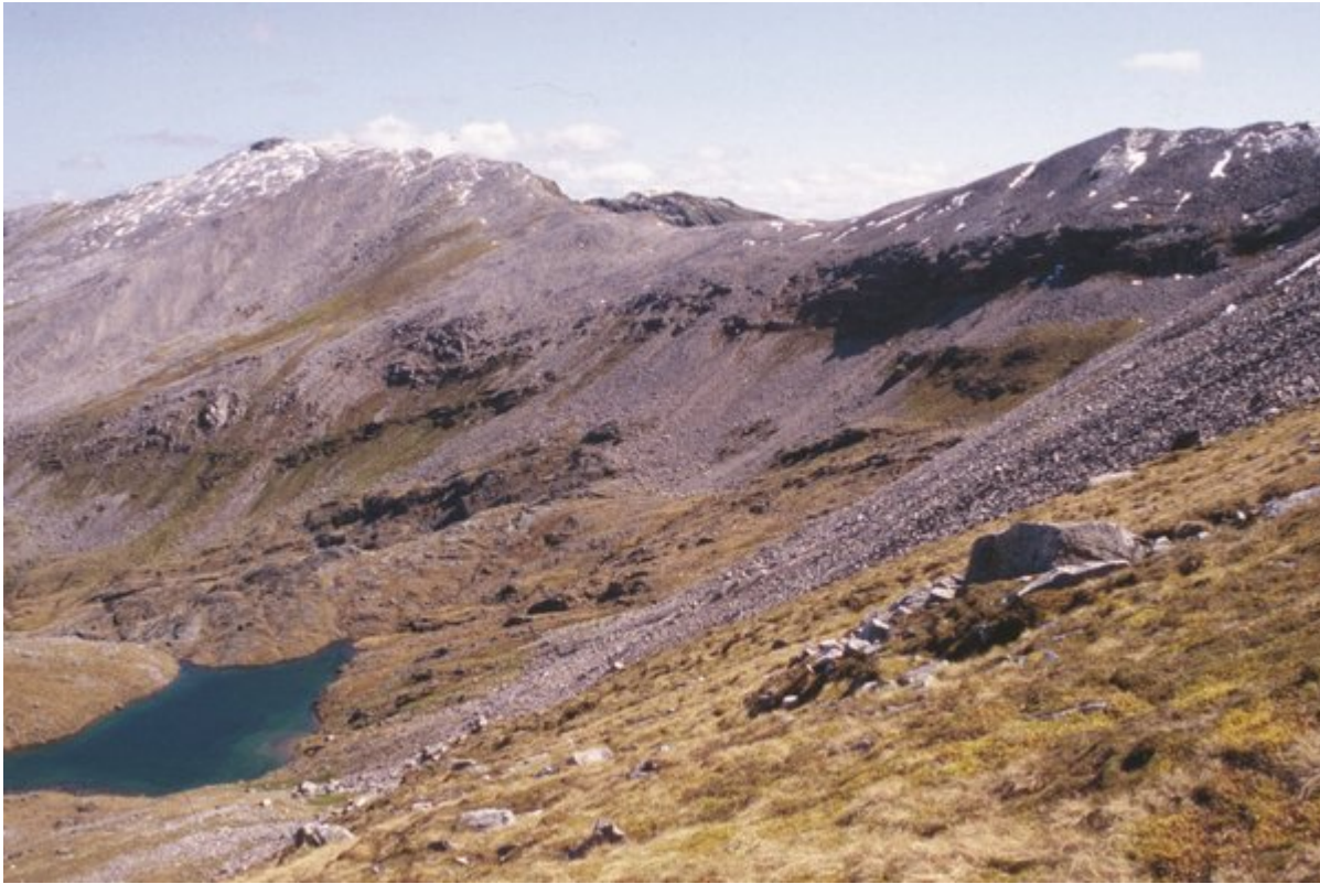
(Figure 61) View south-east across Coire a' Mhadaidh (Locality 8.8) toward Ben More Assynt. Outcrops of Lewisian gneisses (on the left) and Diabaig For-mation conglomerates (on the right) form the rocky pave-ments around the loch, with NE-dipping Basal Quartzite Member forming the ridge above.