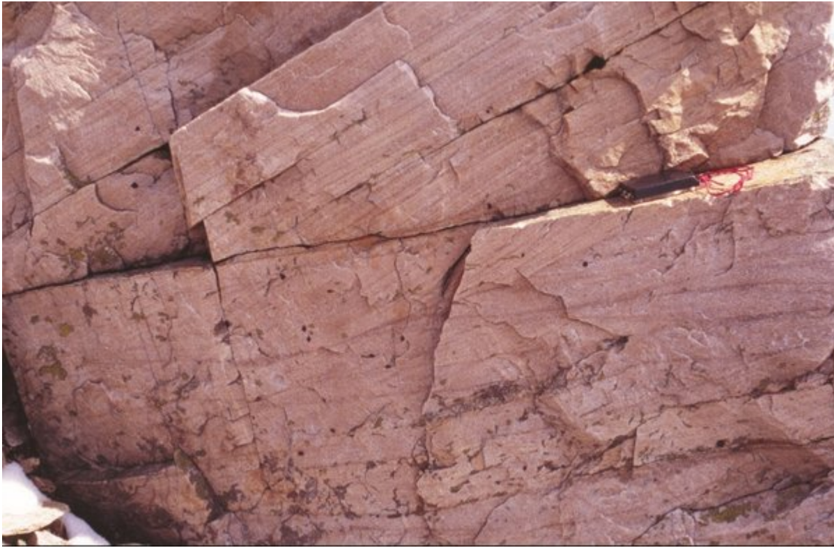
(Figure 63) Outcrops of the Basal Quartzite Member on Conival, showing planar cross-bedding.