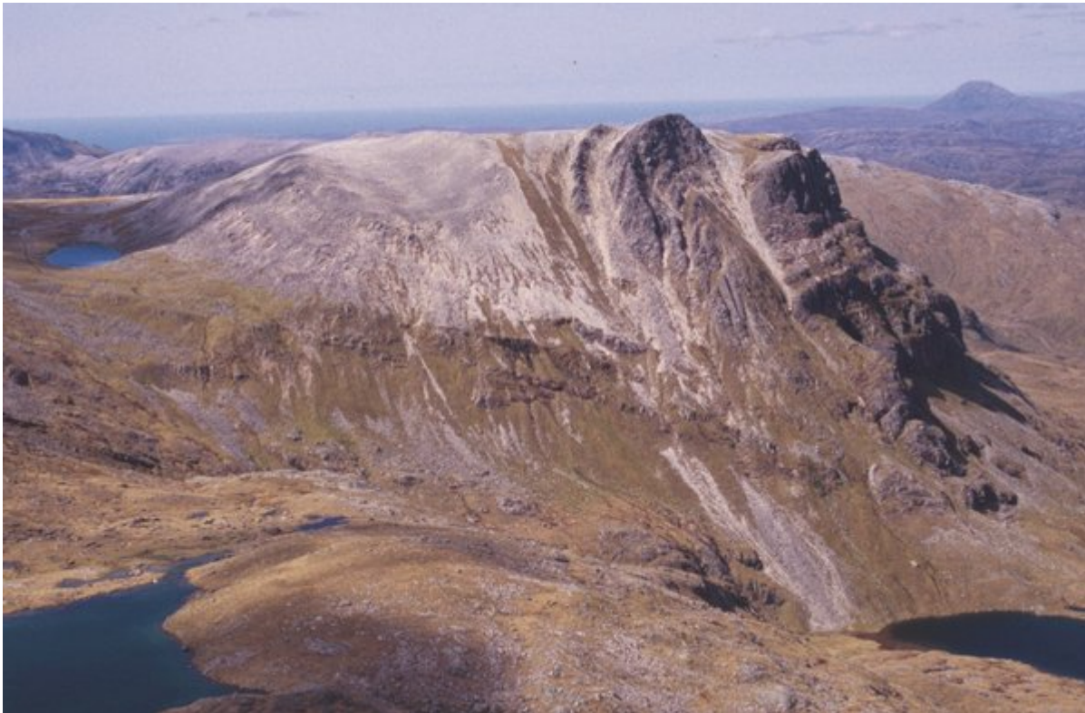
(Figure 62) View north-west from the Conival–Ben More Assynt ridge towards the face of Na Tuadhan, showing large-scale folding in the hangingwall of the Ben More Thrust.