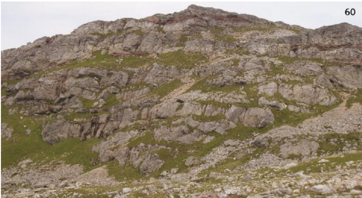
(Figure 60) Outcrops of Eriboll Formation quartz arenites intruded by brick-red porphyritic trachytes at the col below Conival, Locality 8.6.