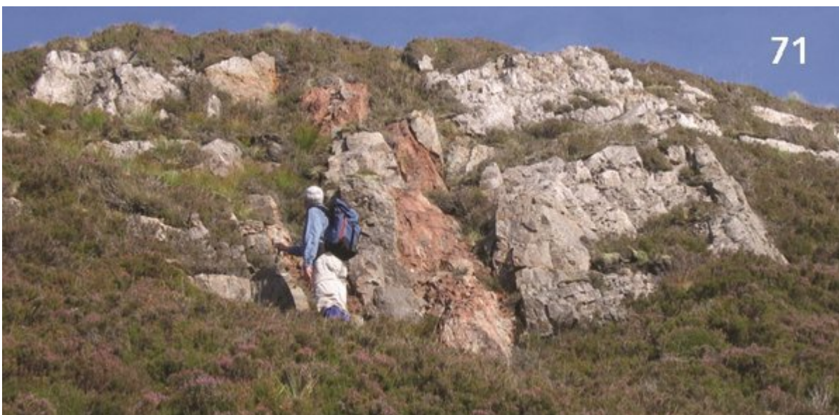
(Figure 71) Red Porphyritic Trachyte dyke, cutting Basal Quartzite Member in the Cam Loch Klippe.