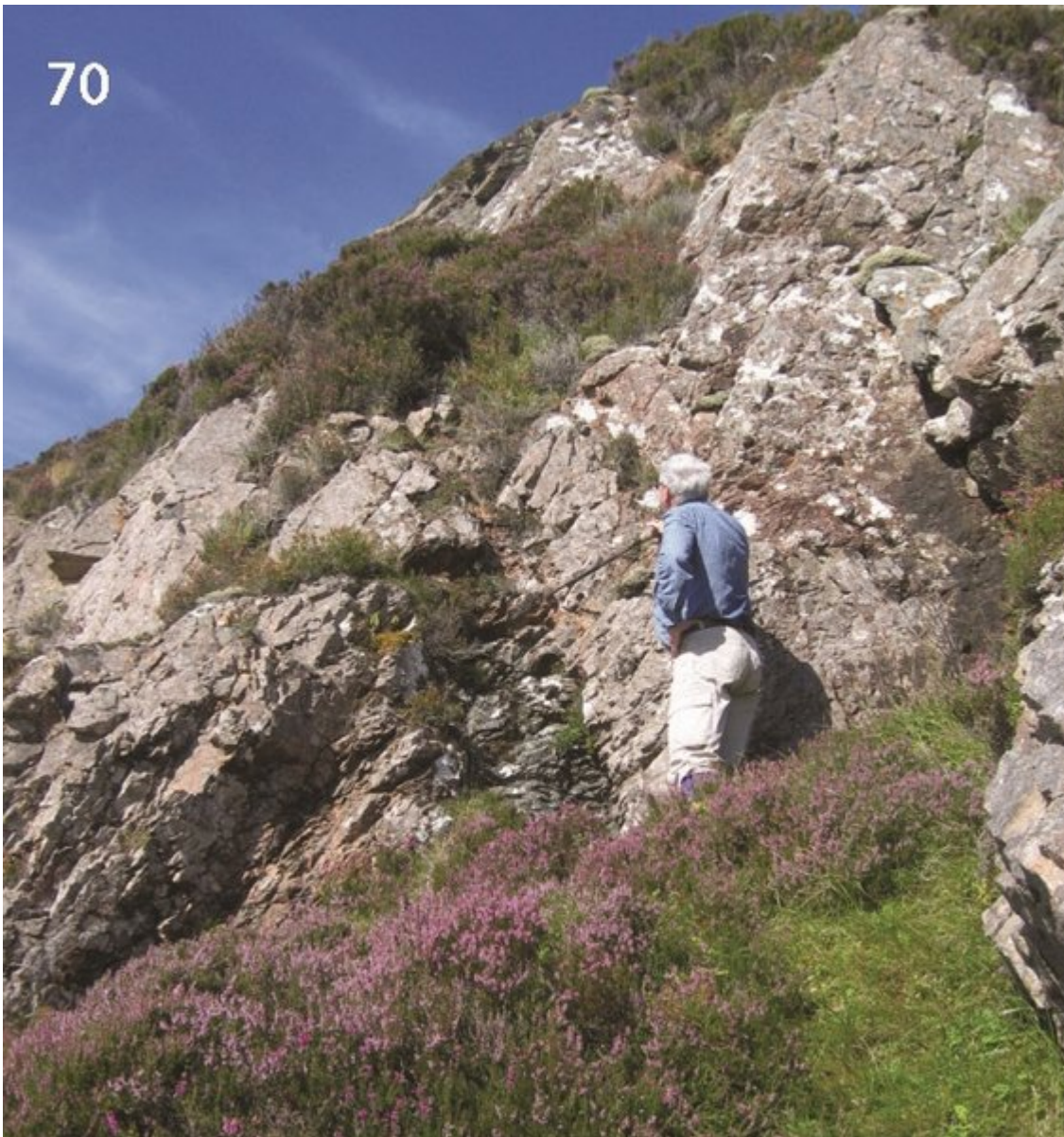
(Figure 70) The overturned, steeply dipping unconformity between Lewisian gneiss and Basal Quartzite Member in the Cam Loch Klippe. The geologist's hand is resting on Lewisian gneisses, but immediately to his left is the weathered-out unconformity, with Basal Quartzite outcrops further left.