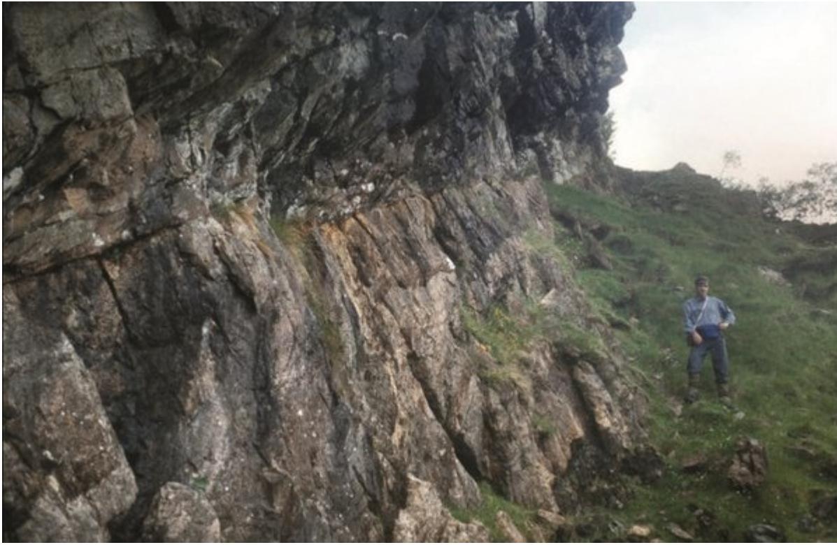
(Figure 77) The Glencoul Thrust exposure at Tom na Toine (Locality 11.1), with dark grey, mylonitic Lewisian gneisses thrust over buff-coloured Durness Group carbonates.