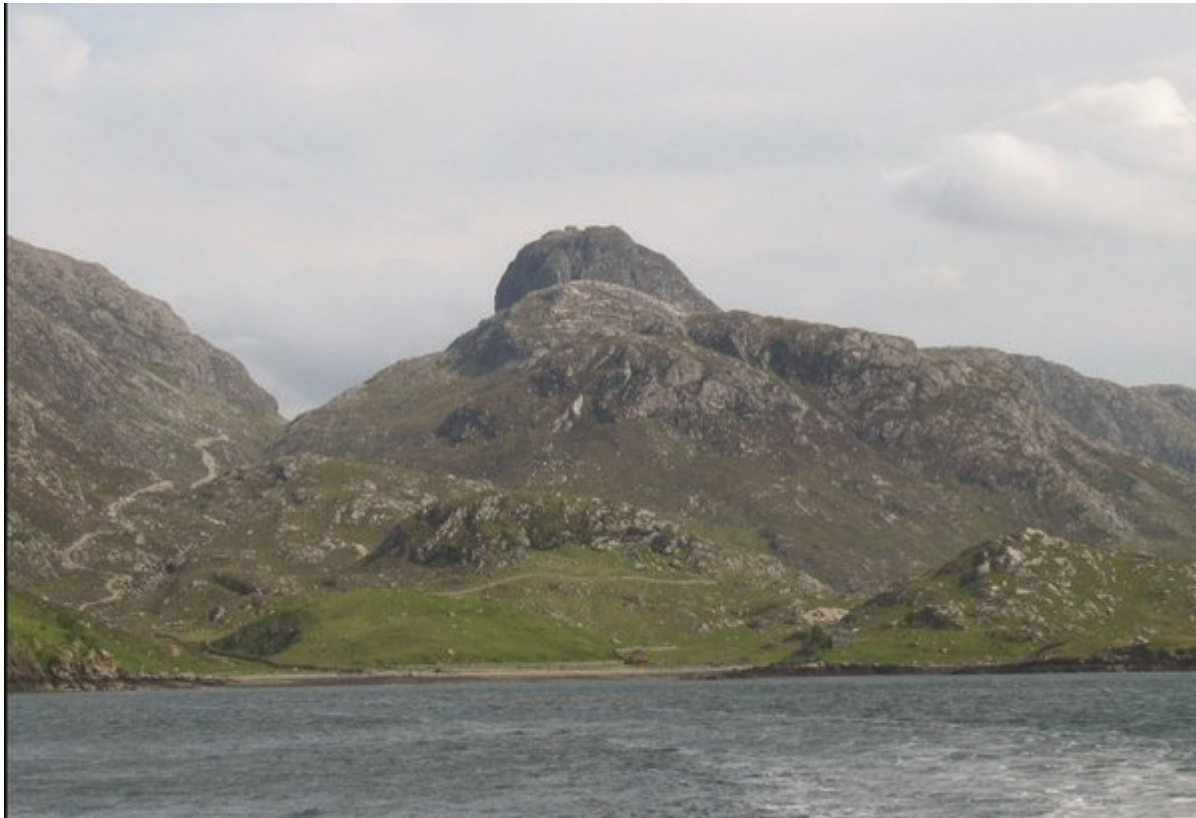
(Figure 75) View of the Stack of Glencoul from the boat up Loch Glencoul, with the stalkers' path visible on the left. The grassy areas on the shore are underlain by imbricates of the An t-Sròn and Ghrudaidh Formations, overlain by craggy Lewisian gneisses in the Glen-coul Thrust Sheet. The cliffs forming the prominent summit of the Stack of Glencoul are