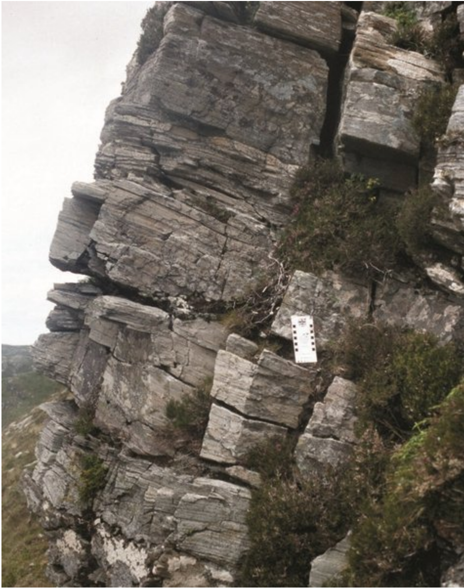
(Figure 78) The Moine Thrust at the base of the Stack of Glencoul cliffs (Locality 11.3). The scale marker rests on pale grey mylonitic Cambrian quartz arenite, which is overlain by darker grey Moine mylonites at the top of the photograph.