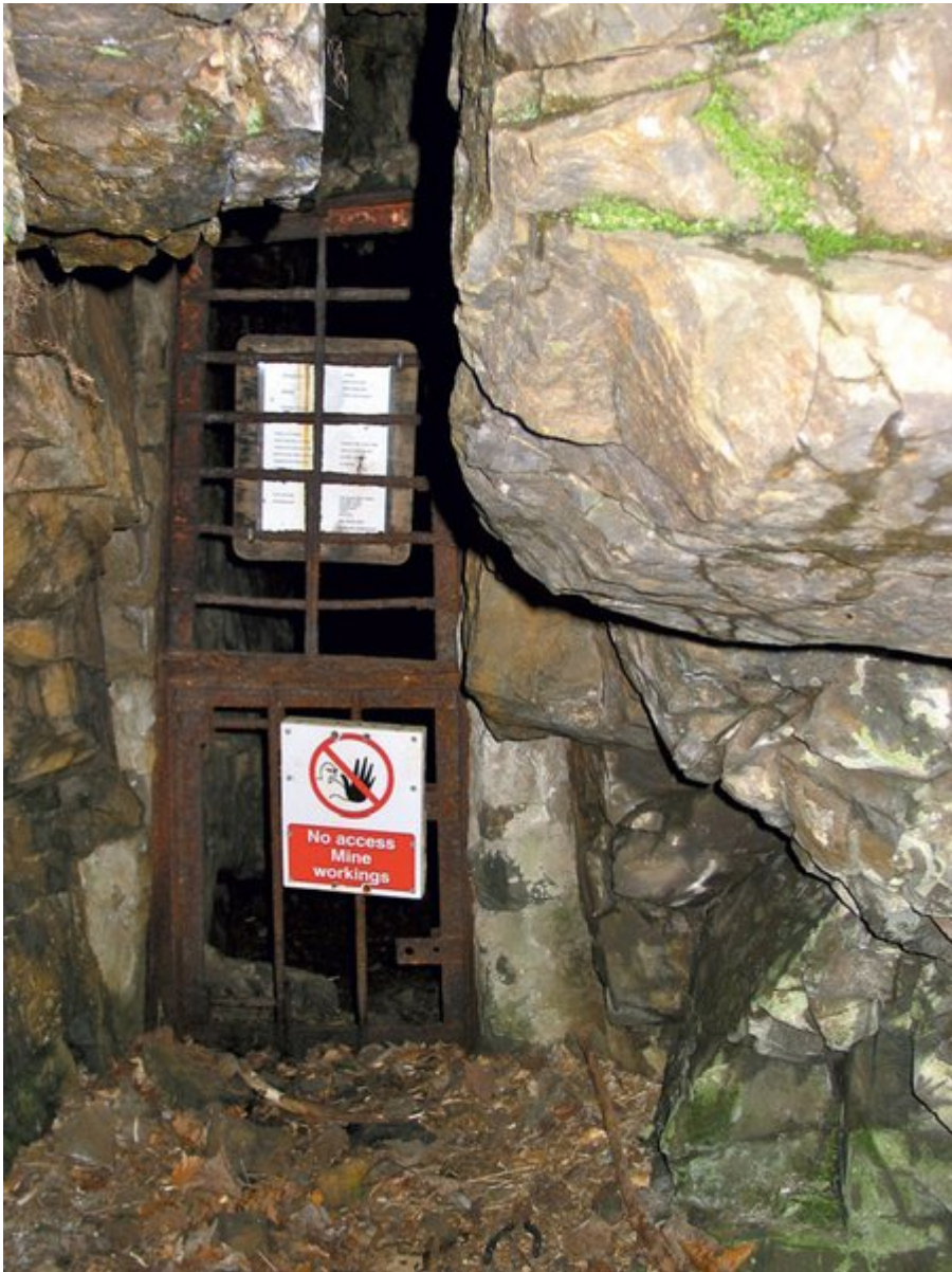
(Plate 6.2) Locality 6.2. Adit to the 'Silver Chamber' in east bank of Silver Burn.