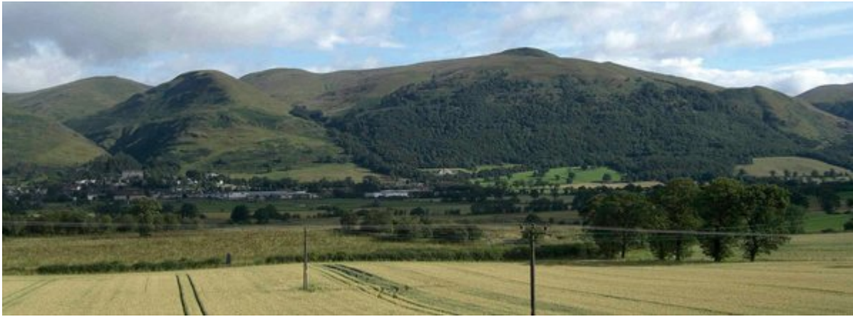
(Plate 6.1) View north across the Devon valley towards the West Ochil Fault-scarp. Alva Glen (left) and Silver Glen (right) lie on either side of the pointed hill (The Nebit).