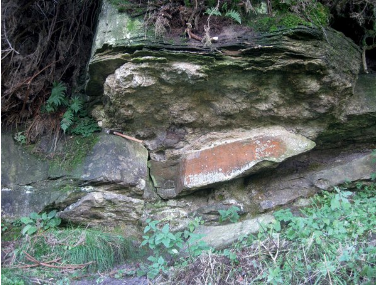
(Plate 9.2) Locality 9.2. Quarry exposure of nodular bed of calcrete, Kinnesswod Formation.