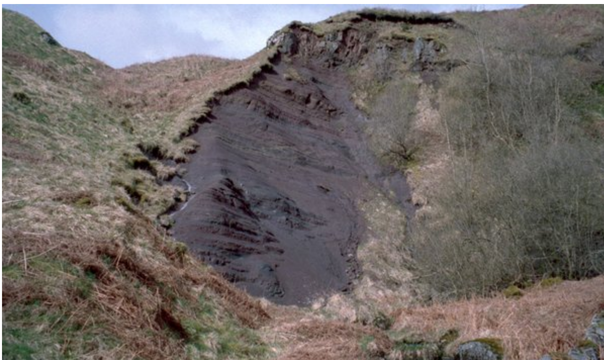
(Table 10.1) Characteristics of proximal and distal basaltic sequences