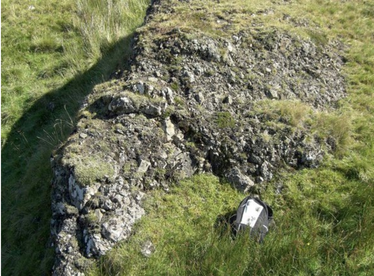
(Plate 10.2) Locality 10.7. Early Carboniferous blocky agglomerate in Kilewnan Burn, Dunmore, Fintry.