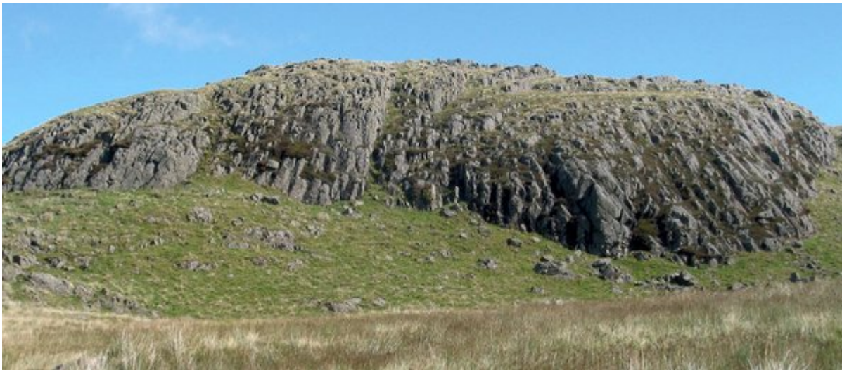
(Plate 10.3) Locality 10.9. Columnar jointing in basalt sill under summit of Dunmore, Fintry.