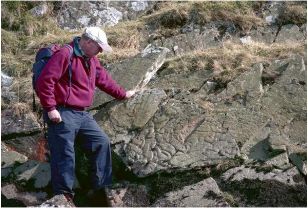
(Plate 12.3) Locality 12.8. Highland Boundary Fault in west bank of Keltie Water. See text for detail.