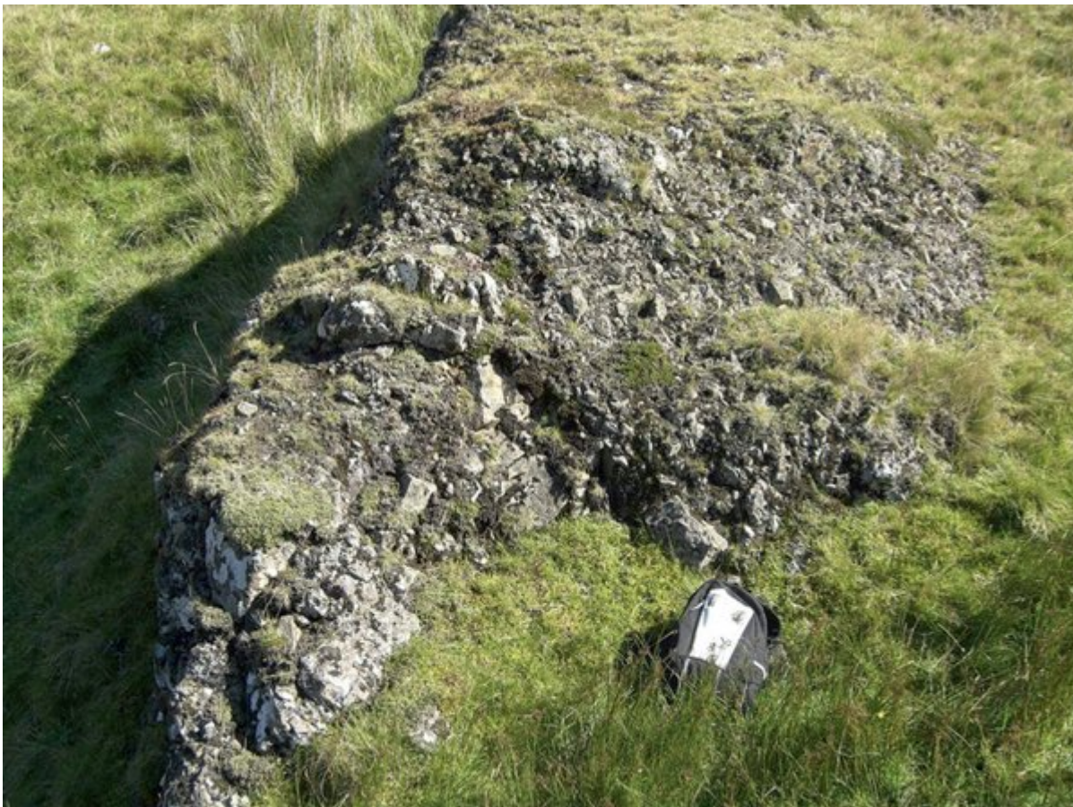
(Plate 12.1) Locality 12.5. Load casts on inverted beds of Keltie Water Grit Formation, Keltie Water.