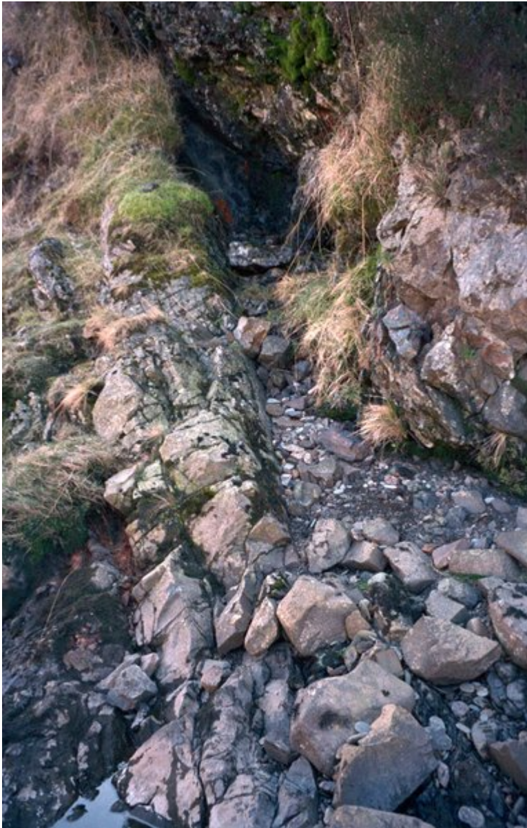
(Plate 12.2) Locality 12.6. Microgranite sill in Keltie Water, at inverted contact between the lower part of the Keltie Water Grit Formation (upstream, left) and the Keltie Limestone and Slate Member (downstream, right).