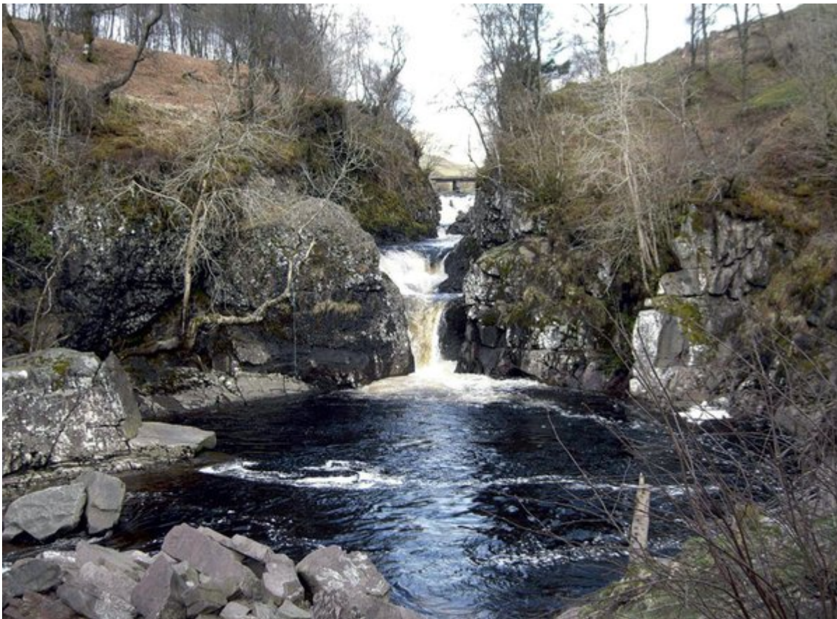
(Plate 13.2) Locality 13.1. Waterfall and gorge in Craig of Monievreckie Conglomerate Formation interbedded in Ruchill Flagstone Formation at Eas na Caillich.