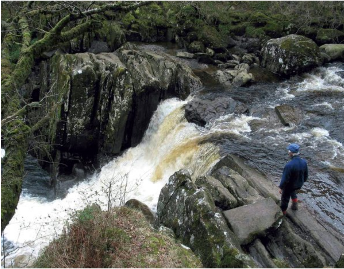
(Plate 13.5) Locality 13.4. Vertical beds of sandstone and conglomerate (Ruchill Flagstone Formation) at Bracklinn Falls, Keltie Water.