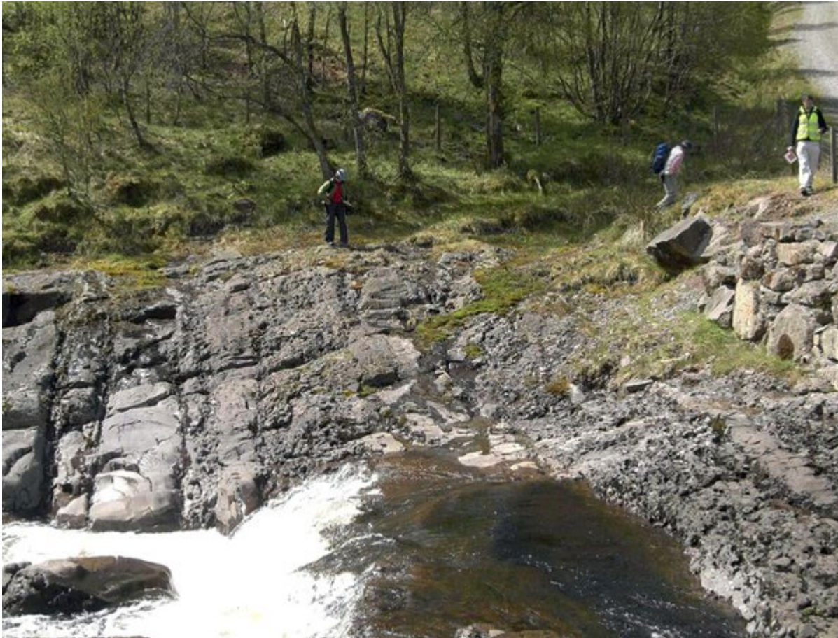
(Plate 13.1) Locality 13.1. Vertical beds of conglomerate and sandstone in the Ruchill Flagstone Formation, bridge over the Keltie Water, Eas na Caillich.