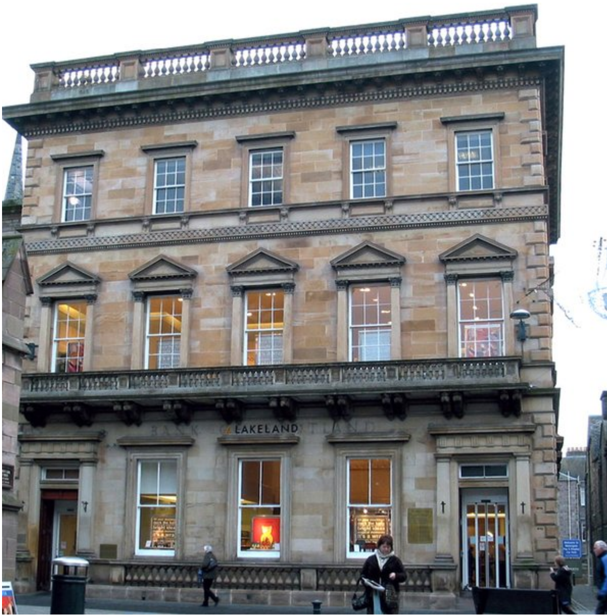
(Plate 16.2) Locality 16.2c. Former Bank of Scotland; blonde Carboniferous sandstone.

(Plate S.13) Perth Old City Hall, built of Lower Devonian sandstone from Leoch Quarry, West Dundee. See Excursion 16.