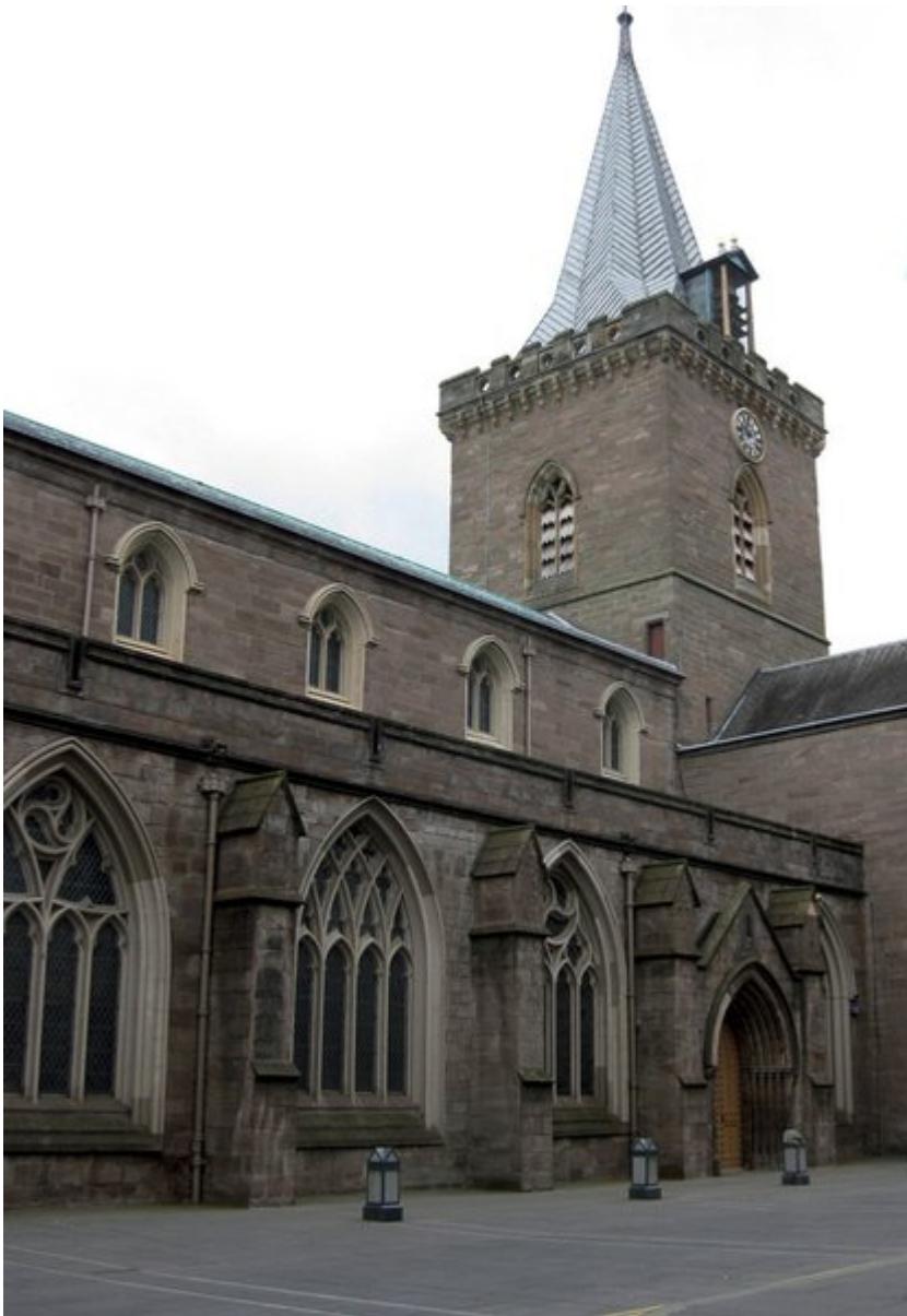
(Plate 16.1) Locality 16.1. St John's Kirk; sandstones from various quarries in Scone Sandstone Formation.