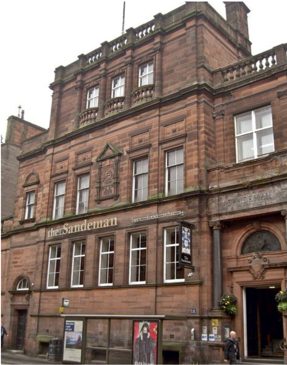
(Plate 16.5) Locality 16.13 Sandeman Building; red Permian sandstone, Locharbriggs, Dumfries.