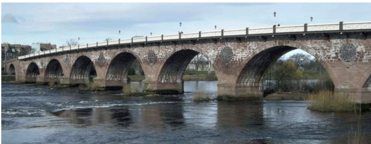
(Plate 16.3) Locality 16.5a. Smeaton Bridge; sandstone from Scone Sandstone Formation, Quarrymill.