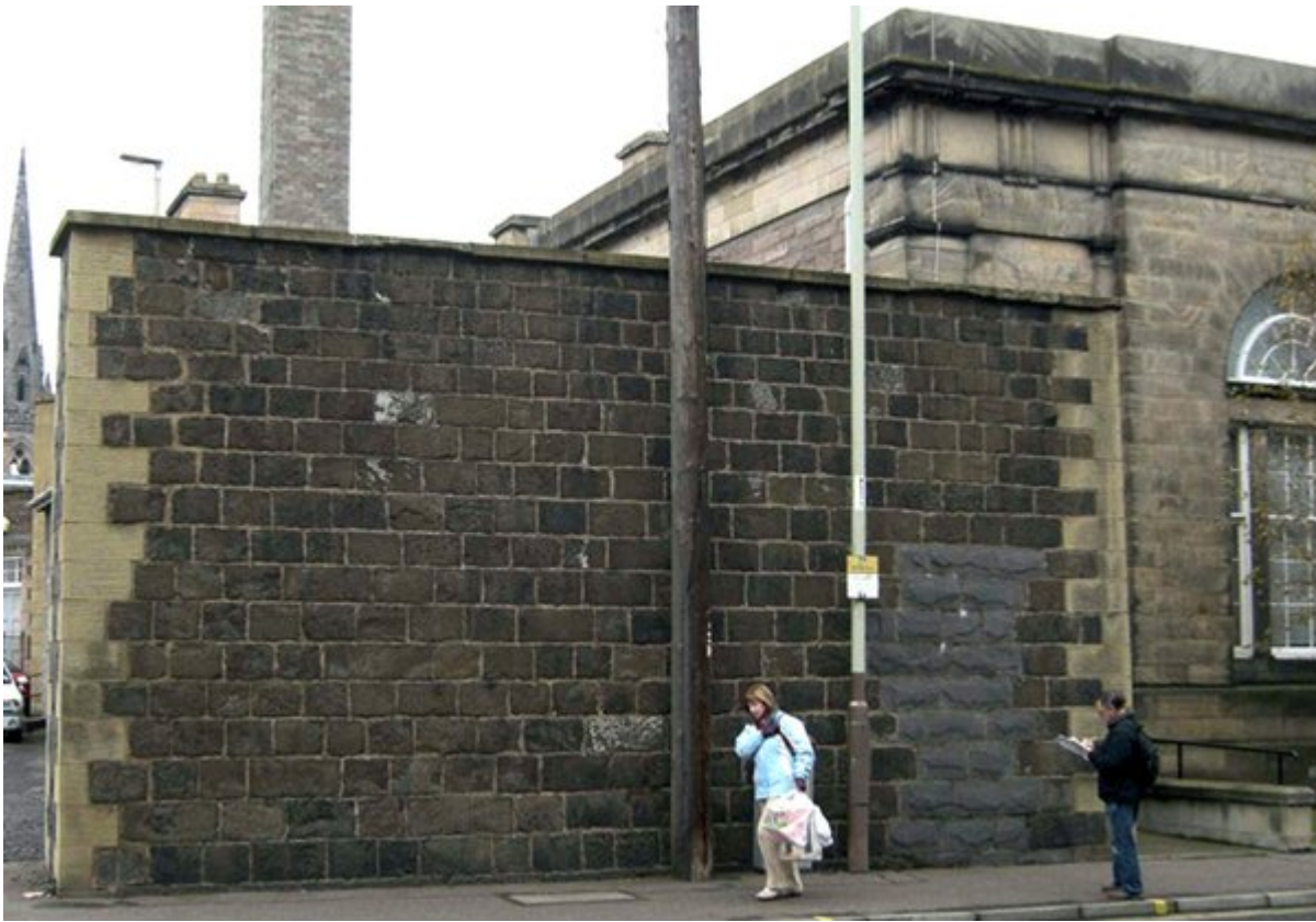
(Plate 16.4) Locality 16.11. Wall of demolished former town jail; quartz-dolerite from Lamberkine Quarry.