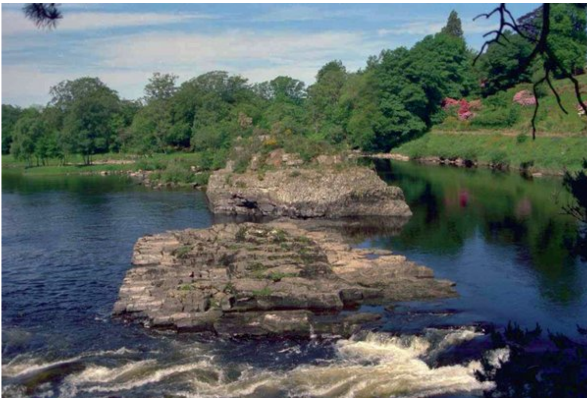
(Plate S.10) (opposite page, below) Late Carboniferous quartz-dolerite dyke, showing right-lateral stepped contact and horizontal columnar joints, River Tay east bank, Campsie Linn. See Excursion 17.