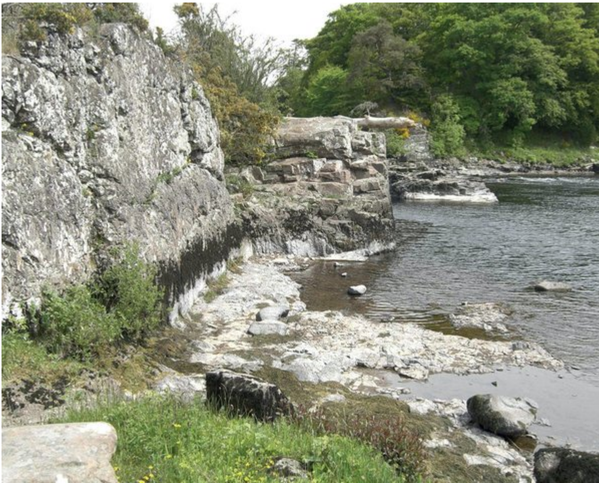
(Plate 17.4) Locality 17.2. Late Carboniferous quartz-dolerite dyke, showing right-lateral stepped contact with discoloured baked Cromlix Mudstone (right), River Tay west bank, Campsie Linn.