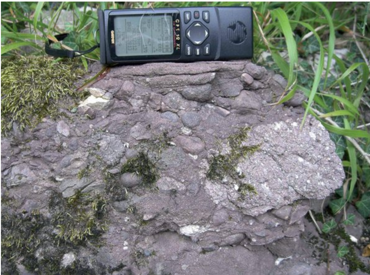
(Plate 17.3) Locality 17.1. Conglomerate in Campsie Limestone Member of Scone Sandstone Formation, River Tay, Stanley Mills.