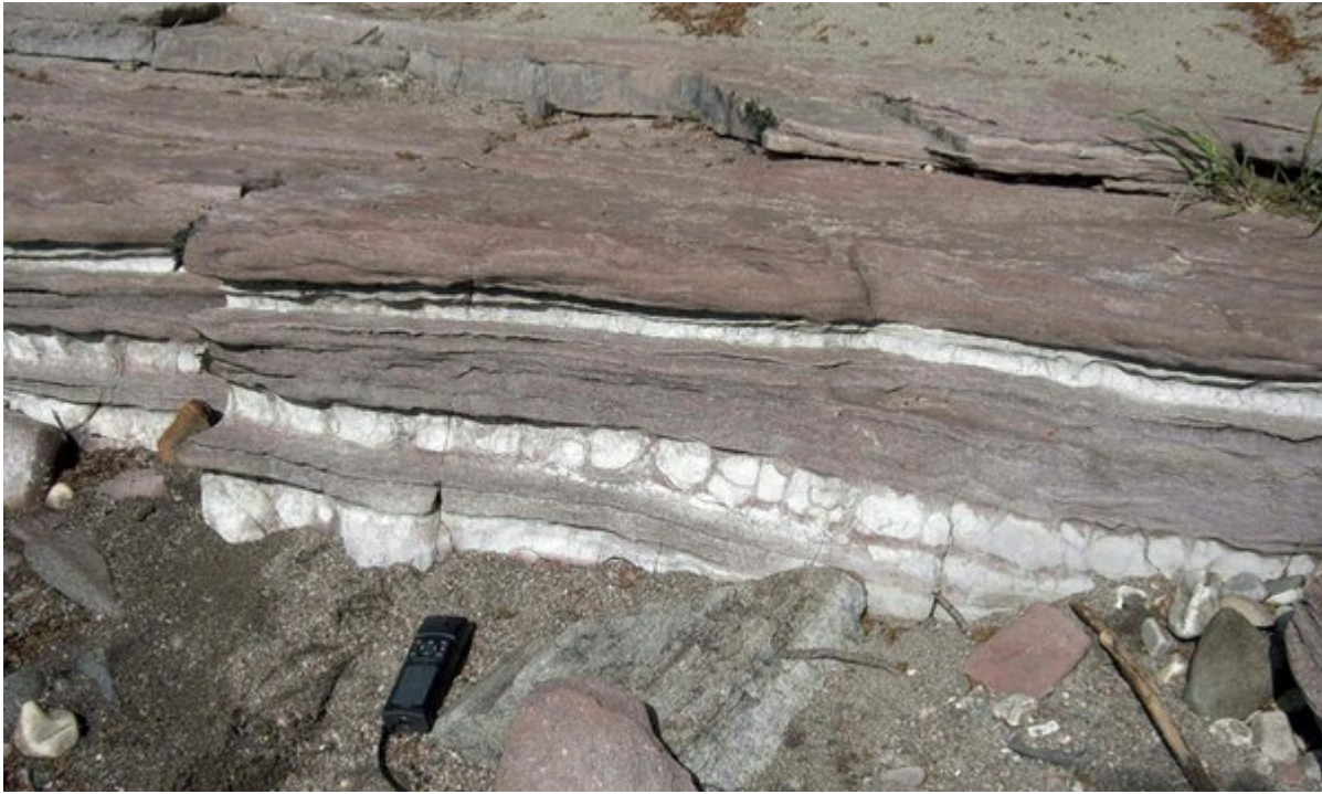
(Plate 17.2) Locality 17.1. Beds of nodular calcrete in Stanley Limestone Member at top of Scone Sandstone Formation, River Tay, Stanley Mills.