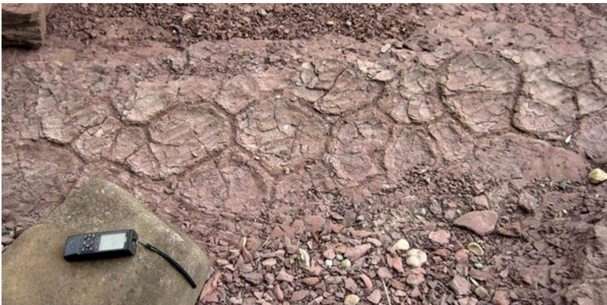
(Plate 17.1) Locality 17.1. Desiccation cracks in Cromlix Mudstone Formation, River Tay, Stanley Mills.