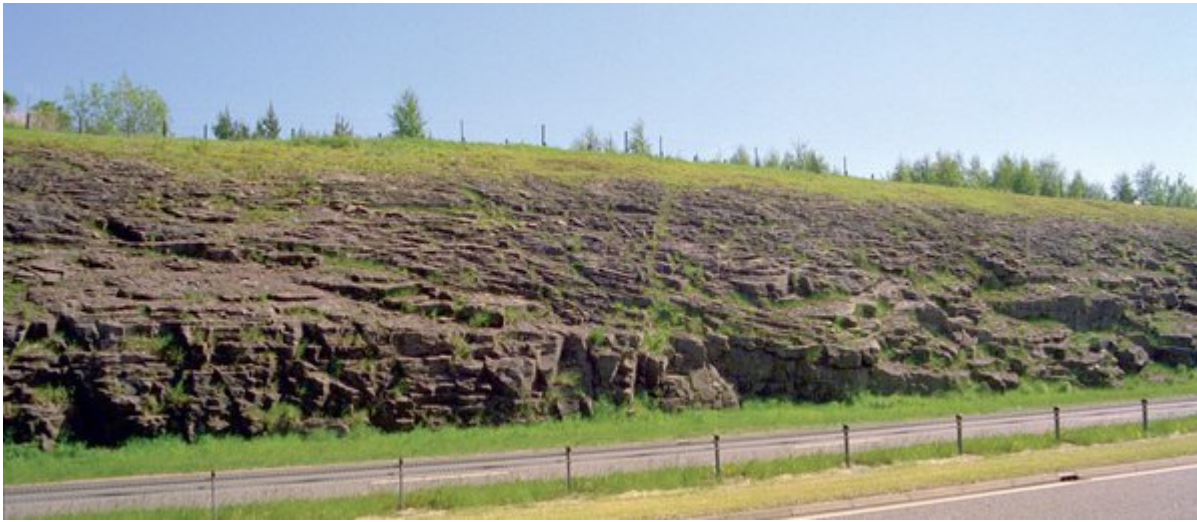
(Plate S.3) Trough cross bedding in Lower Devonian sandstone, A9 road cutting at Crossgates, Perth.

(Plate S.2) Lower Devonian volcanoclastic conglomerate at cave east of Dumyat summit. See Excursion 5.