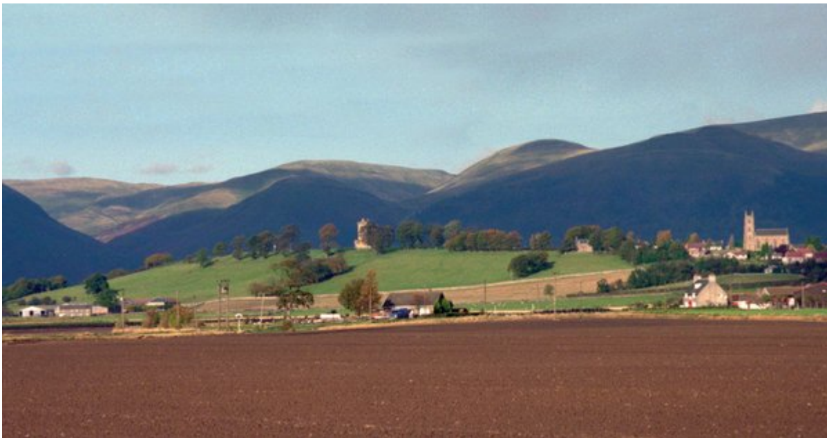
(Plate S.11) Drumlin sculped from glacial till at Clackmannan Tower, 500 m west of Clackmannan town; Holocene raised Carse Clay in foreground.