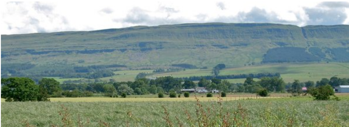
(Plate S.5) Trap featuring in Lower Carboniferous Clyde Plateau Volcanic Formation, north side of Gargunnock Hills.