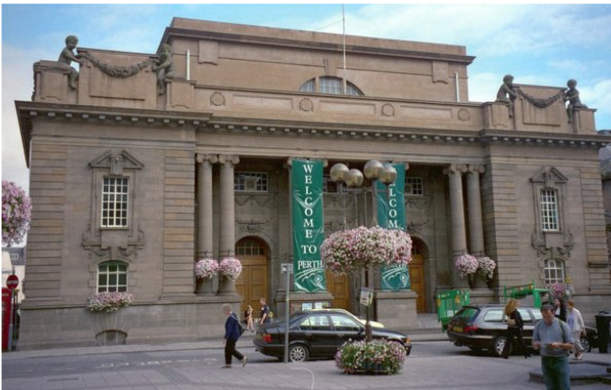
(Plate S.13) Perth Old City Hall, built of Lower Devonian sandstone from Leoch Quarry, West Dundee. See Excursion 16.