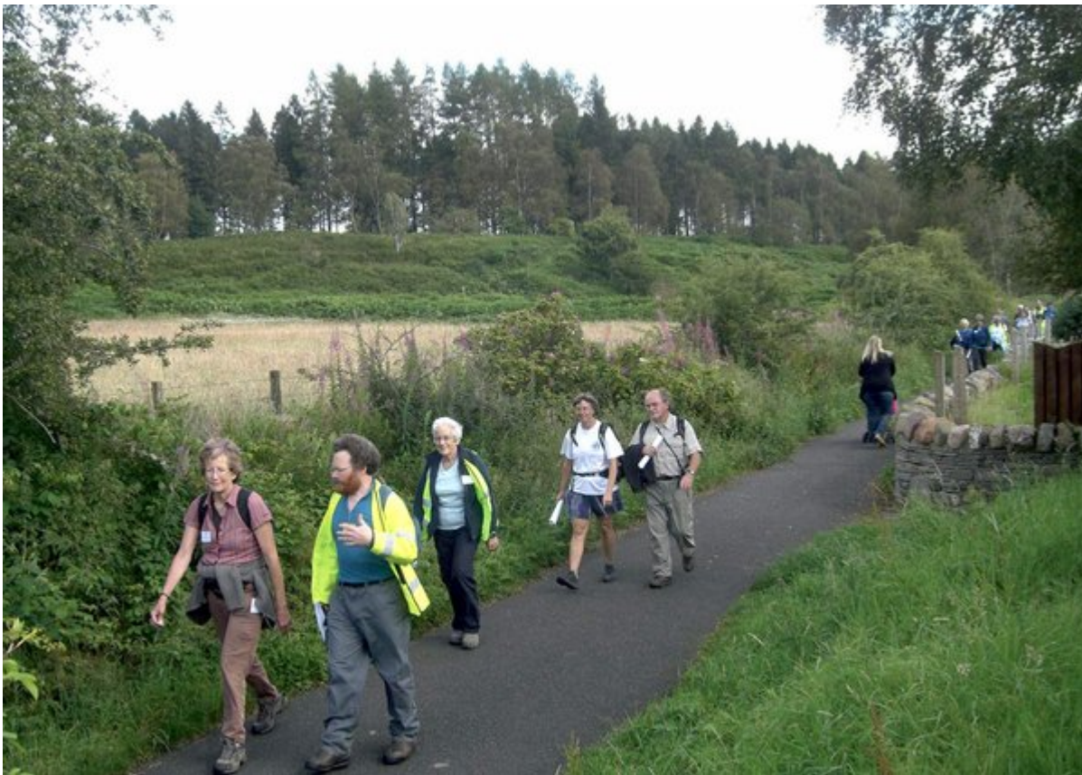
(Plate S.12) Terminal (push) moraine at Drumdhu Wood, Callander. See Excursion 8.