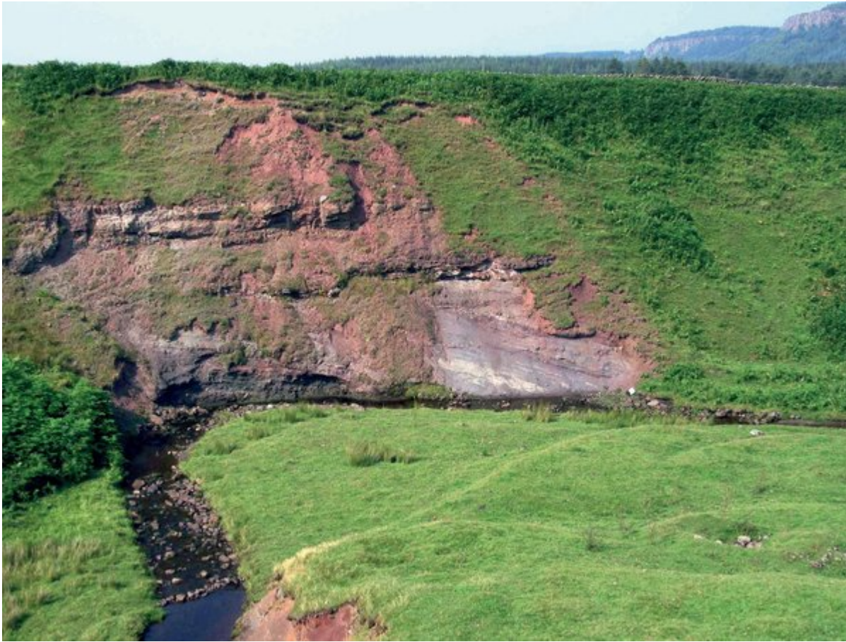
(Plate S.6) Disconformity between Kirkwood Formation and the overlying Lawmuir Formation. Outlines of clamp kilns in foreground; Lewis Hill Quartz-dolerite Sill forms crags in background. See Excursion 2.