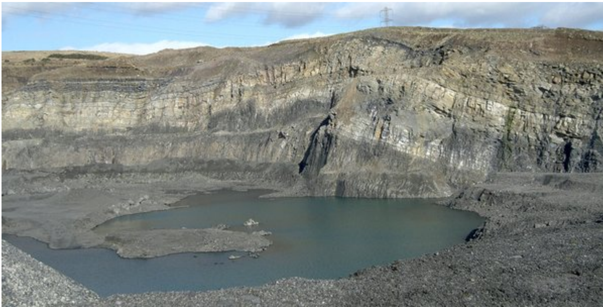
(Plate S.9) Quartz-dolerite of the Midland Valley Sill-complex with overlying Upper Limestone Formation, Kilsyth.