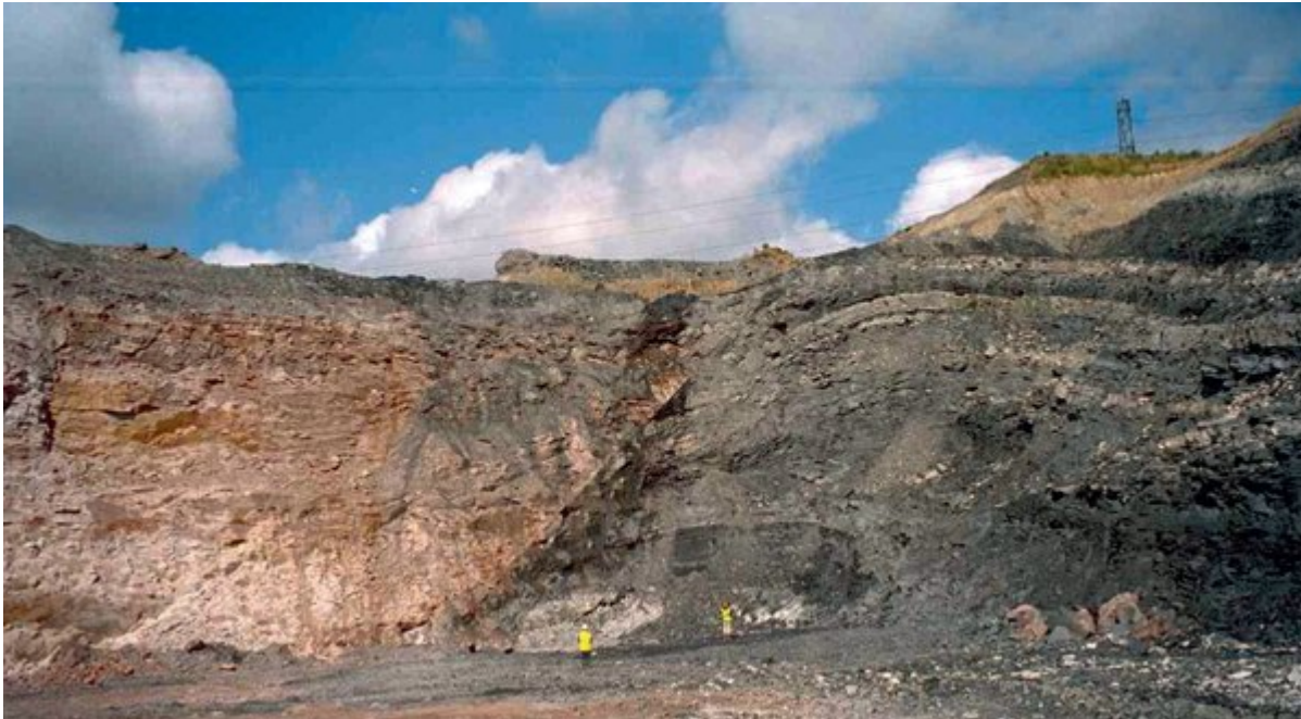
(Plate S.8) Meadowhill opencast coal site showing Langfauld Fault, separating Middle Coal Measures (left), from Passage Formation (right). (Plate 5.9) (opposite page, middle) Quartz-dolerite of the Midland Valley Sill-complex with overlying Upper Limestone Formation, Kilsyth.