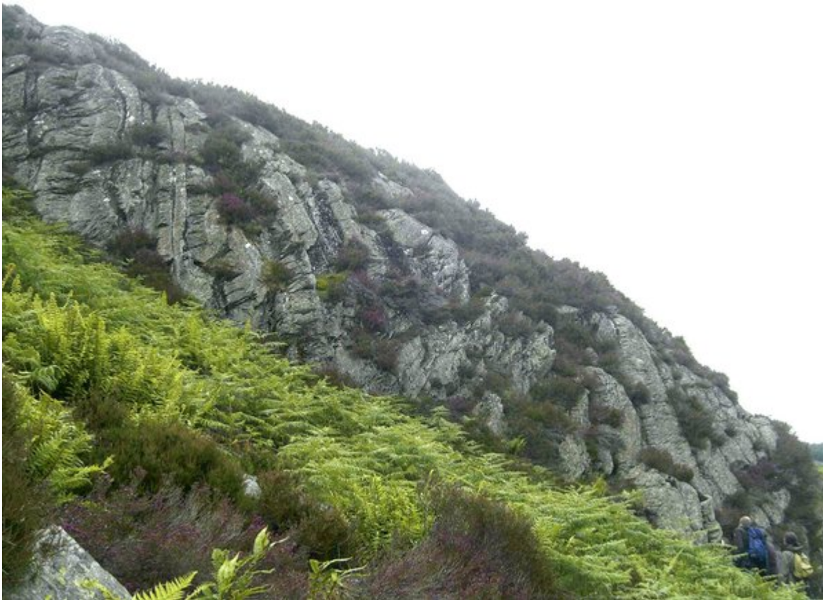
(Plate S.1) Downward-facing F_1 folds close to the downbent hinge zone of the Tay Nappe in Dalradian rocks at Little Glen Shee. See (Figure 18.3) .