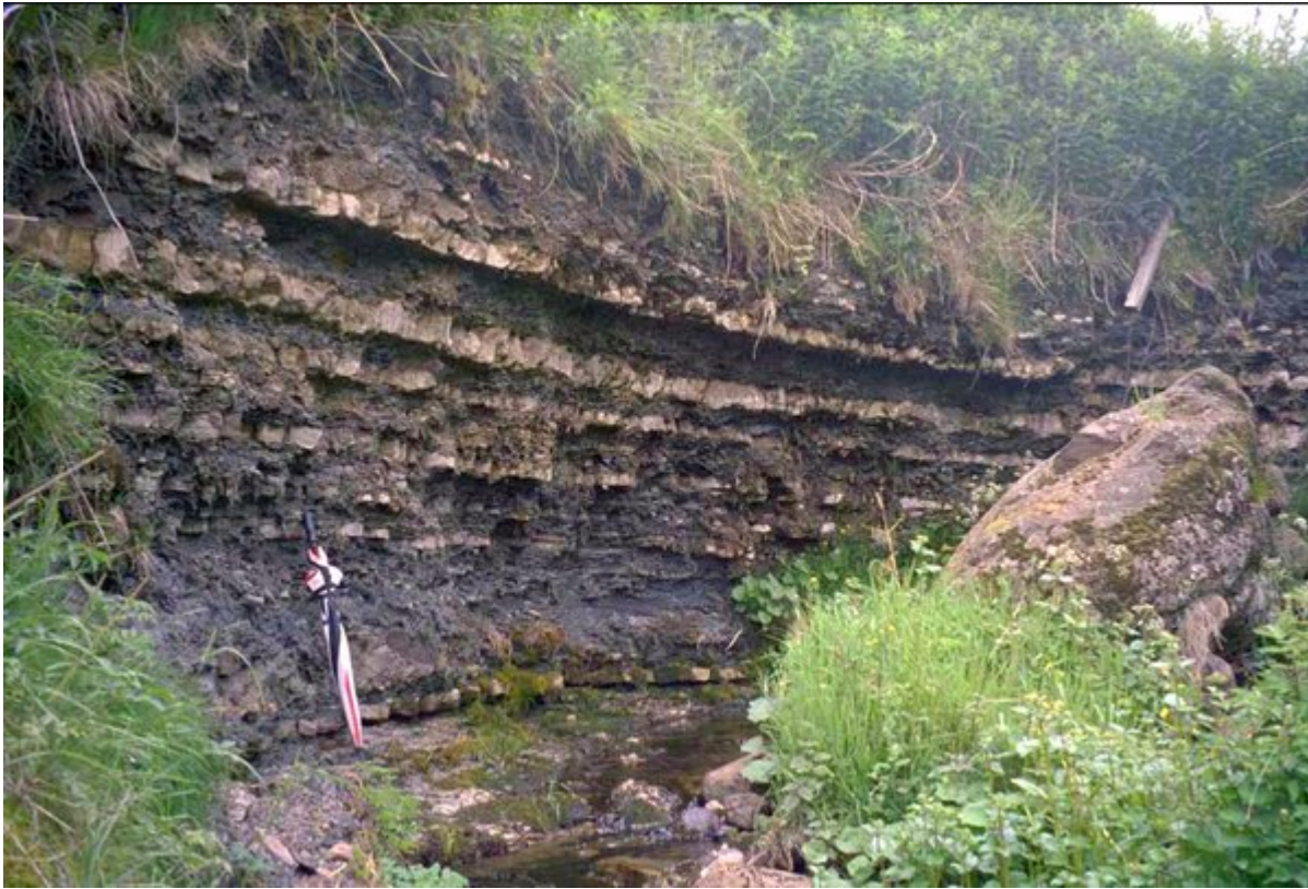
(Plate S.4) Lower Carboniferous Ballagan Formation mudstones with beds of dolostone (cementstone) in Banton Burn. See Excursion 11.