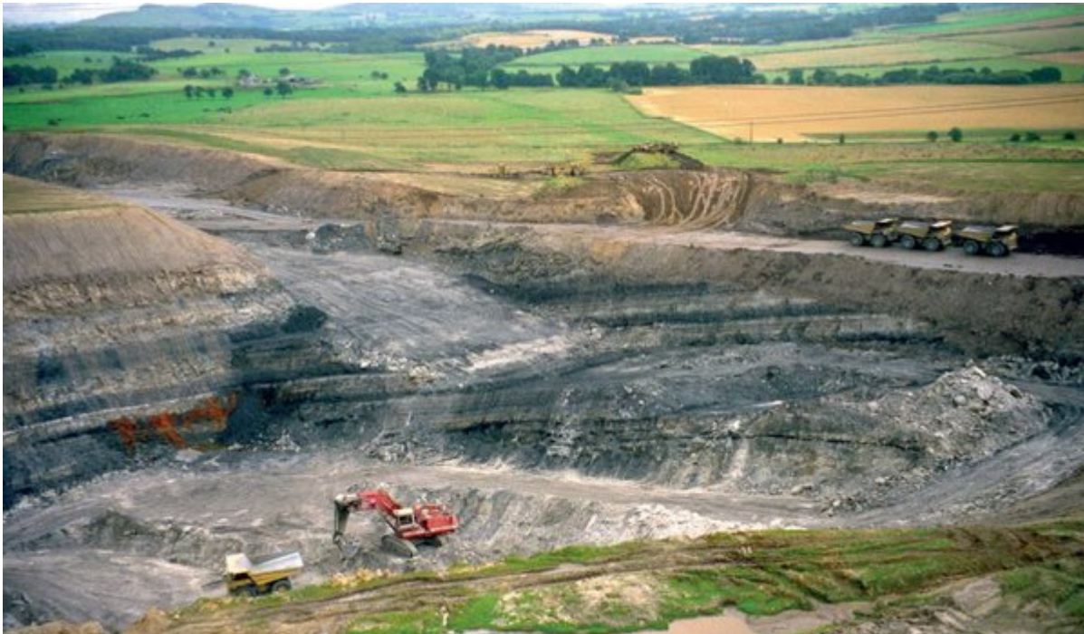
(Plate S.7) Meadowhill opencast coal site (Clackmannanshire), Lower Coal Measures, now infilled.