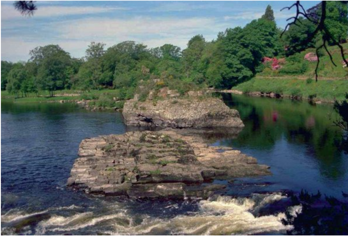
(Plate S.10) (opposite page, below) Late Carboniferous quartz-dolerite dyke, showing right-lateral stepped contact and horizontal columnar joints, River Tay east bank, Campsie Linn. See Excursion 17.