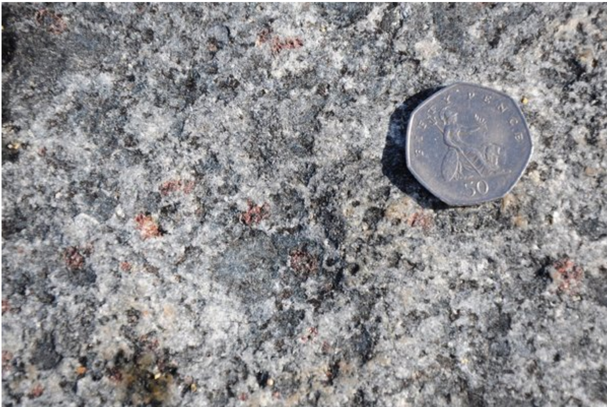
(Figure 6) Coarse-grained granoblastic rocks containing garnet (locality 7).