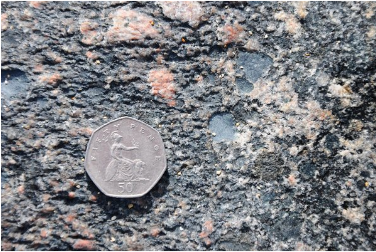
(Figure 7) Coarse-grained granoblastic rocks containing greasy green chlorite-rich pseudomorphs after orthopyroxene (locality 7). These rocks are close to the inferred orthopyroxene isograd.