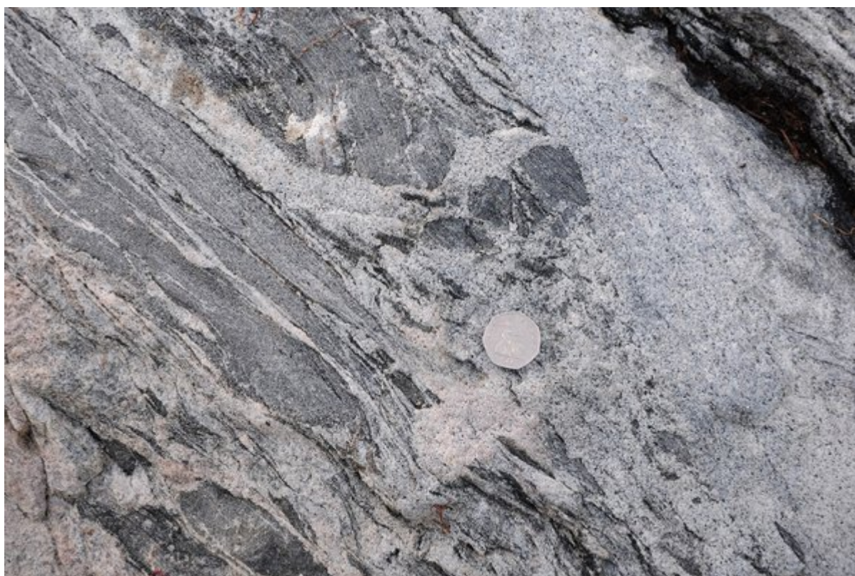
(Figure 2) Typical diatexitic migmatite around West Haven comprising biotite-rich schlieren, schollen of migmatized semipelite (left) and pale granitic leucosome containing dark cordierite pseudomorphs.