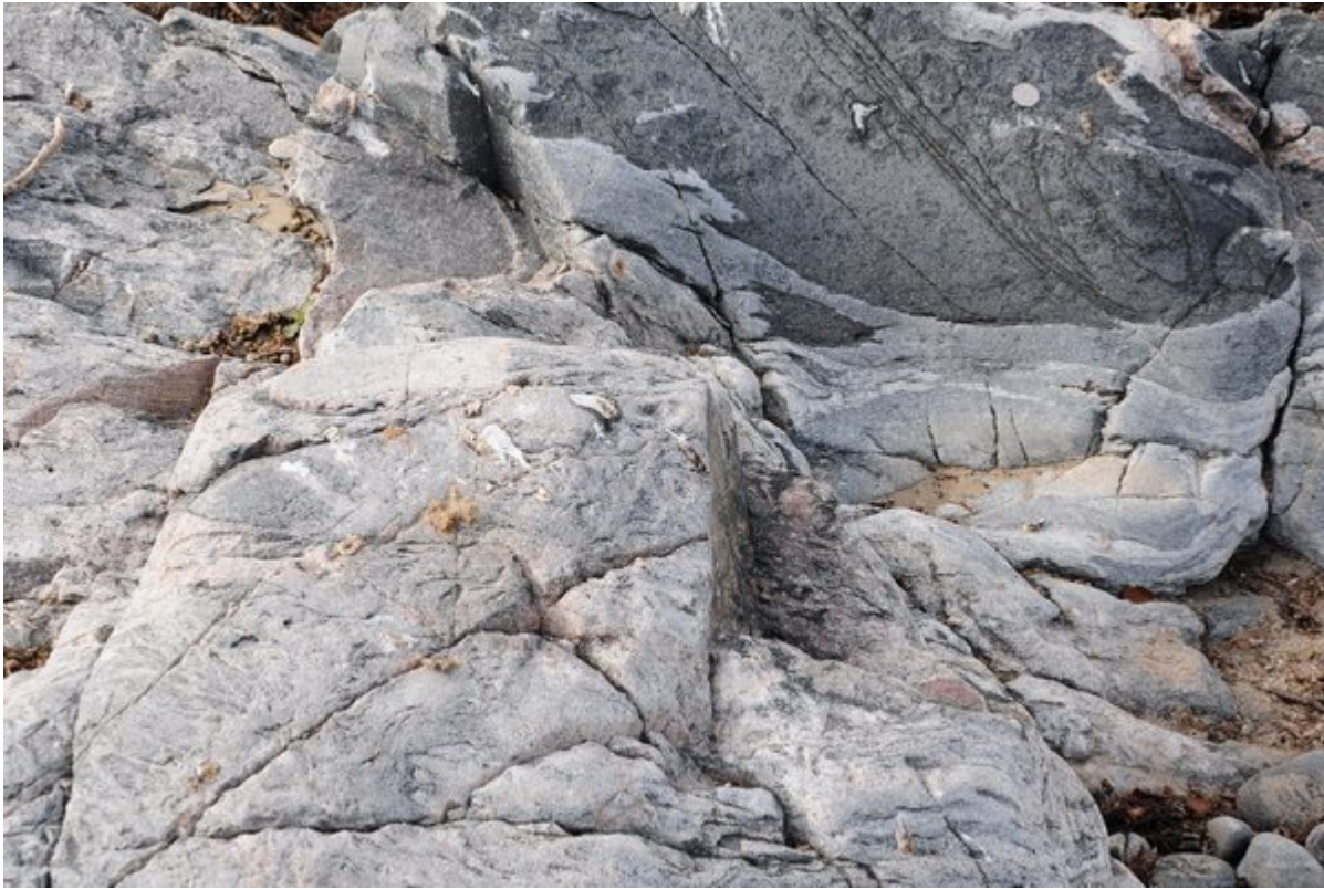
(Figure 3) Contact between diorite and migmatite. The dark diorite commonly occurs as rounded 'pillows' with wispy diffuse margins suggesting mingling of magmas. The diatexitic migmatite in the foreground is very rich in leucosome (50 pence on diorite for scale; locality 2).