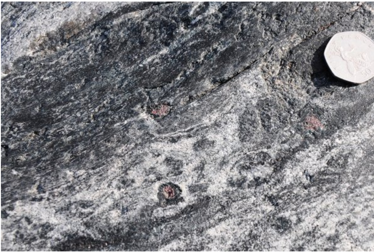
(Figure 5) The pale leucosome contains abundant schollen and schlieren and porphyroblasts of garnet that are partially to completely replaced by chlorite (locality 5).