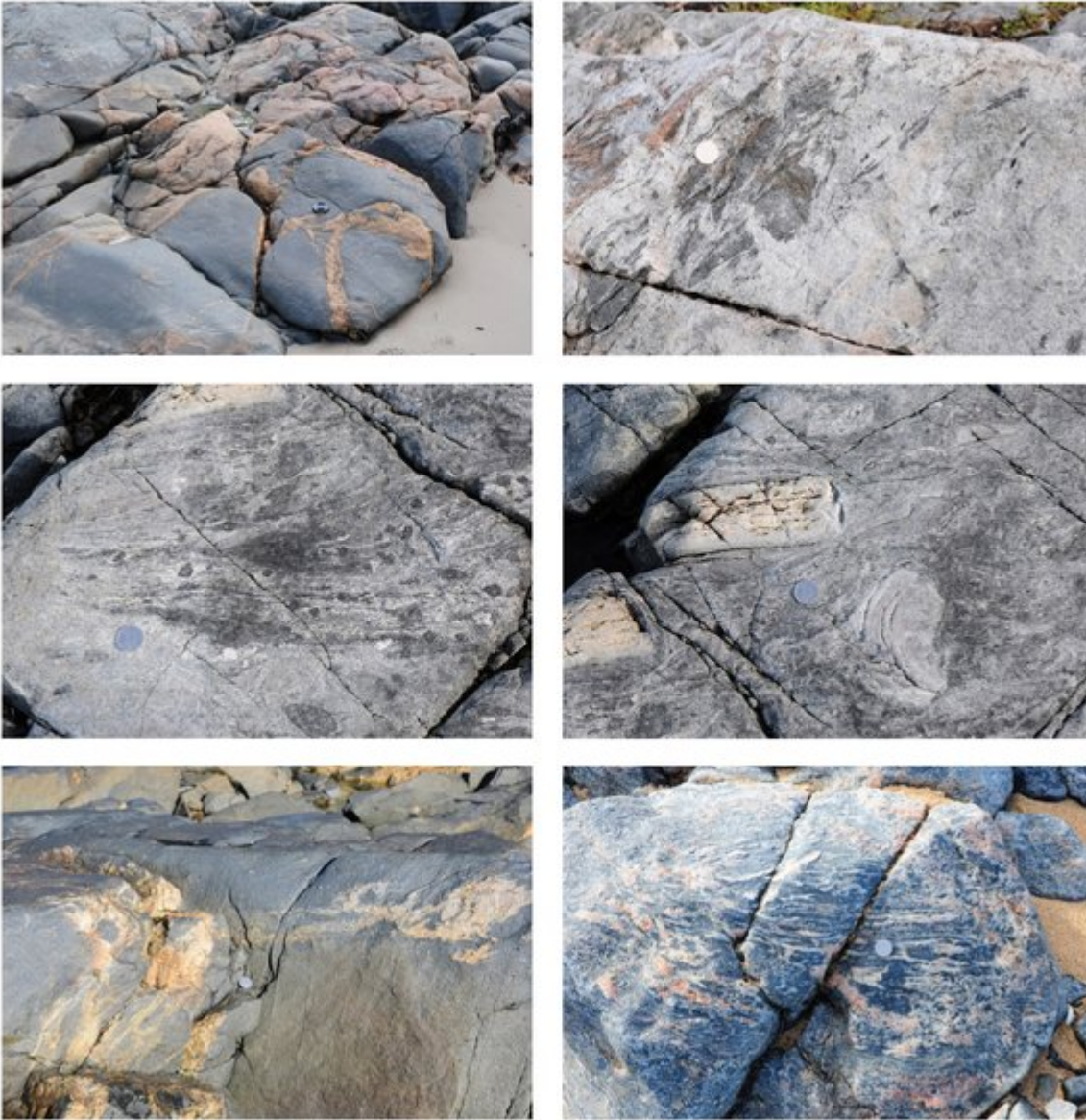
(Additional field photographs 1) Top left — Diorite intruded by veins of coarse-grained granitic leucosome derived from proximal migmatites (locality 1). Top right — Leucosome-rich diatexite containing biotite schlieren and migmatized semipelitic schollen (locality 2). Middle left — Granulite facies diatexite containing two distinct leucosome types. Most leucosome is grey in colour and contains abundant small chlorite-rich pseudomorphs after cordierite. The pale-coloured leucosome running from left to right through the centre contains abundant biotite schlieren and large garnet porphyroblasts that are partly to completely replaced (locality 4). Middle right — Schollen diatexite comprising a chaotic mix of two types of leucosome, schlieren, mafic minerals and schollen of metapsammite and calc-silicate (locality 4). Bottom left — The St Combs diorite containing wispy diffuse veins of leucosome derived from nearby migmatites (locality 5). Bottom right — Flattened metasemipelitic schollen within residual coarse-grained granoblastic migmatites (locality 6).