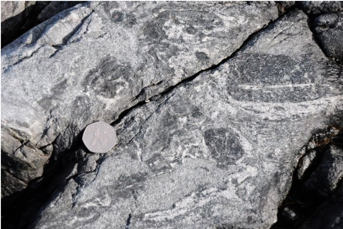
(Figure 4) Typical schollen diatexitites (locality 5). Migmatized schollen of spotted metapelite are surrounded by pale garnet-bearing leucosome that is mingled with grey cordierite-bearing leucosome.