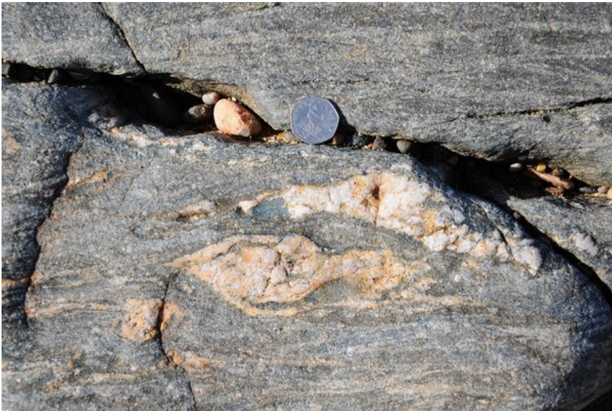
(Figure 8) Typical residual migmatites close to Inzie Head (locality 8). Pseudomorphs after orthopyroxene commonly occur within coarse discontinuous leucosomes.