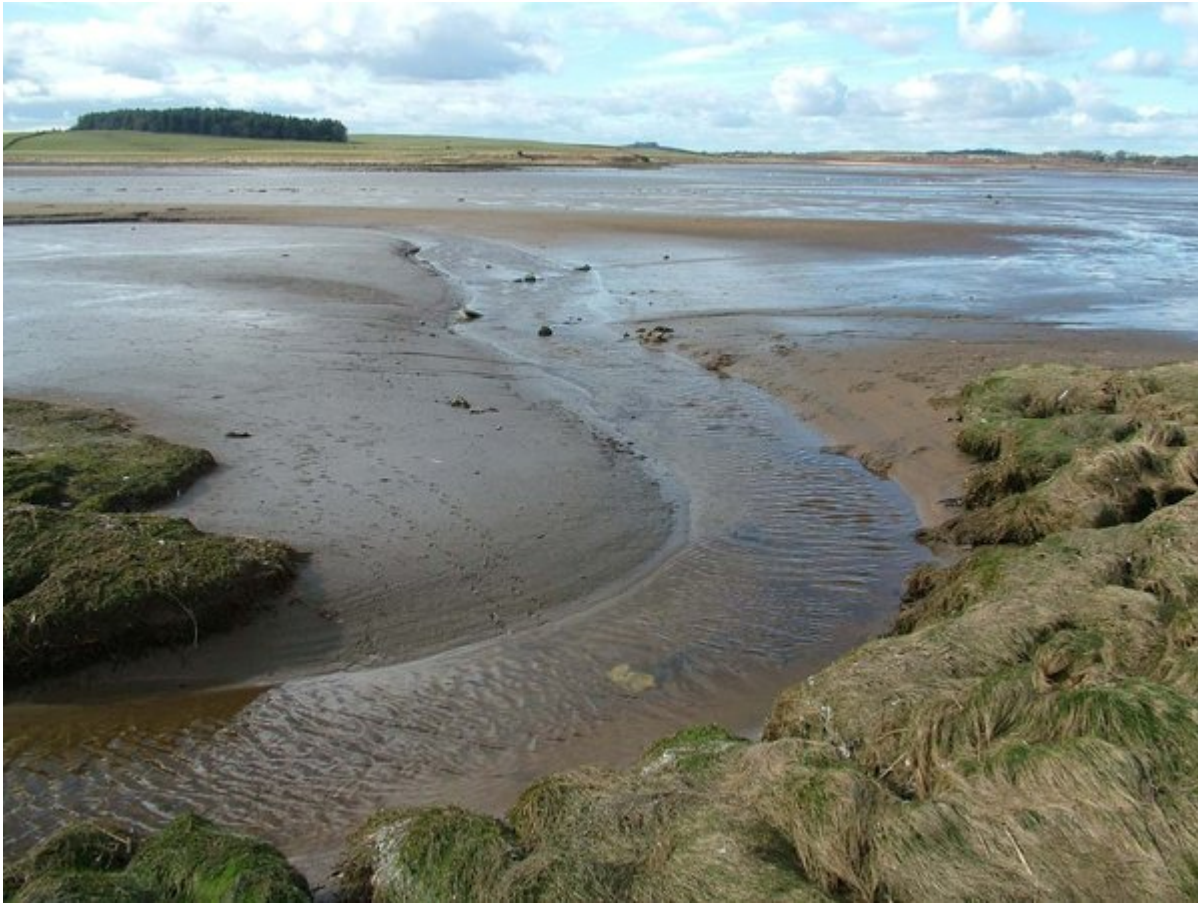
(Figure 2) Stream emerging from saltmarsh and crossing mudflat towards channel at Locality 1.