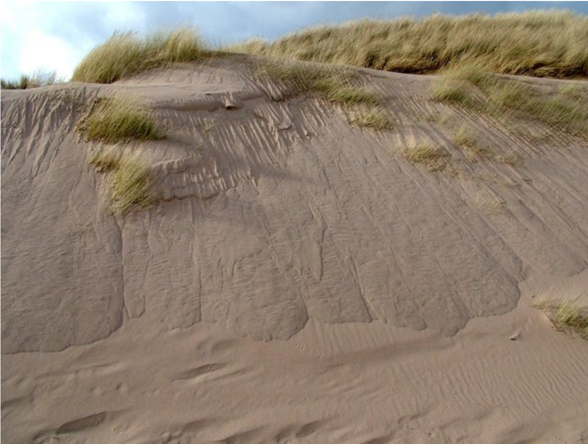
(Figure 9) Small dune face with grain flow lobes advancing over, and burying, marram grass. Foveran links Locality 10.