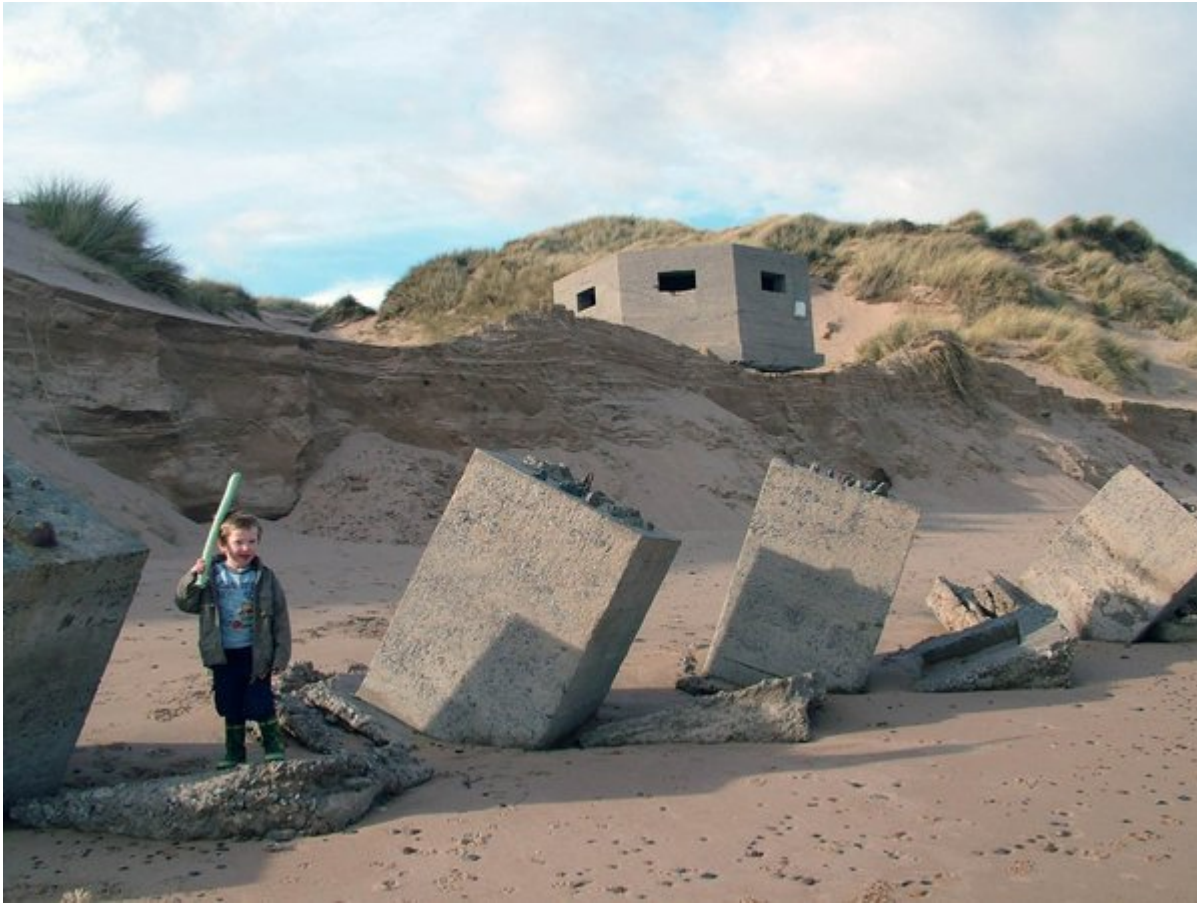
(Figure 11) Erosion in March 2008 revealing tank traps in front of blockhouse near Menie links. Locality 11.