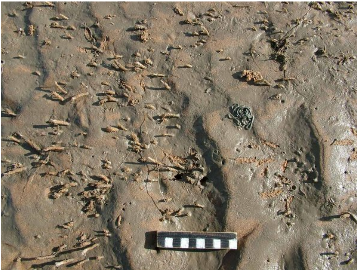
(Figure 8) Pebble pavement at Locality 9 with mussels ( Mytilus ) and barnacles attached to pebbles.