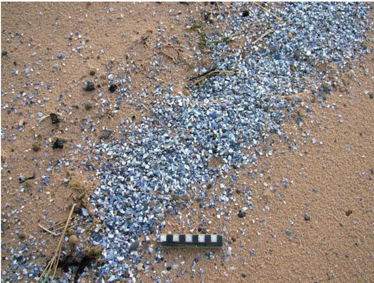
(Figure 5) Mussel fragments resulting from eider duck predation on mussels concentrated at strandline. Estuary beach near Locality 5.