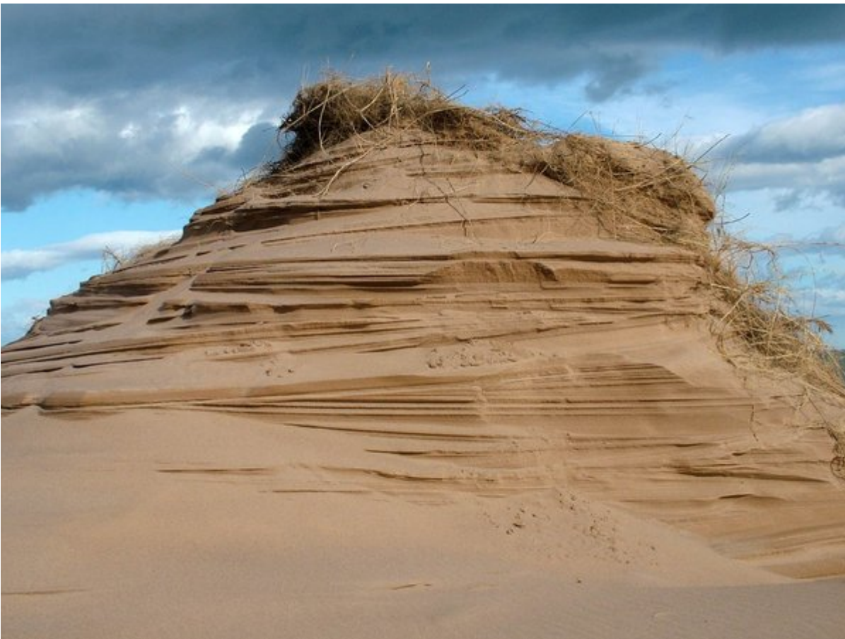
(Figure 10) Eroding dune with a cap of marram grass, the roots exposed due to erosion. The dune sands show aeolian cross-bedding. Foveran Dunes Locality 10