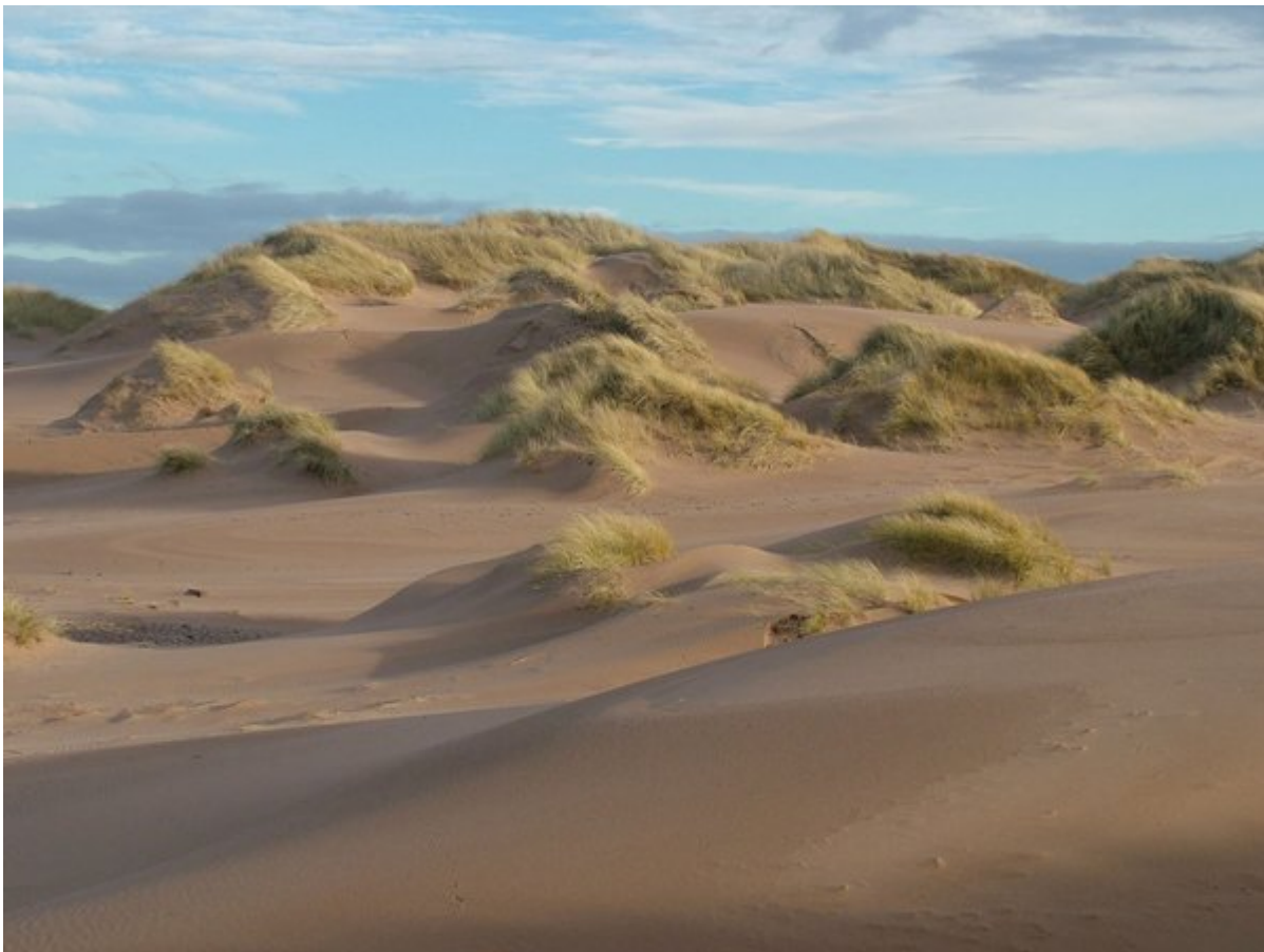
(Figure 4) General view of dune surface with areas stabilised by marram grass. Locality 5.