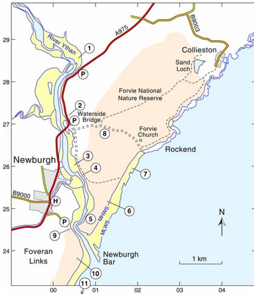
(Figure 1) Locality map of the Ythan Estuary. Intertidal sediments are indicated in yellow, and the extent of sand dunes in pale brown. In the north of the Forvie reserve the dunes are all vegetated.