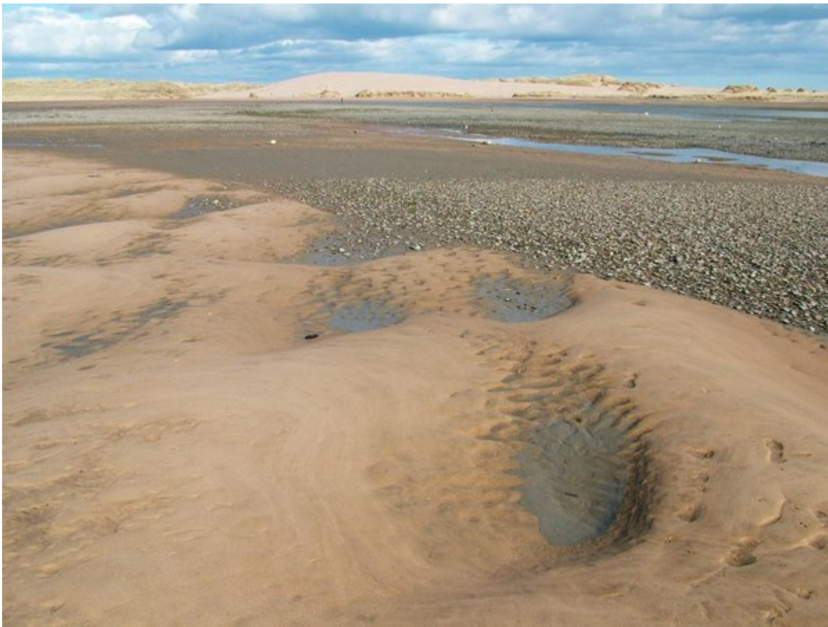
(Figure 6) View across estuary from Locality 9. Small dunes and ripples with mud drapes in foreground. Pebble pavement near low tide level extends to river channel. Large active dune of Locality 5 in the distance.