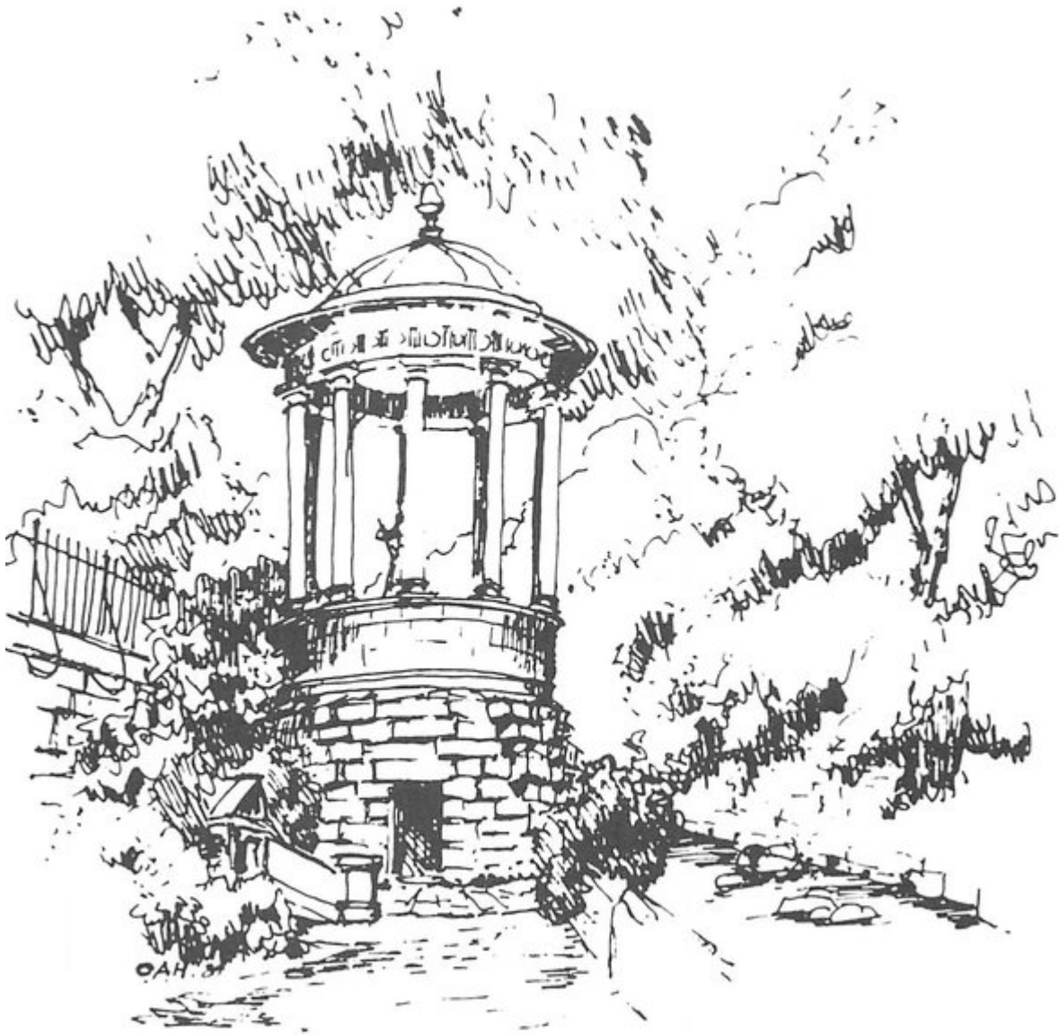
(Figure 9) St Bernard's Well, by C. A. Hope from 'The Water of Leith', Jamieson 1984.