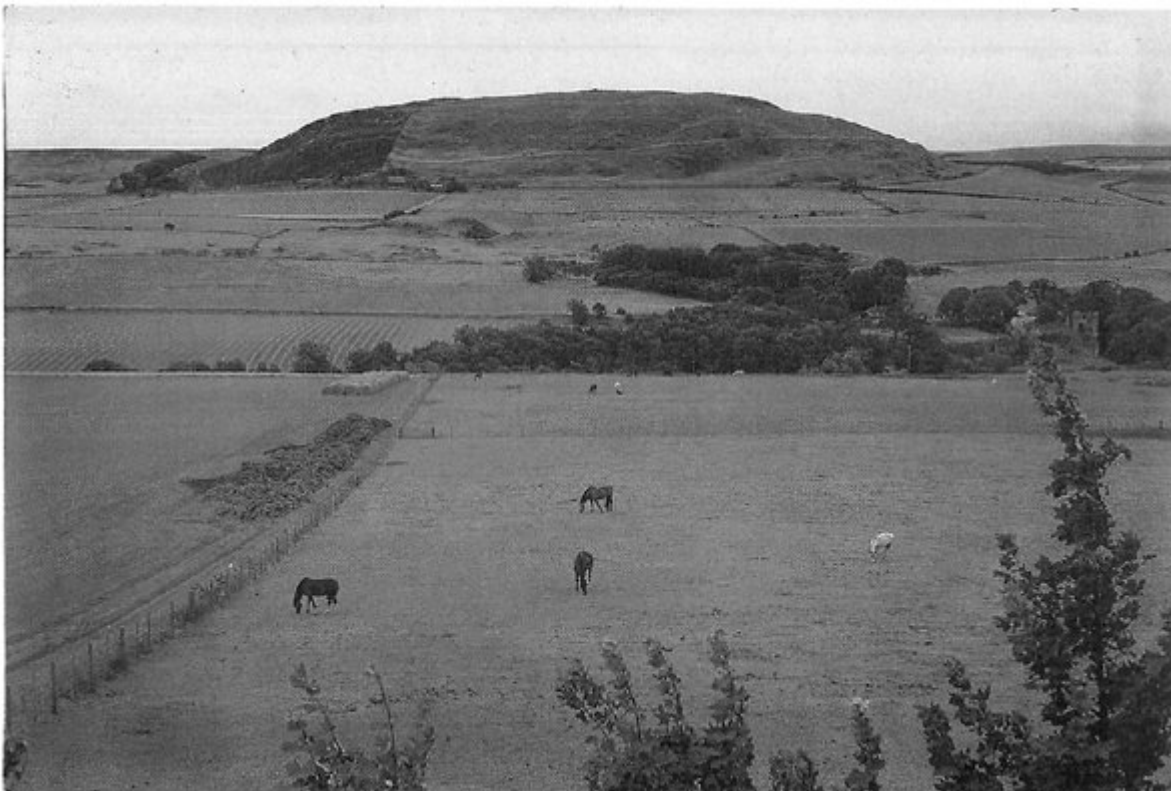
(Plate 2) Phonolitic laccolith, Traprain Law, from Pencaraig.