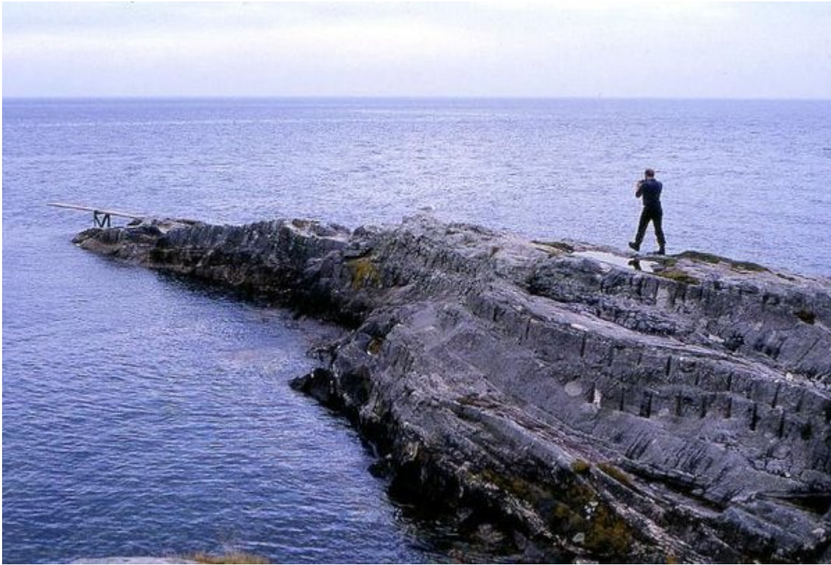
(Figure 7) Ferry Rock (Locality 9), note the tool marks on the right where the white sandstone was quarried.