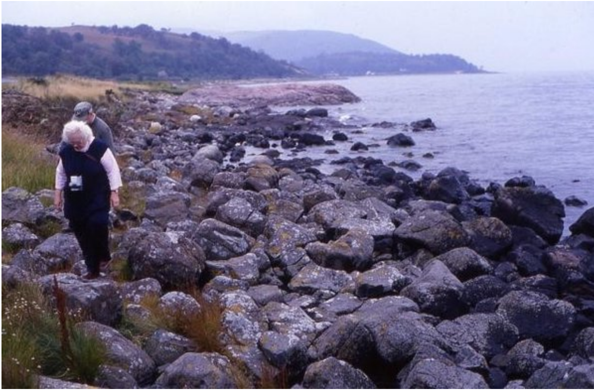
(Figure 5) The lower part of the Clyde Plateau Volcanic Formation (Locality 5)