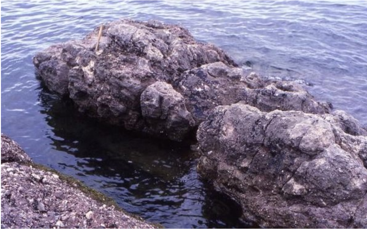
(Figure 4) Cornstone bed at Locality 3; top of the Upper Old Red Sandstone on lower left Locality 4. Volcanic breccia [NS 02322 44141]. A sudden break in the sedimentary