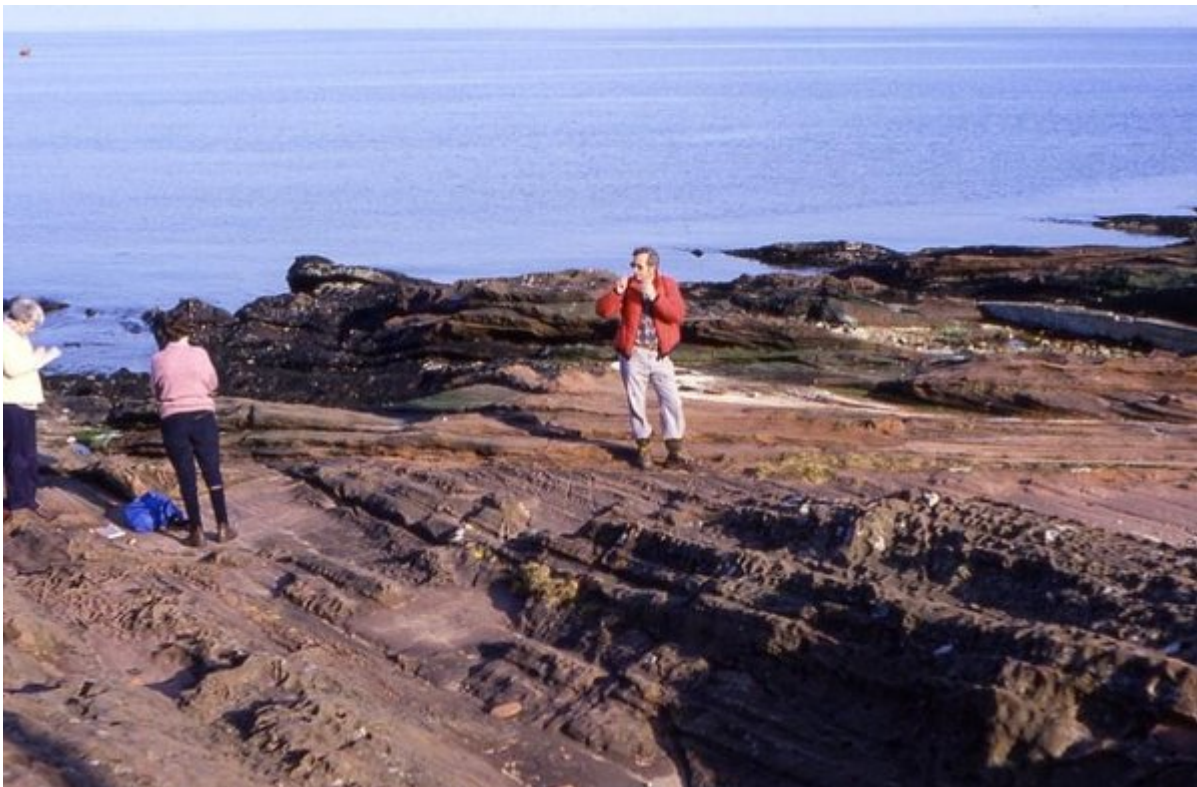
(Figure 10) Dune bedded Permian Corrie Sandstone south of the Carboniferous/Permian unconformity at Locality 12.