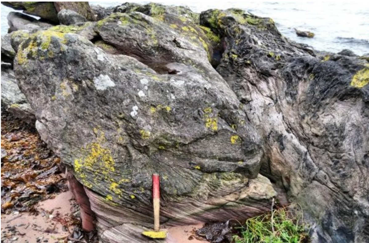
(Figure 8) Highly contorted bedding in the sandstone at the top of the Coal Measures succession.