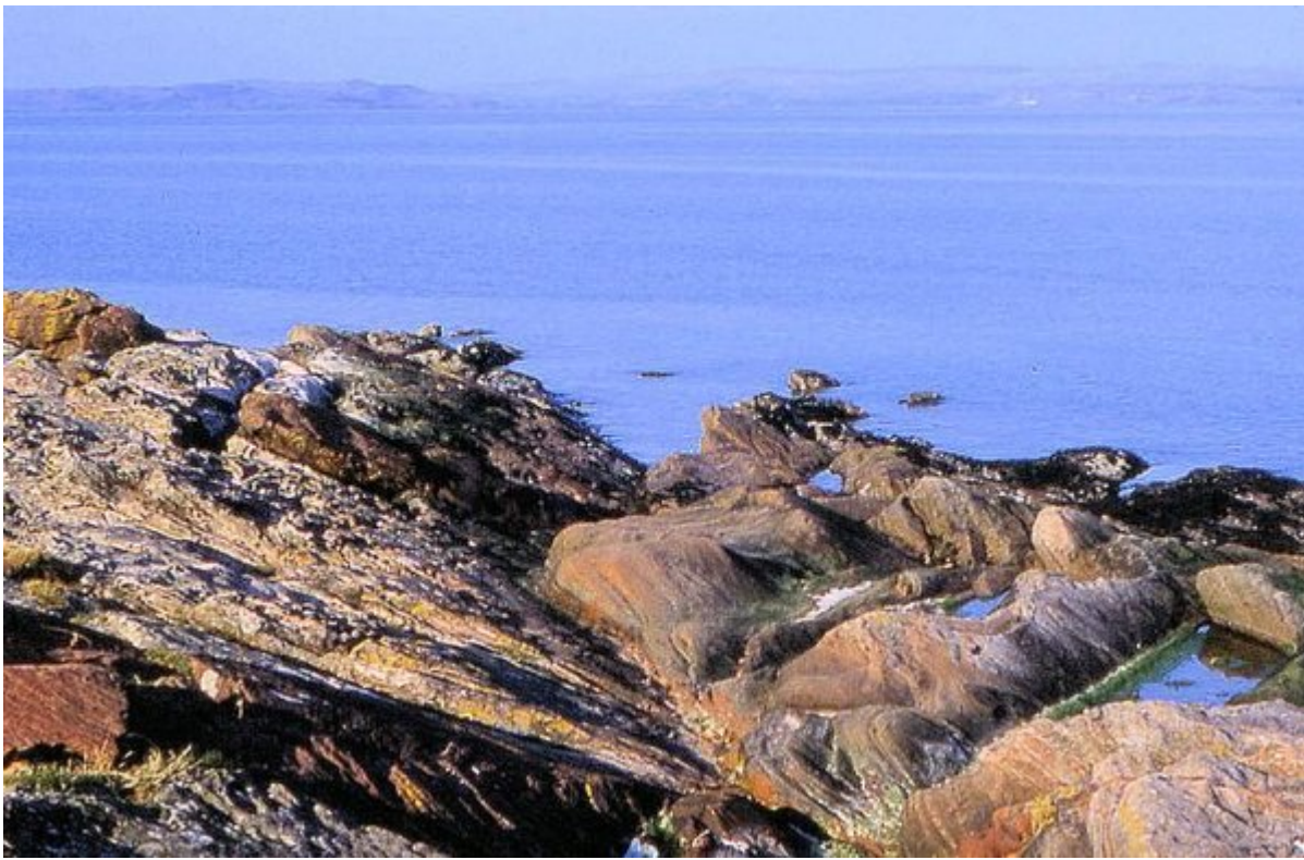
(Figure 9) The Carboniferous-Permian unconformity. The smooth weathering large cross-bedded units of the Permian Corrie Sandstone on the right contrast with the disturbed bedding of the Carboniferous strata on the left (see also (Figure 8)).