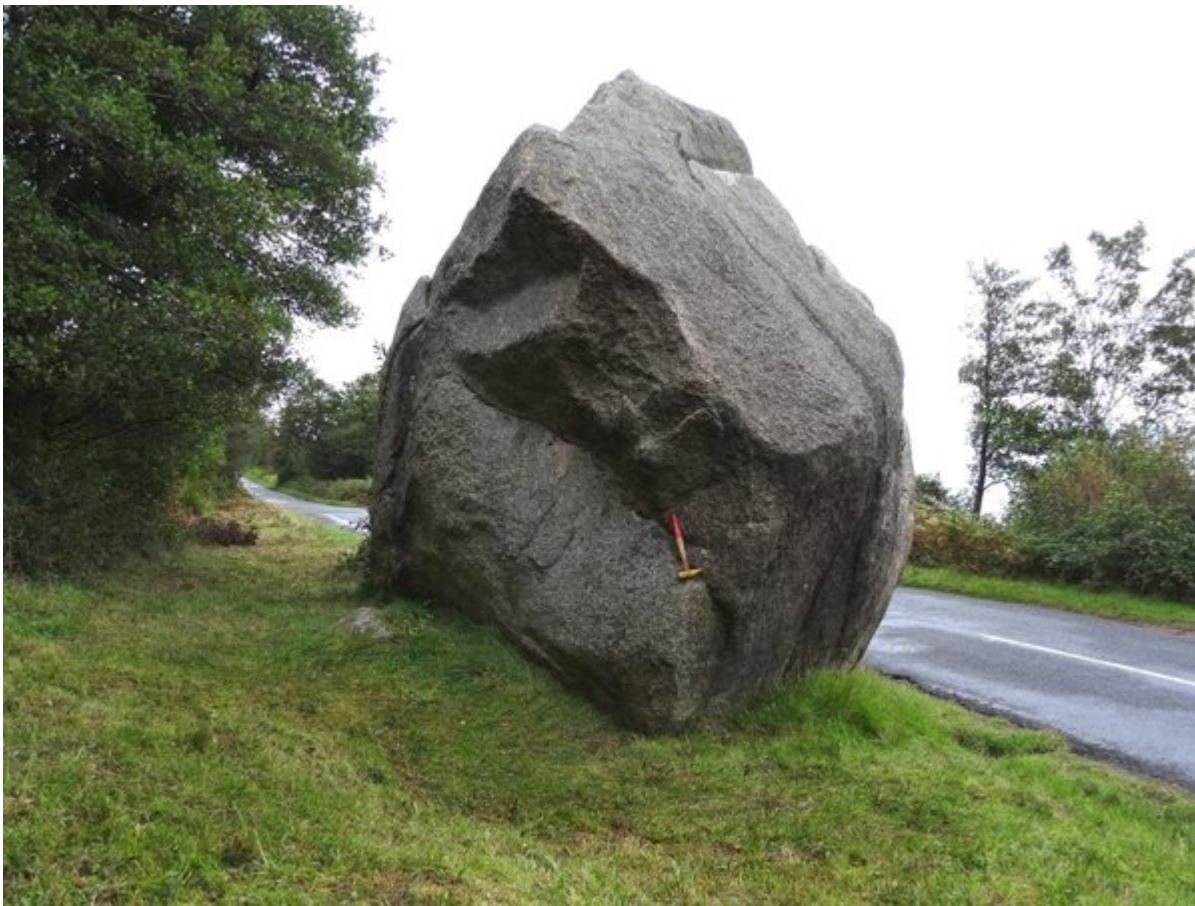
(Cover photograph) Clach a' Chait (Cat Stone) — The source of this glacial erratic is the Northern Granite intrusion that forms the mountainous area immediately to the west of Corrie. A number of these erratics, of various sizes, occur along the eastern shores and raised beaches of Arran.