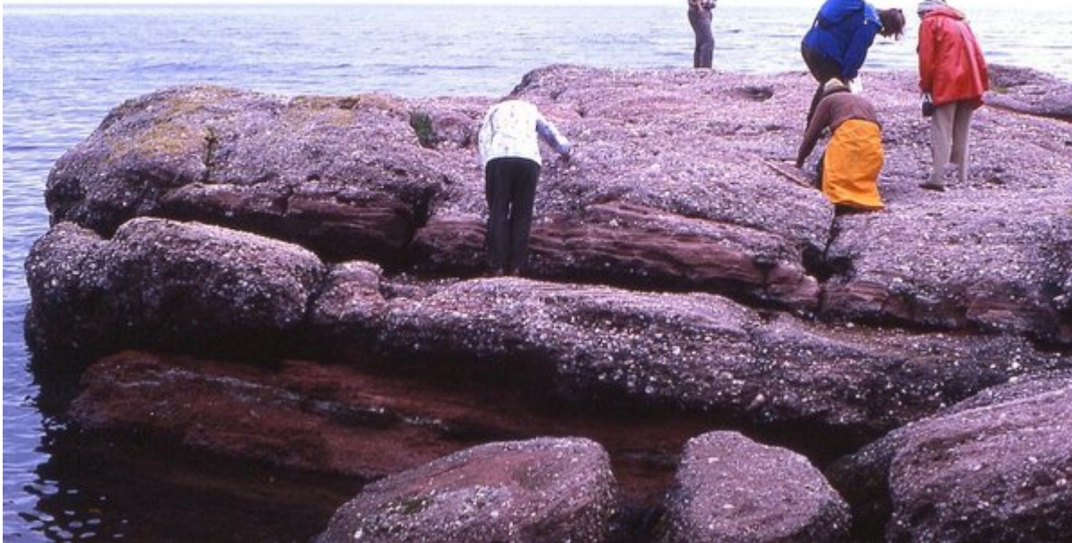
(Figure 3) The topmost beds of the Upper Old Red Sandstone (bed (a) in (Table 1)). Note the interbedded sandstone below the top conglomerate and the much finer grained beds at the base of the outcrop.