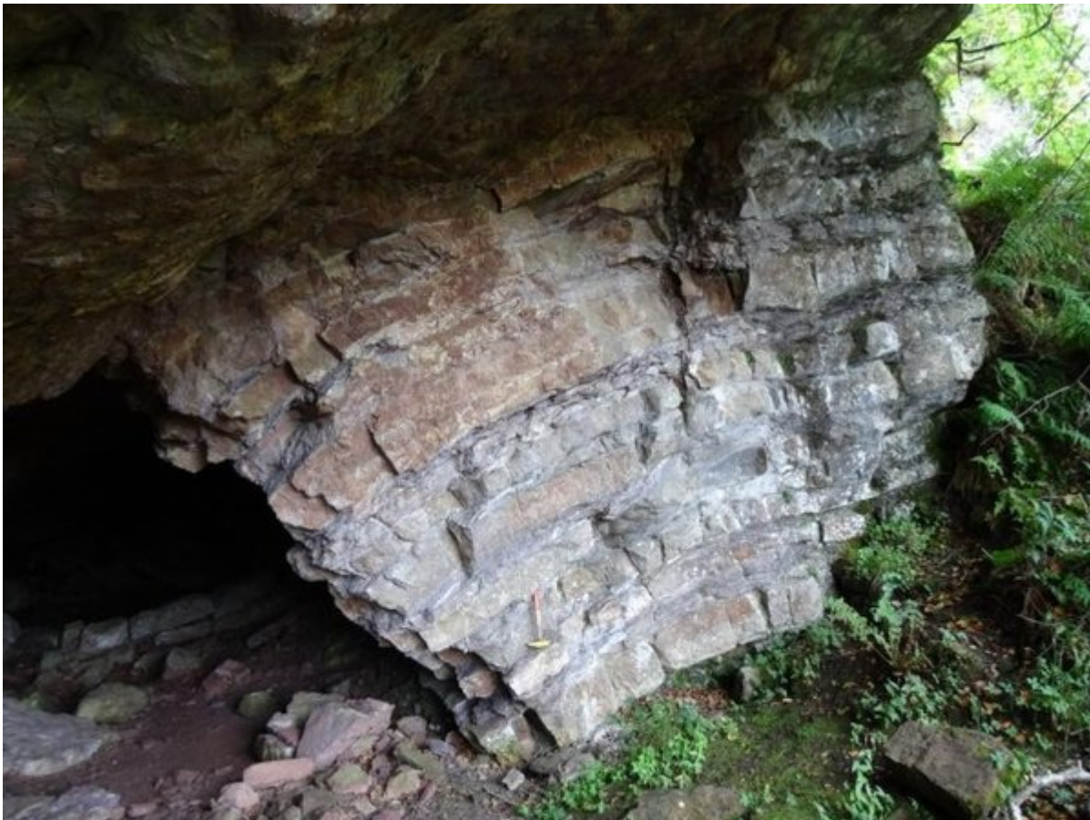
(Figure 6) Post of limestone supporting the roof of the limestone mine at Locality 8. The roof of the mine is studded with Gigantoproductus shells.