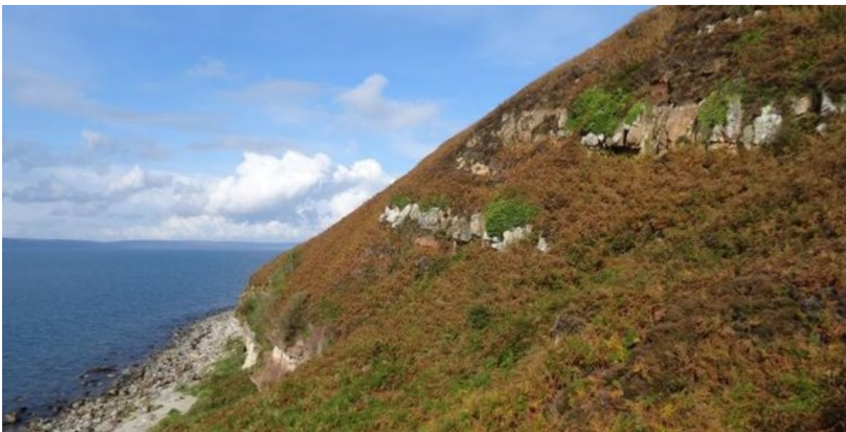
(Figure 3) View north from the path to King's Cave car park. Felsite and pitchstone sills are intruded into sandstone of the Permian Lamlash Beds a short distance south of King's Cave.