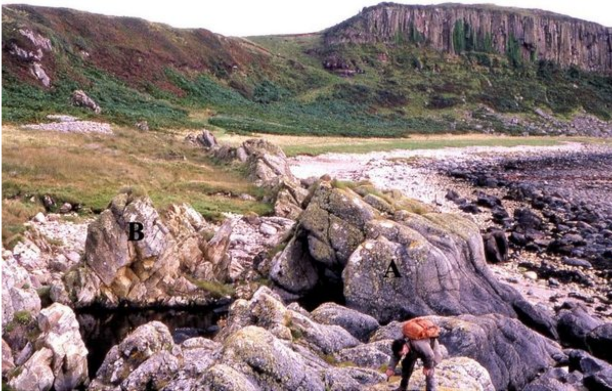
(Figure 4) View from Cleiteadh nan Sgarbh towards the Drumadoon Sill. A — felsite; B — quartz-feldspar porphyry

Geological Society of Glasgow Excursion Itineraries