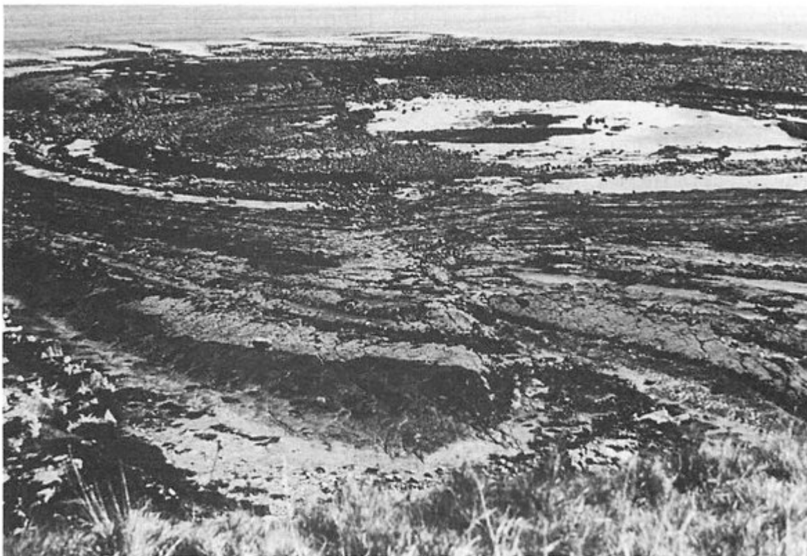
(Figure 3.2) Ladies Skerris dome (Locality 4) from the clifftop at Berwick (Locality 1).