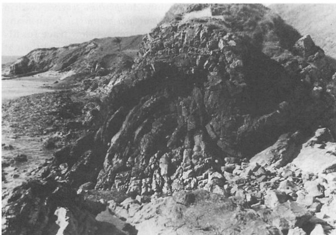
(Figure 3.4) West-facing overfold in the Eelwell Limestone, Saltpan Rocks (Locality 7).