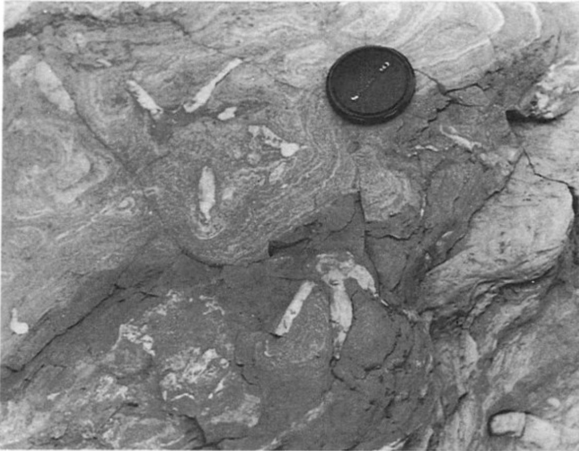
(Figure 17.2) Tridactyl dinosaur footprint, Saltwick Formation, Rail Hole Bight. The lens cap is 50 mm diameter.