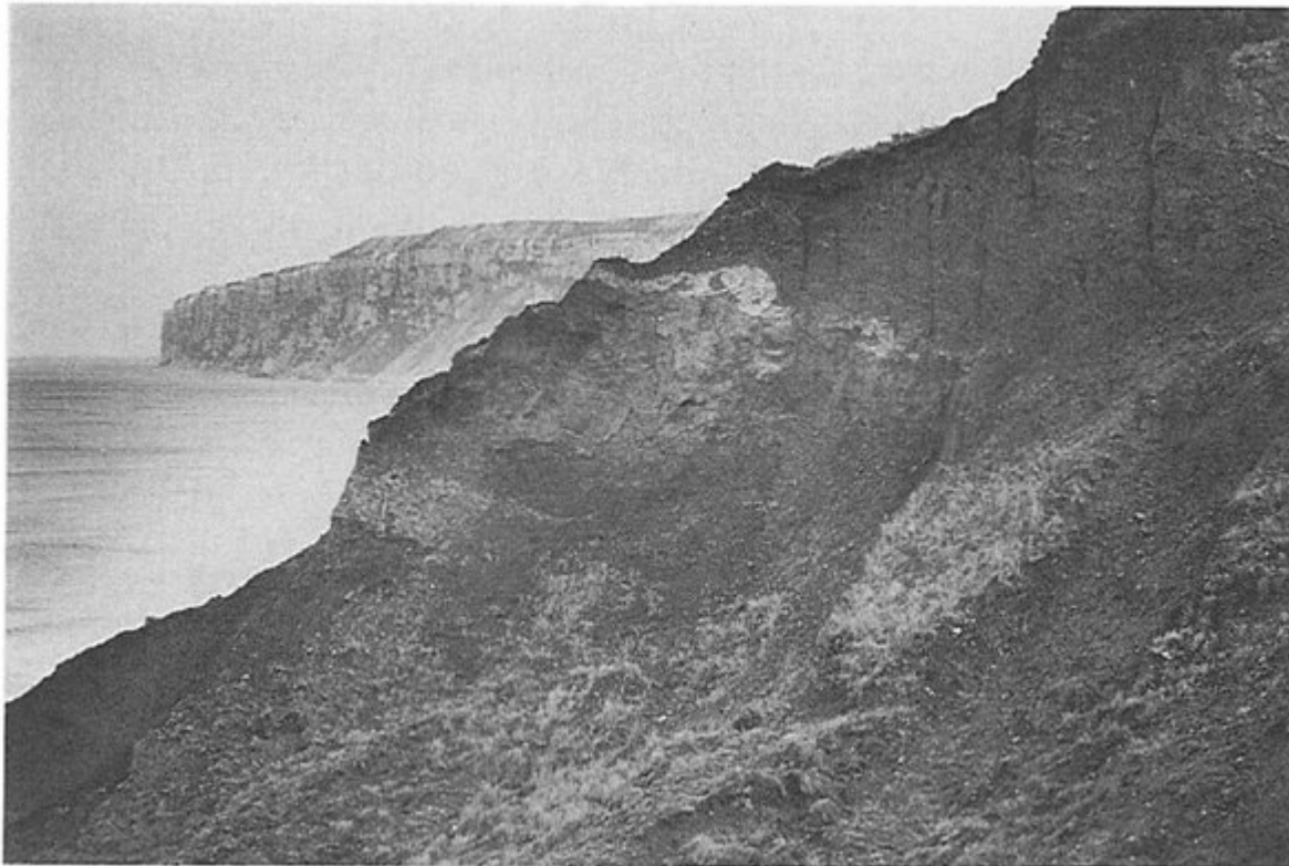
(Figure 20.1) Speeton Shell Bed, between Speeton Clay and Skipsea Till, New Closes Cliff. The spade rests against the basal chalk-flint gravel of the Shell Bed.