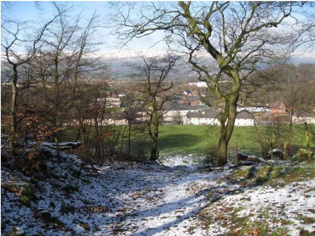
(Photo 16) Looking NNW from the escarpment formed by quarrying of the igneous intrusion over Twechar village to the snow-capped Kilsyth Hills in the distance.