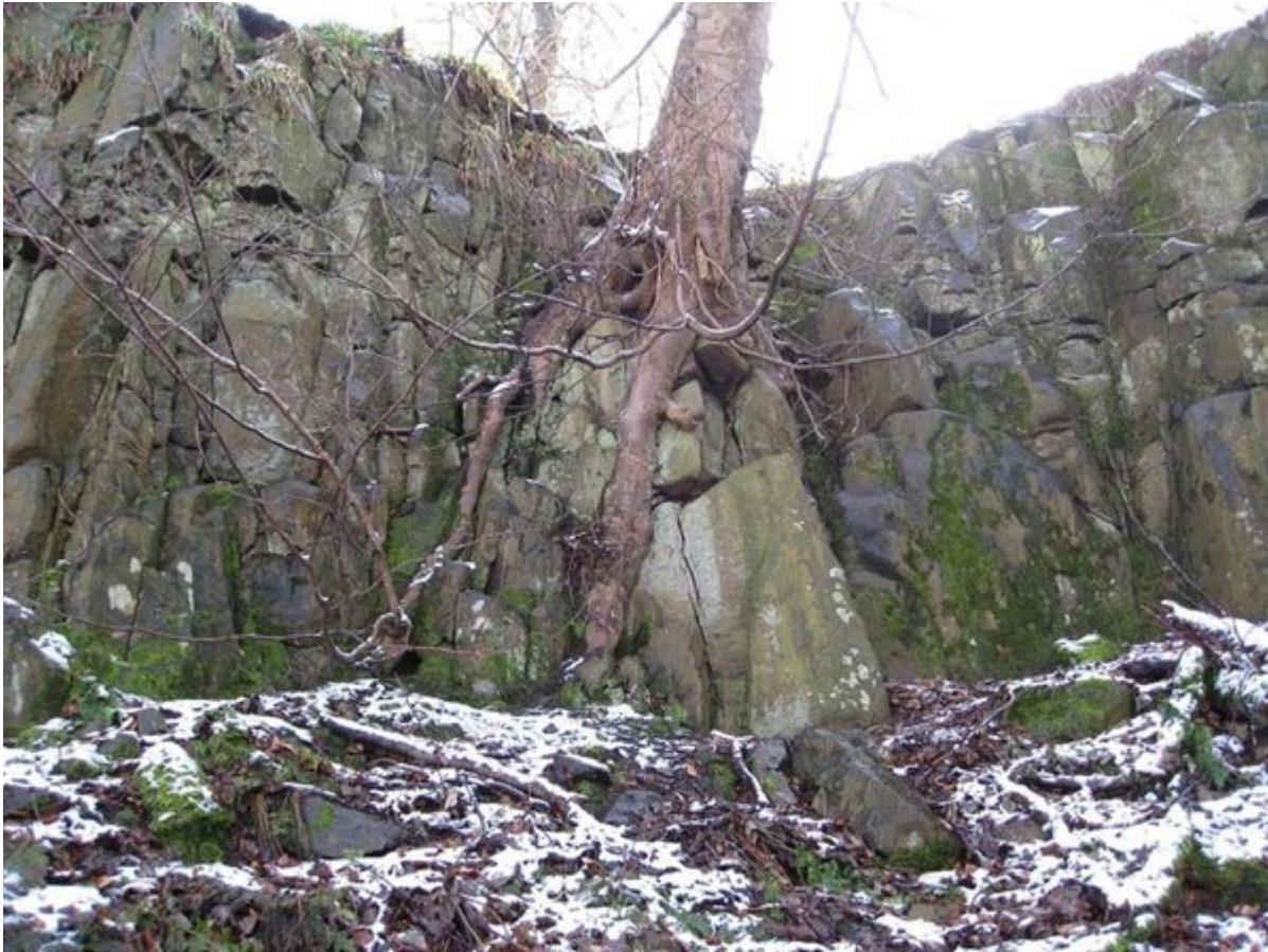
(Photo 15) Example of biological weathering where tree roots have exploited the joints in the quartz- microgabbro. As the roots grow and thicken, the blocks of rock are pushed apart and finally fall away from the face leaving the roots exposed. Looking S.