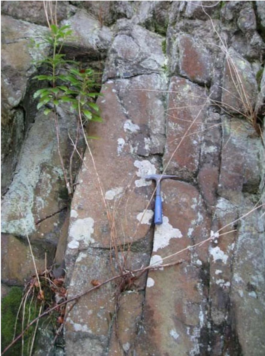
(Photo 14) Rusty-coloured weathering of the quartz-microgabbro, resulting from the oxidation of the iron-rich minerals. Looking SSE.