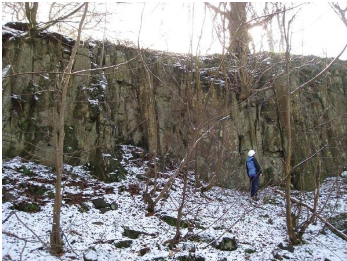
(Photo 12) Part of the quarry face exposing the quartz-microgabbro sill at Board Craigs. Looking SW.