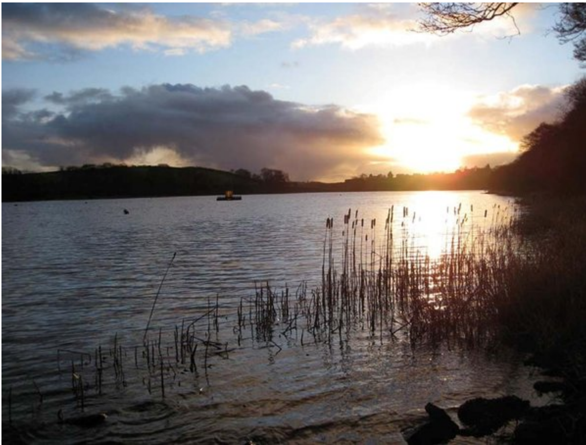
(Photo 29) Shallow water along the northern edge of the loch has formed a wetland habitat for a variety of flora and fauna. Looking WSW.