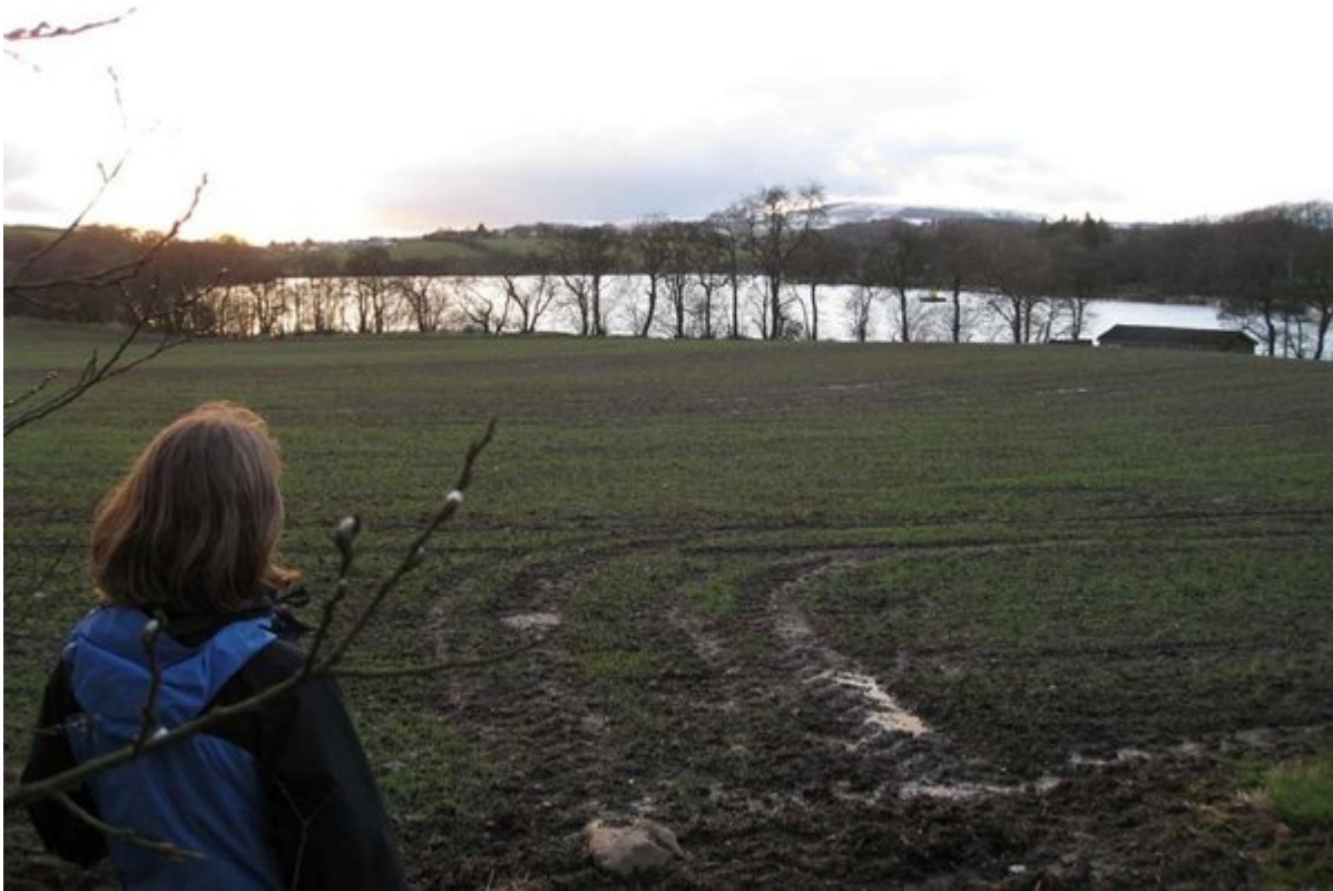
(Photo 27) View looking NNW across Bardowie Loch from the village located to the southeast. The loch is surrounded by large rounded drumlins which were sculpted as glacial ice advanced across the area from the west to the east.