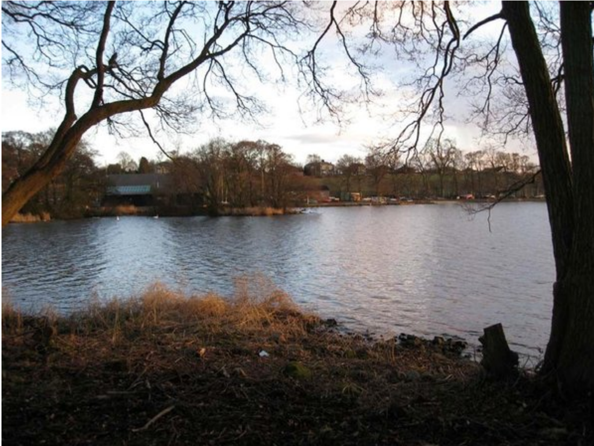
(Photo 28) Looking ESE from the north shore of Bardowie Loch towards the sailing club.