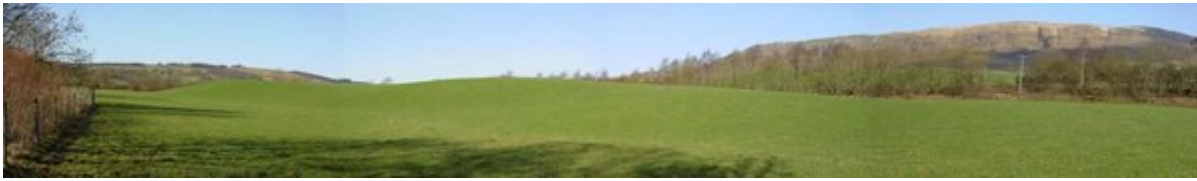
(Photo 81) Panorama of Gallow Hill illustrating the undulating form of the sand and gravel mound. The volcanic Kilsyth Hills are in the distance to the NW. The sand and gravel was deposited at the end of the last ice-age by meltwater streams issuing from glaciers retreating in a northwest direction towards the main Highland ice-sheet. The name Gallow Hill comes from a site to place gallows, and it is recorded that as late as 1639 Lord Kilsyth hanged one of his servants here.