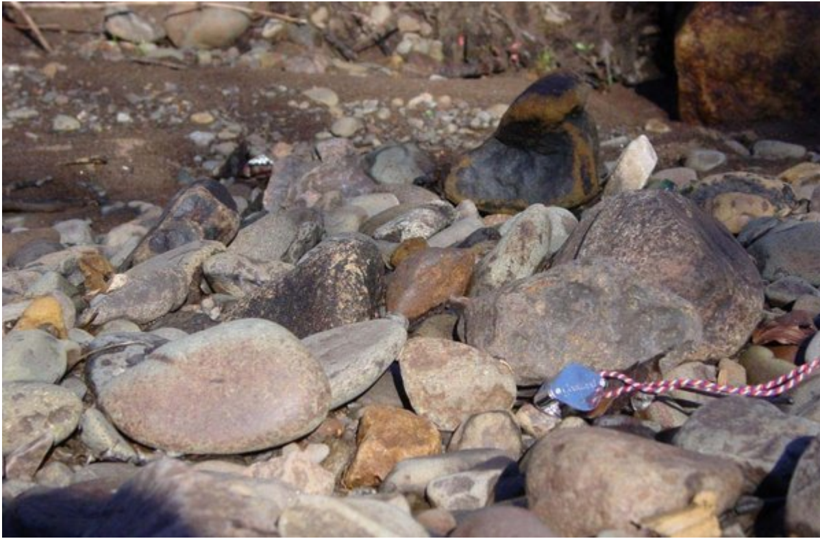
(Photo 83) Cobbles transported downstream lodged against a larger boulder on the point bar are stacked up in the direction of river flow in a process known as imbrication. This example of a modern- day sedimentary process, can help geologists to determine the 'palaeo' flow direction in ancient sedimentary rock deposits. Looking NW.