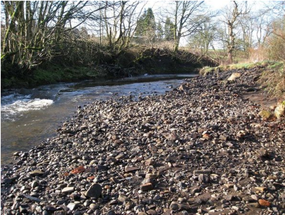
(Photo 82) Gravel point-bar forming on the inside of a meander in the Galzert Water. A river-cliff can be seen forming on the opposite side where water the bank has been undercut. Looking SW.