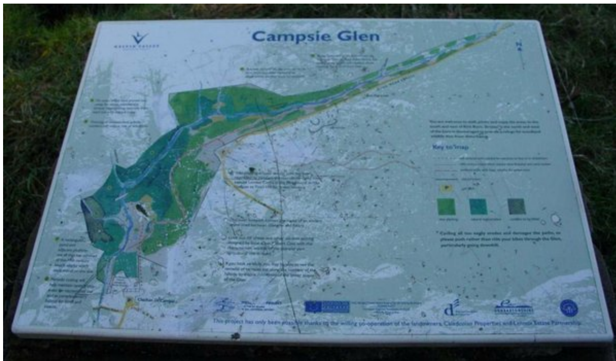
(Photo 100) Close-up of the map / information board located at the bottom of Campsie Glen. The glen is regarded as a classical geological locality; it is one of only 2 sites in East Dunbartonshire published in the Glasgow Geological Society Excursion Guide for the area, and was undoubtedly visited by geologists in the early 1900's. The board highlights the natural and cultural history of the area, but unfortunately there is no geological information about how the rocks have influenced the shape of the landscape, the different geological features visible in the Glen, or how the existence of certain rock types were fundamental for local industries. The formation of the Glen is related to the retreat of glaciers back towards the Highlands, when vast amounts of meltwater caused massive erosion and the formation of gorges such as that seen today at Campsie Glen.