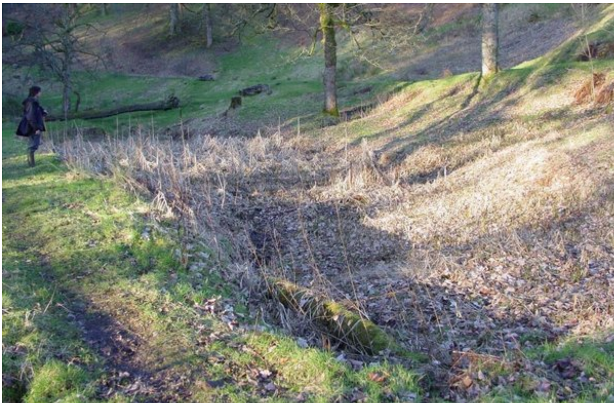
(Photo 101) View looking NE across the remains of a rectangular 'bleach pool', associated with the former textile industry which developed as a result of the alum works near Lennoxton. The industry existed in this area due to the presence of alum shale as part of the local geology.