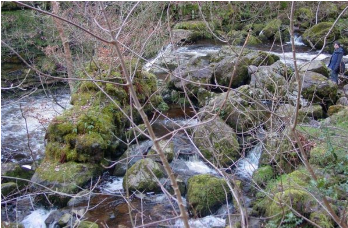
(Photo 103) A prominent waterfall in the burn is caused by the presence of doleritic dyke which forms a resistant barrier compared to the more easily eroded sedimentary rocks downstream belonging to the Ballagan Formation. At low water the structure of the dyke reveals a complex story of multiple intrusions. Looking W.