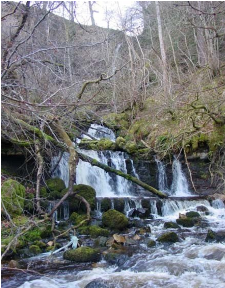
(Photo 105) Looking through the trees, towards the skyline, a larger waterfall can be made out. This has formed where the Aldessan Burn flows over the lowermost lava flows of the Clyde Plateau Volcanic Formation. Looking NW.