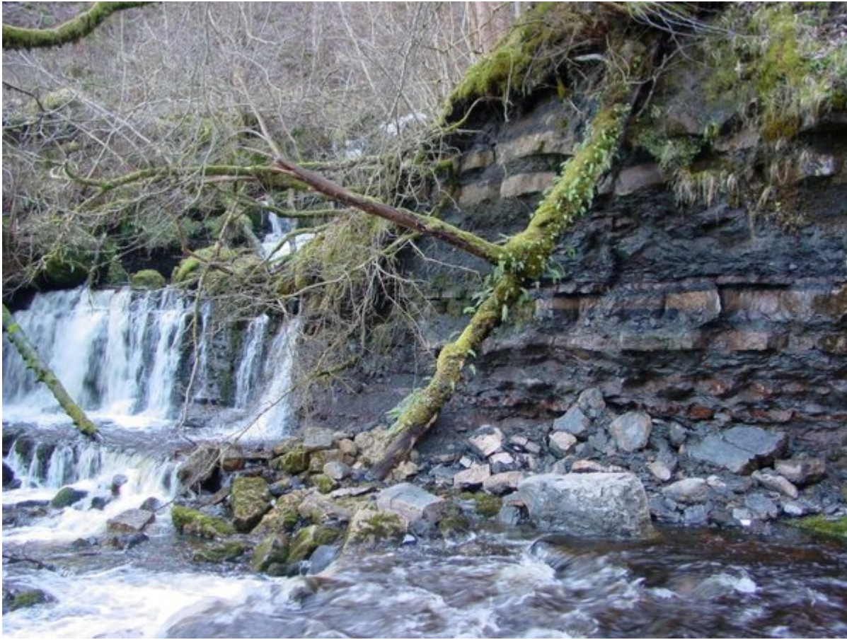
(Photo 104) At the confluence with the Aldessan Burn the upper part of the Ballagan Formation can be examined; the pale-coloured cemenstones can clearly be seen alternating with the darker mudstone layers. Approximately 20m higher up the sequence these sedimentary rocks are overlain by lava flows belonging to the Clyde Plateau Volcanic Formation. Looking WNW.