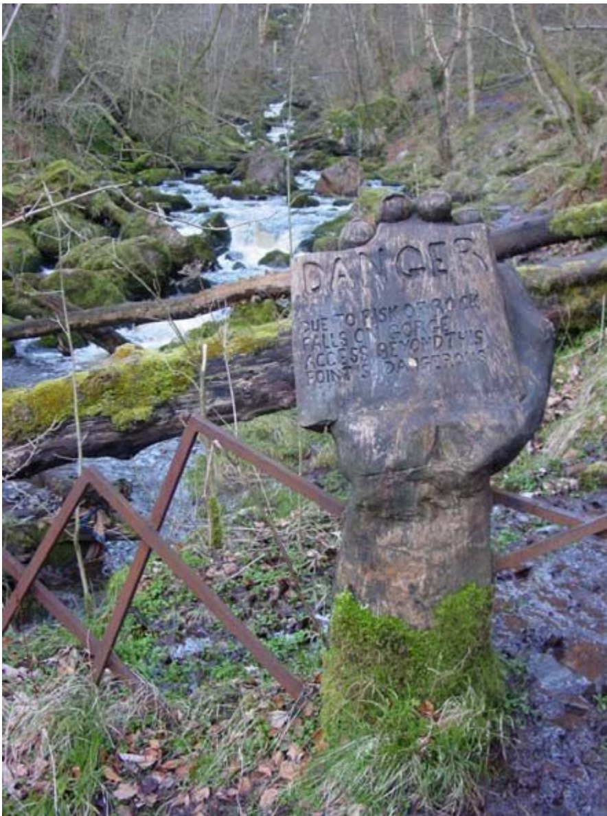
(Photo 106) A sign warning walkers that the upper part of the Campsie Glen is susceptible to rockfalls. Continuing weathering and erosion of the steep unstable slopes makes the glen a risk to those who venture beyond this point. Looking NE.