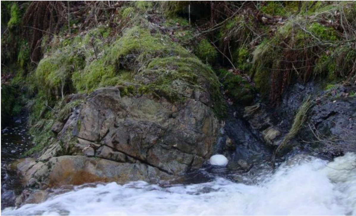
(Photo 102) The lower part of the Campsie Glen is underlain by the Ballagan beds, composed of dark coloured mudstones alternating with beds of cementstone (muddy dolomitic limestone). Here the beds are cut by a pale-coloured, carbonated igneous dyke, the line of which is displaced by a fault, tilting the Ballagan beds to a steep angle. Ten metres upstream, away from the fault, the Ballagan beds can be seen in both river banks at a low angle. Looking W.