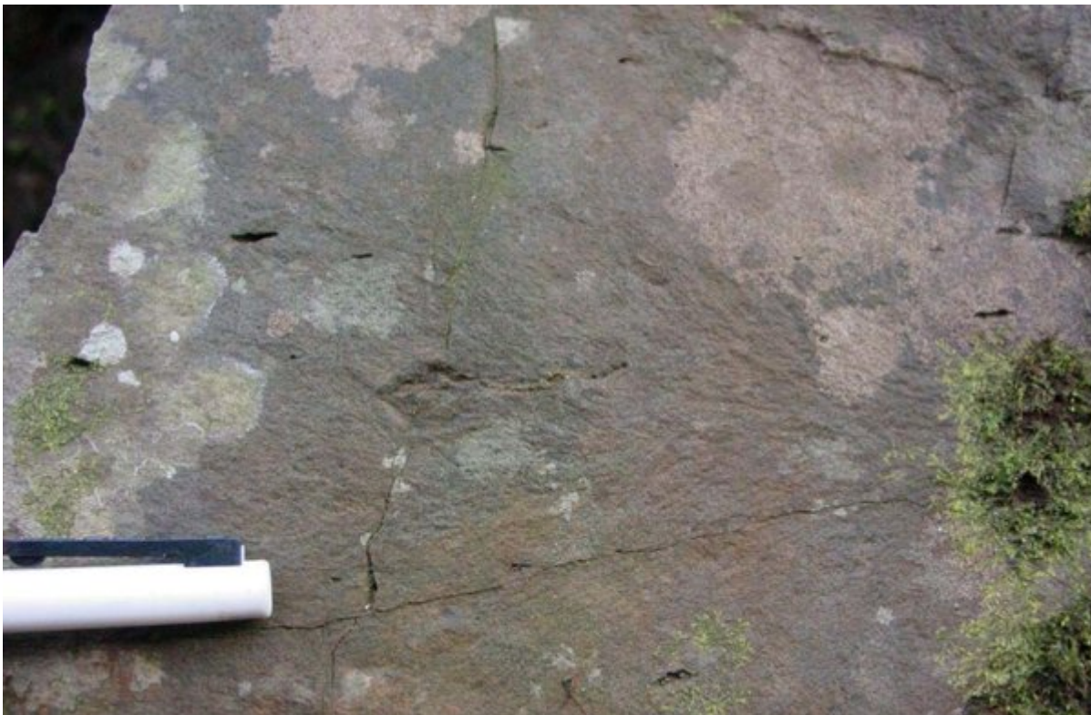
(Photo 108) Close-up of a series of elongate hollow 'vesicles' within a basaltic lava flow of the Clyde Plateau Volcanic Formation. When magma is erupted the molten rock often contains gas bubbles which, on contact with the cold air,