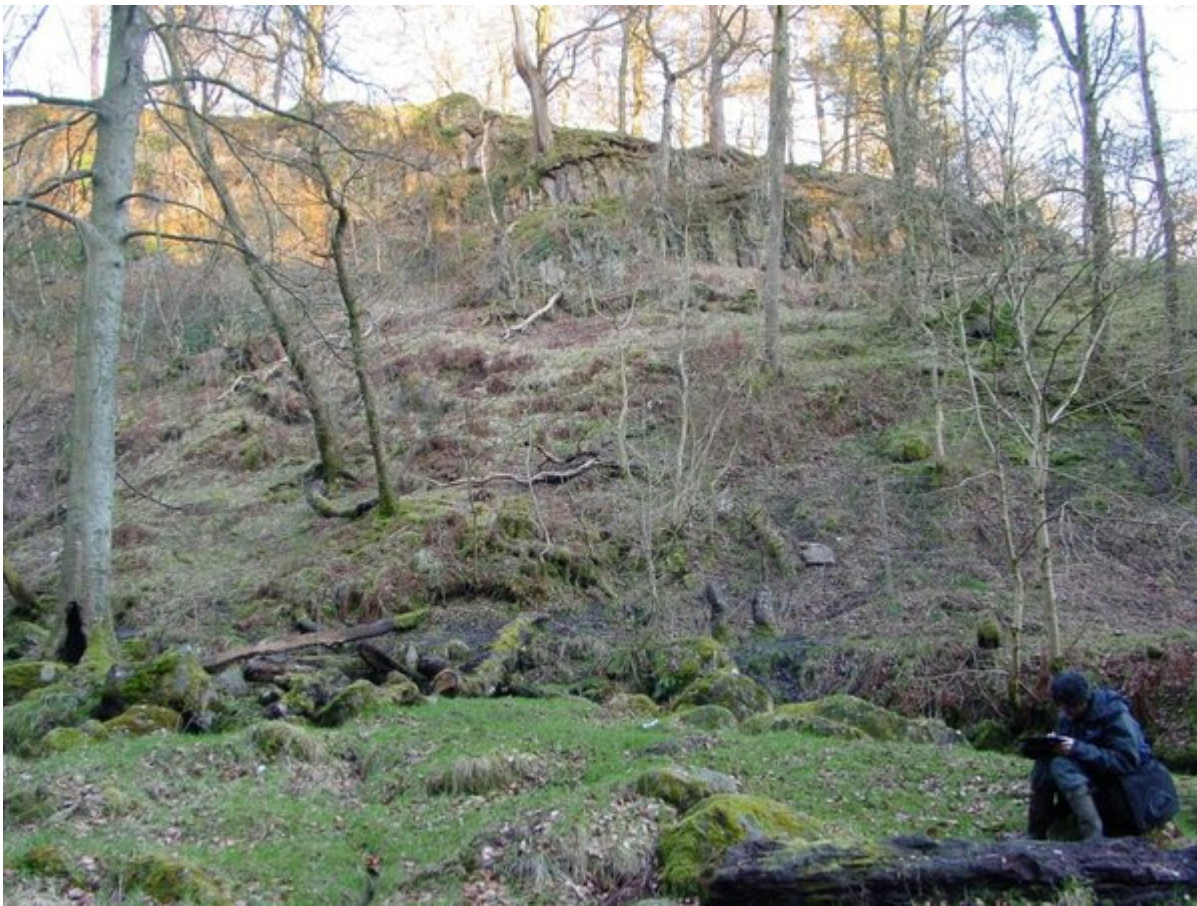
(Photo 107) View looking E from the confluence of the Aldessan Burn. The lower two-thirds of the valley side is composed of sedimentary rocks belonging to the Ballagan Formation. The craggy upper part of the slope displays the lowermost 3 or 4 lava flows of the Clyde Plateau Volcanic Formation. The flows, each several metres thick, form a series of rocky ribs along the valley sides. The flows are often separated by a grassy ledge where softer material has been eroded away.