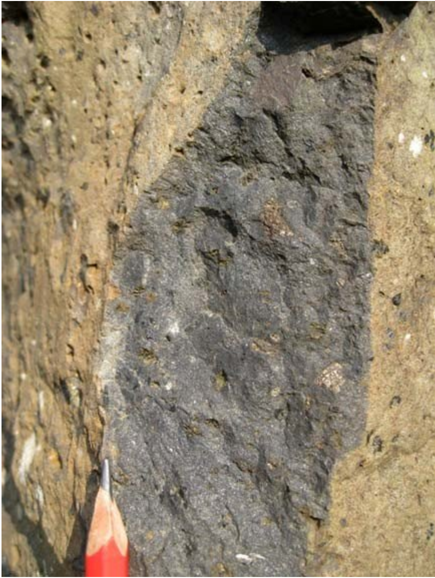
(Photo 162) Close-up the porphyritic basalt making up the volcanic plug. The very dark grey surface is freshly exposed and shows the true nature of the rock. The lighter brown surfaces are characteristic of a weathered basic igneous rock, as the iron- and magnesium-rich minerals in the rock oxidise.