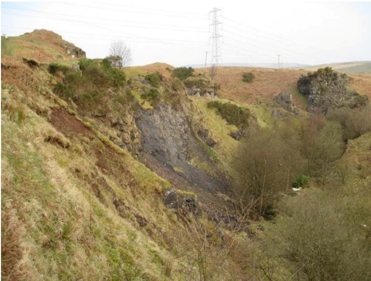
(Photo 159) View looking NNW across the main quarry face which exposes the agglomerate within the volcanic vent. In the distance, to the right of the picture, a basaltic plug displays well-developed columnar jointing.