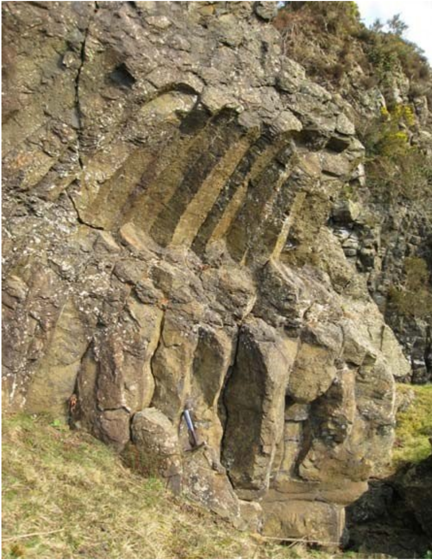
(Photo 161) Well developed, curved columnar jointing in the porphyritic basalt forming the volcanic plug. The fractures form as the hot magma internally contracts on cooling. The joints generally develop perpendicular to the top of the magma body. Looking NNE.