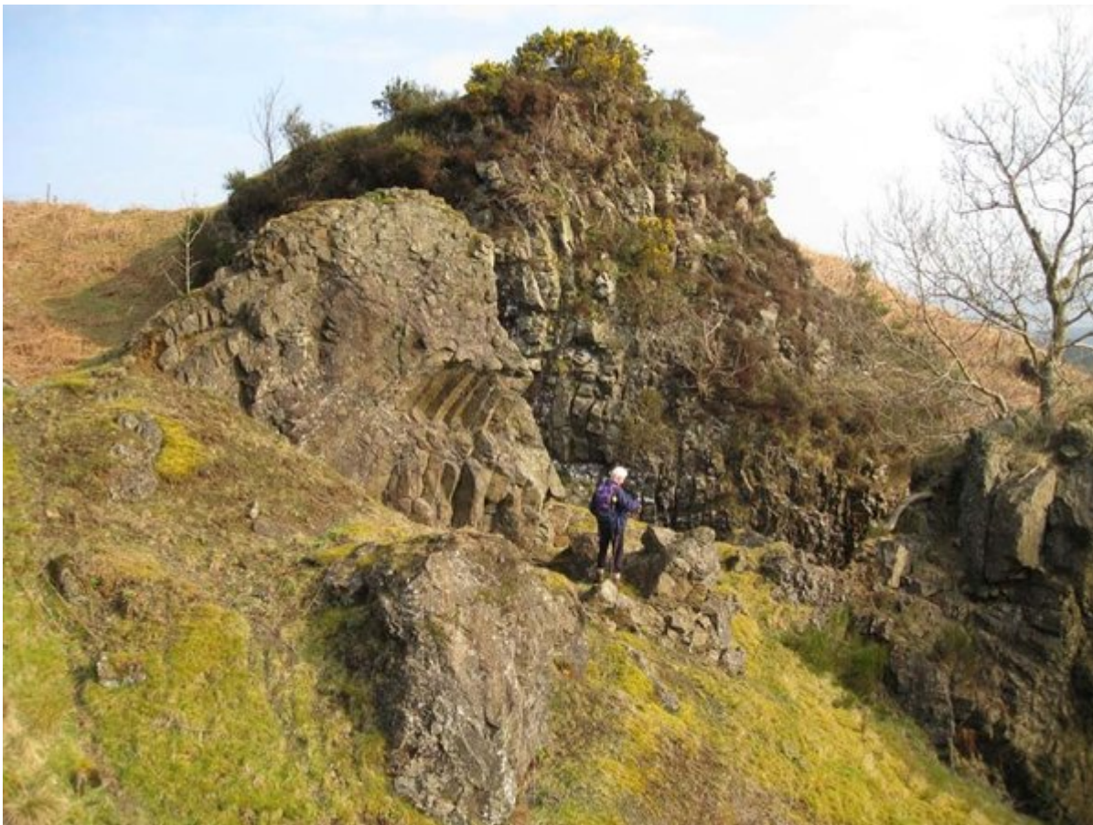
(Photo 160) Outcrops of porphyritic basalt which are thought to represent a volcanic plug adjacent to the main vent. Looking NNE.