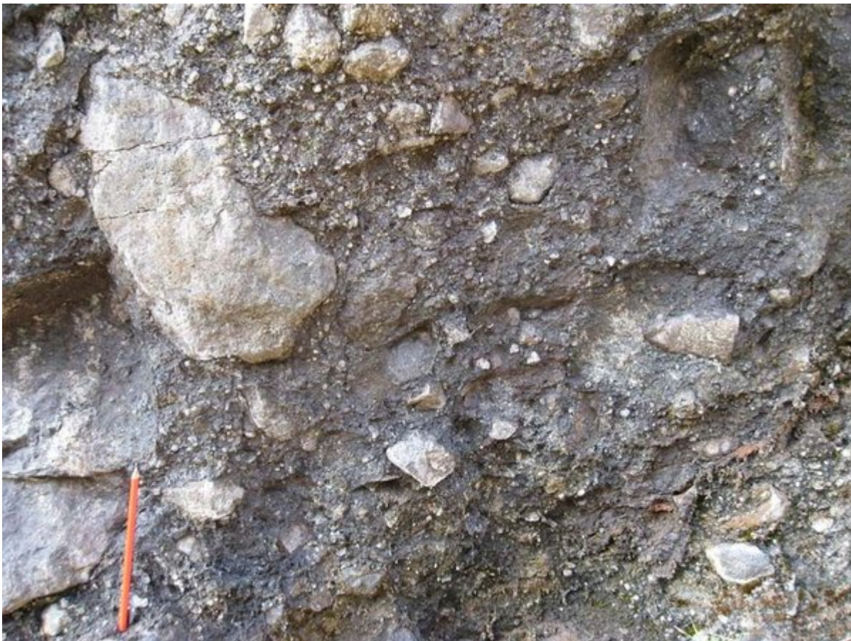
(Photo 164) Close-up of the poorly sorted vent agglomerate, containing boulders up to 2 m in size.