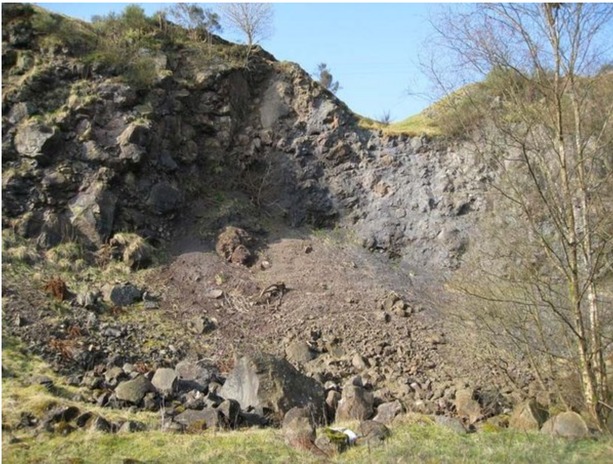
(Photo 163) View of the main quarry face, displaying the agglomerate which infills the volcanic vent. The vent material is not well cemented and is constantly falling. Care should be taken close to the face.