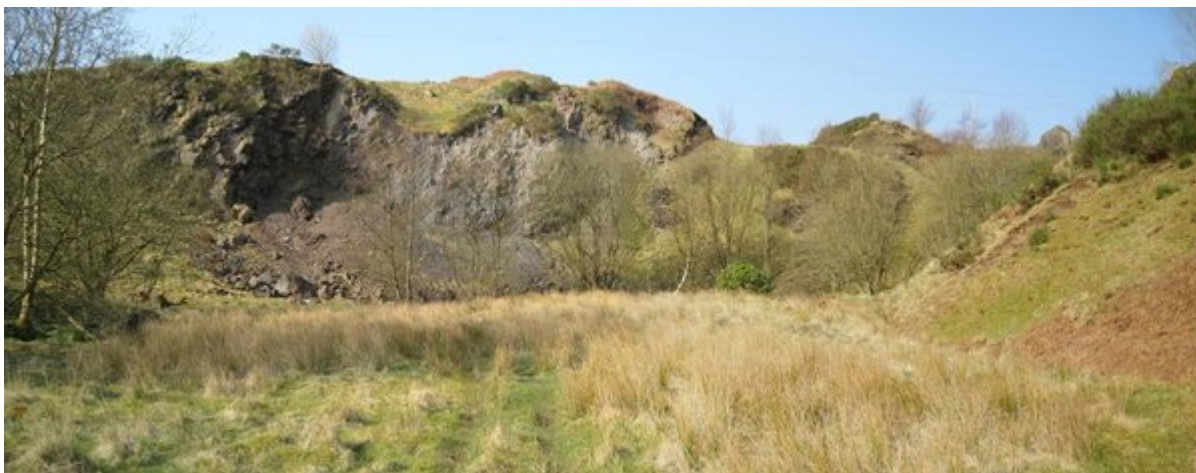
(Photo 157) View looking WSW towards the main quarry face which displays a complete section through the neck of a volcanic vent. The vent, of Lower Carboniferous age, may have been a source of the local Clyde Plateau Volcanic Formation lavas and cuts through fine ash and basaltic rocks of a similar age. This site is of particular importance as it