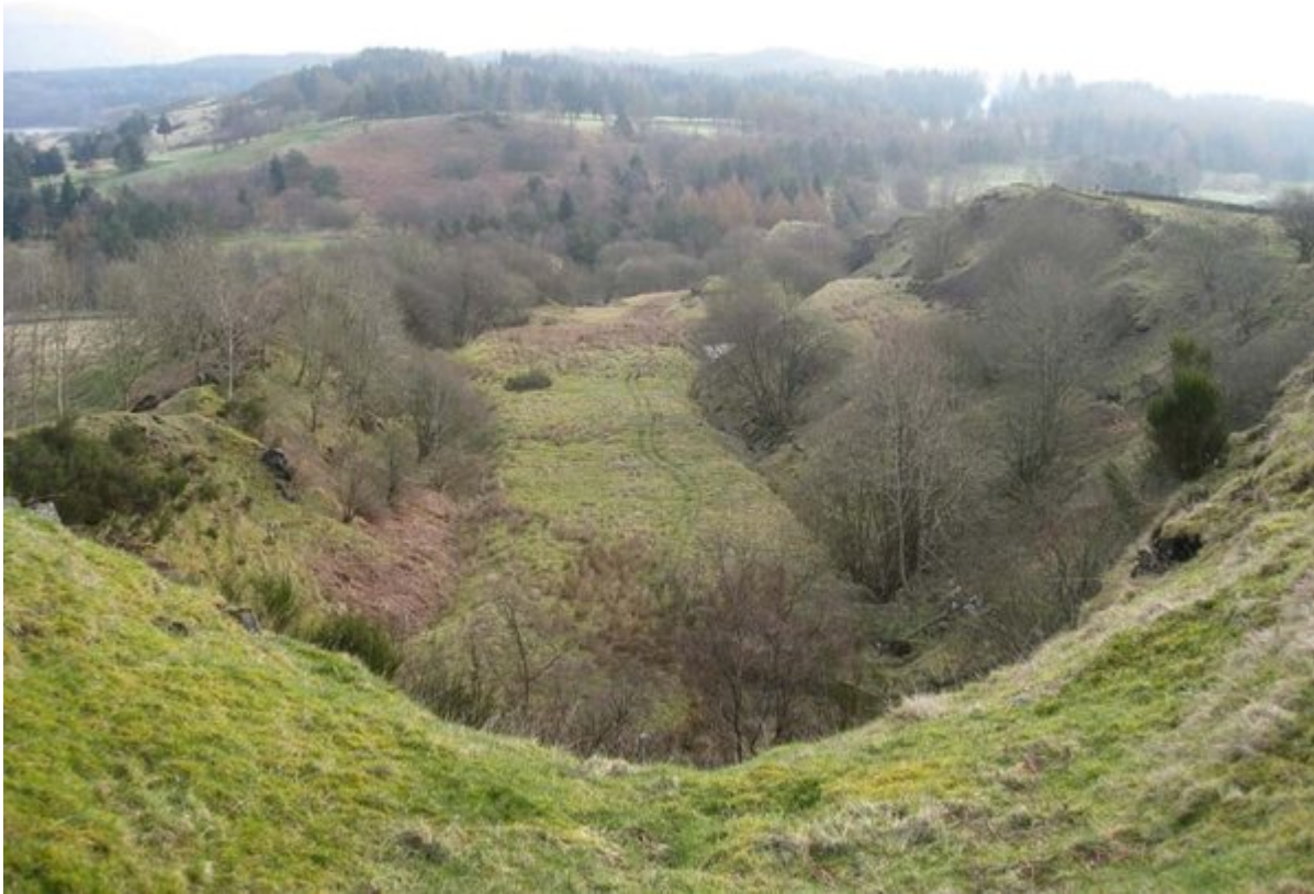
(Photo 158) View looking ENE from the top of the main quarry face showing the safe and accessible nature of the site. From here views can be seen across Strath Blane to the hills beyond, and of the 'trap' topography in the Clyde plateau Volcanic Formation lavas behind the site, on the lower slopes of the Kilpatrick Hills.

not only displays the material found both within and outside the vent, but also illustrates the geometry of the vent. The educational value of the site would be greatly enhanced by the removal of the trees at the base of the section which obscure the best views (such as the one above) of the funnel-shaped neck of the vent. Otherwise the site is accessible and remarkably well exposed.