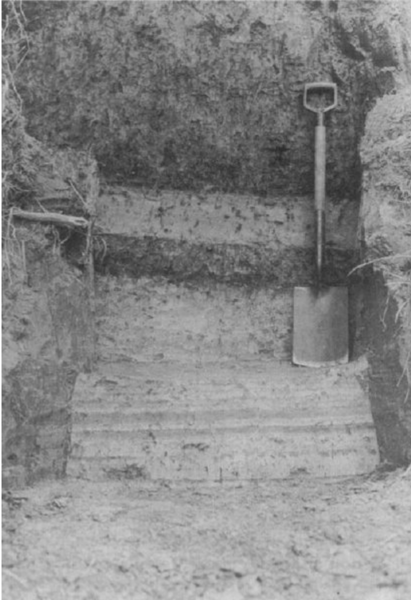
(Figure 14.5) Section at Maryton. Laminated Late Devensian marine clays are overlain by peat then a layer of grey, micaceous, silty, fine sand interpreted as a tsunami deposit. Above the latter is silty peat then coarse clay.