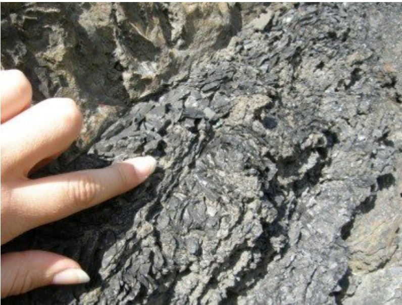
(Spireslack_2 P4) Internal fractures display heavily polished surfaces, evidence of the rocks on either side moving past each other (see right image).