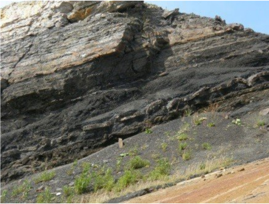
(Spireslack_2 P3) Development of small thrust faults within the Limestone Coal Formation, highlighted by ironstone layers. The stronger ironstone layer is buckled and faulted &mdash the same structures are not observed in the mudstone as it is a weaker unit, and deforms along multiple internal fractures.