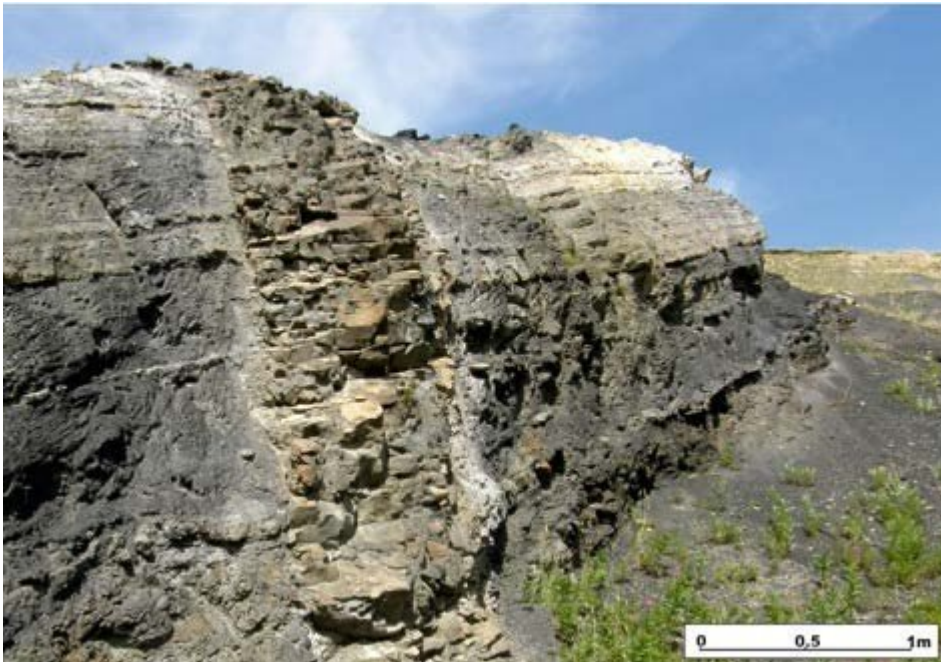
(Spireslack_2 P1) Palaeogene dyke intruding mudstones and siltstones of the Limestone Coal Formation.