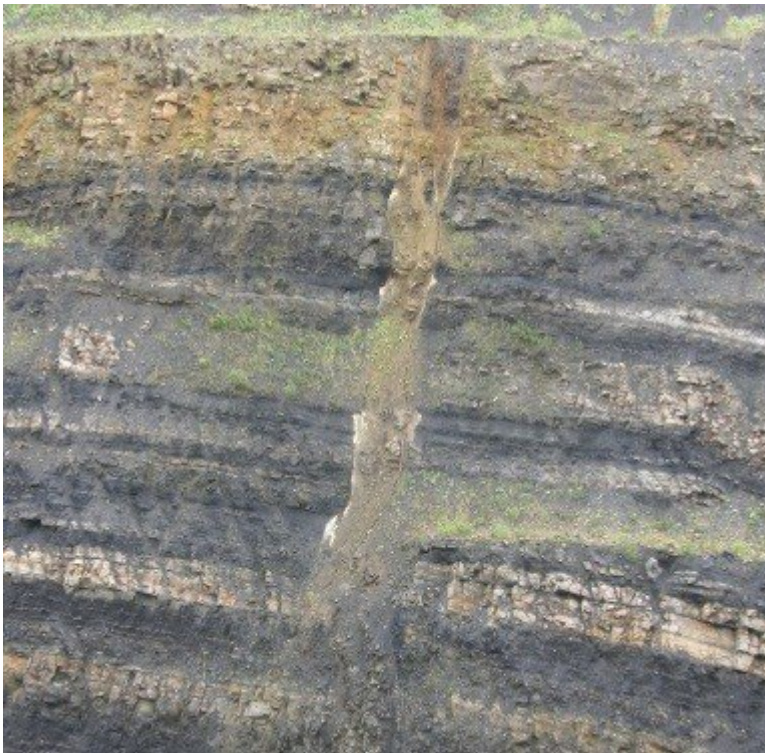
(Spireslack_2 P2) The same dyke exposed in the main scarp, cutting the Limestone Coal Formation. Note, where the dyke is in contact with coal it is altered to white trap: the result of volatiles released during intrusion of magma into carbonaceous rocks (e.g. coals, mudstones).