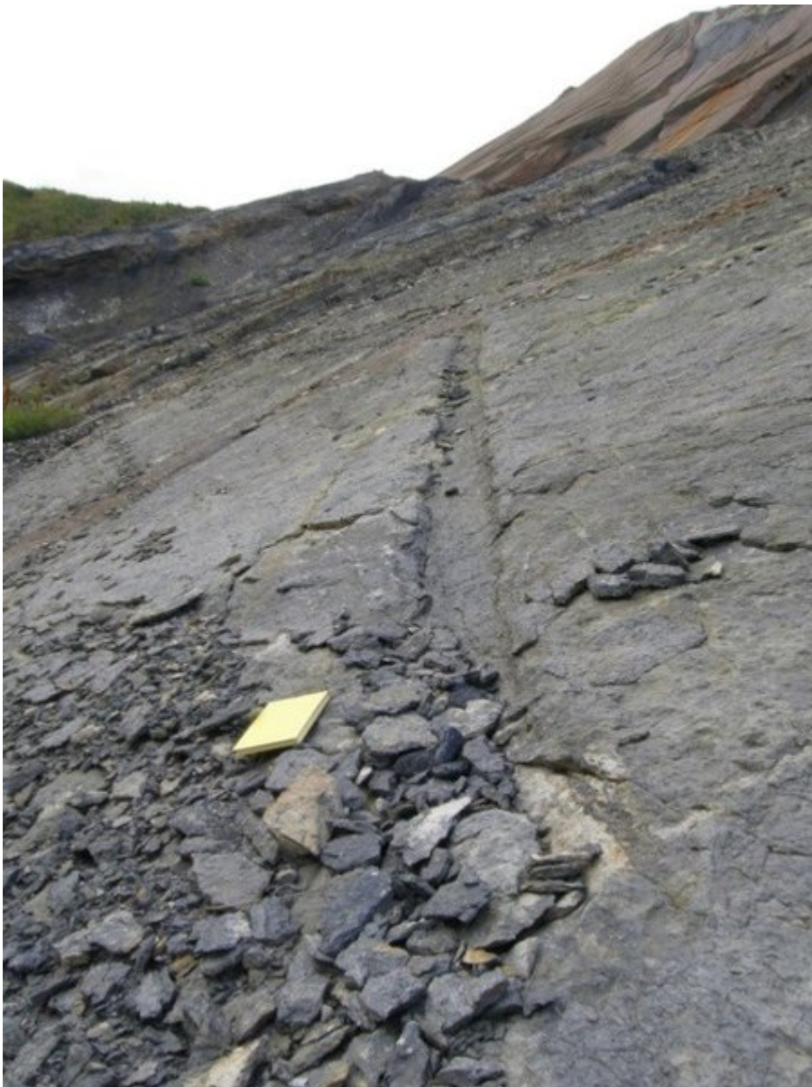
(Spireslack_8 P2) Lepidodendron sp. tree cast within McDonald seatearth. Note erosive nature of seatearth in lower left — this is comprised mostly of stigmara root fossils.