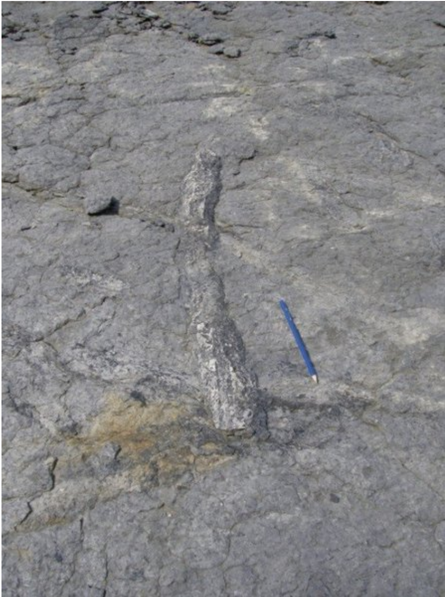
(Spireslack_8 P1) Fossilised roots ( stigmata ) of Lepidodendron sp., a tree-sized fern, are abundant within the McDonald seatearth.