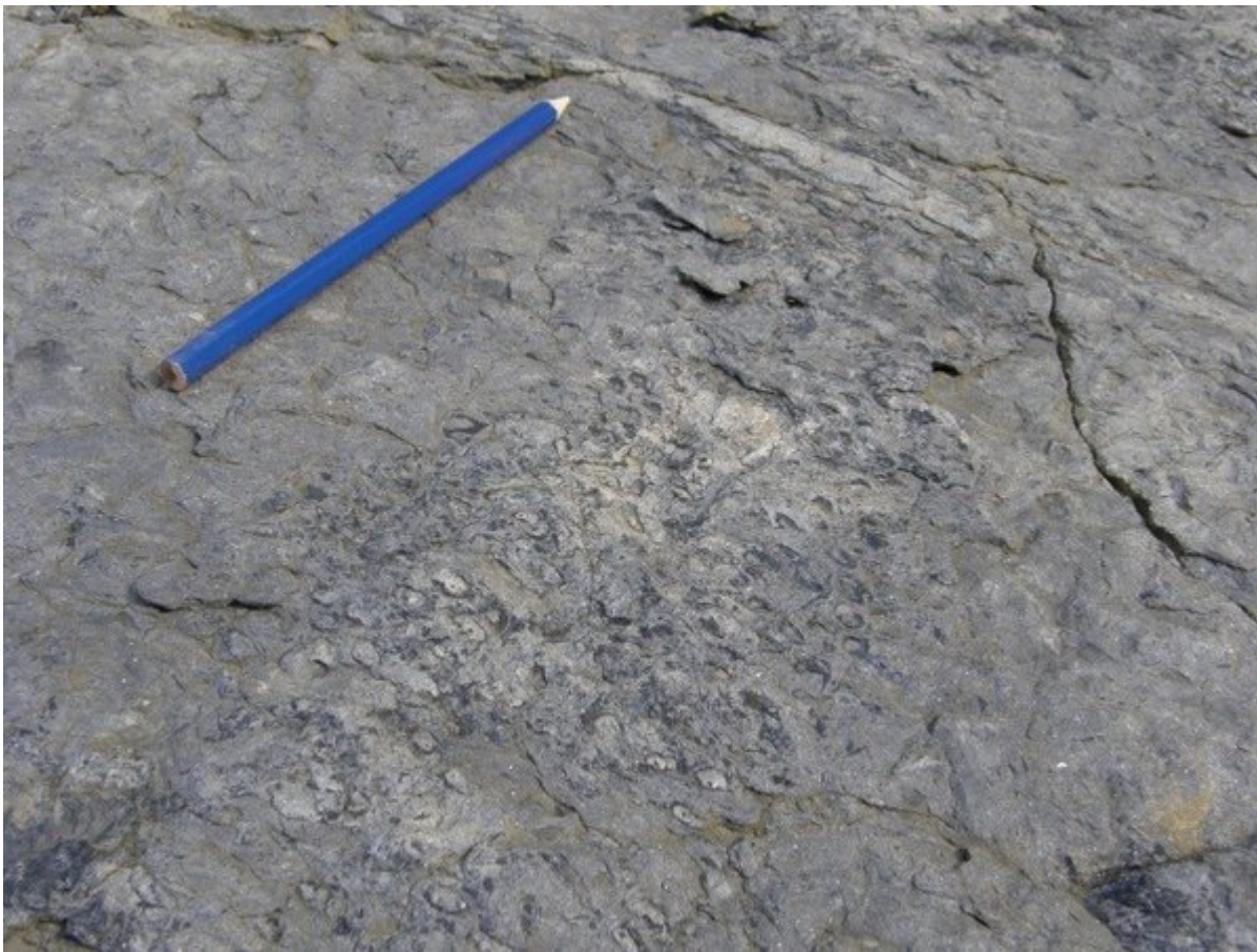
(Spireslack_8 P3) Detail of stigmaria root within McDonald seatearth. The circular scars on the root surface are the preserved remains of smaller rootlets (stigmata) which were once attached and arranged radially around the stigmaria.