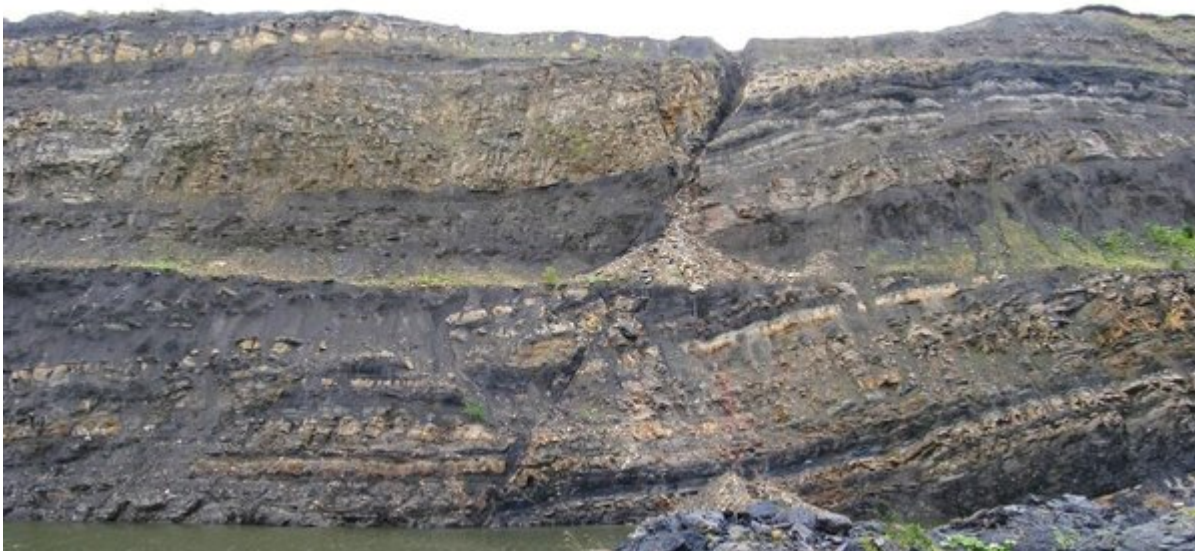
(Spireslack_10 P1) Fault in the south wall, displacing rocks in an apparent normal sense down to the east (left of the image), but also to the north in an oblique sinistral fashion. The weaker fault rocks have been eroded along the fault plane, leaving a cleft marking the position of the fault. Sandstone tends to fracture when faulted — the fractured sandstone has washed out of the fault plane to form a localised debris cone half way up the scarp. Photo facing south.