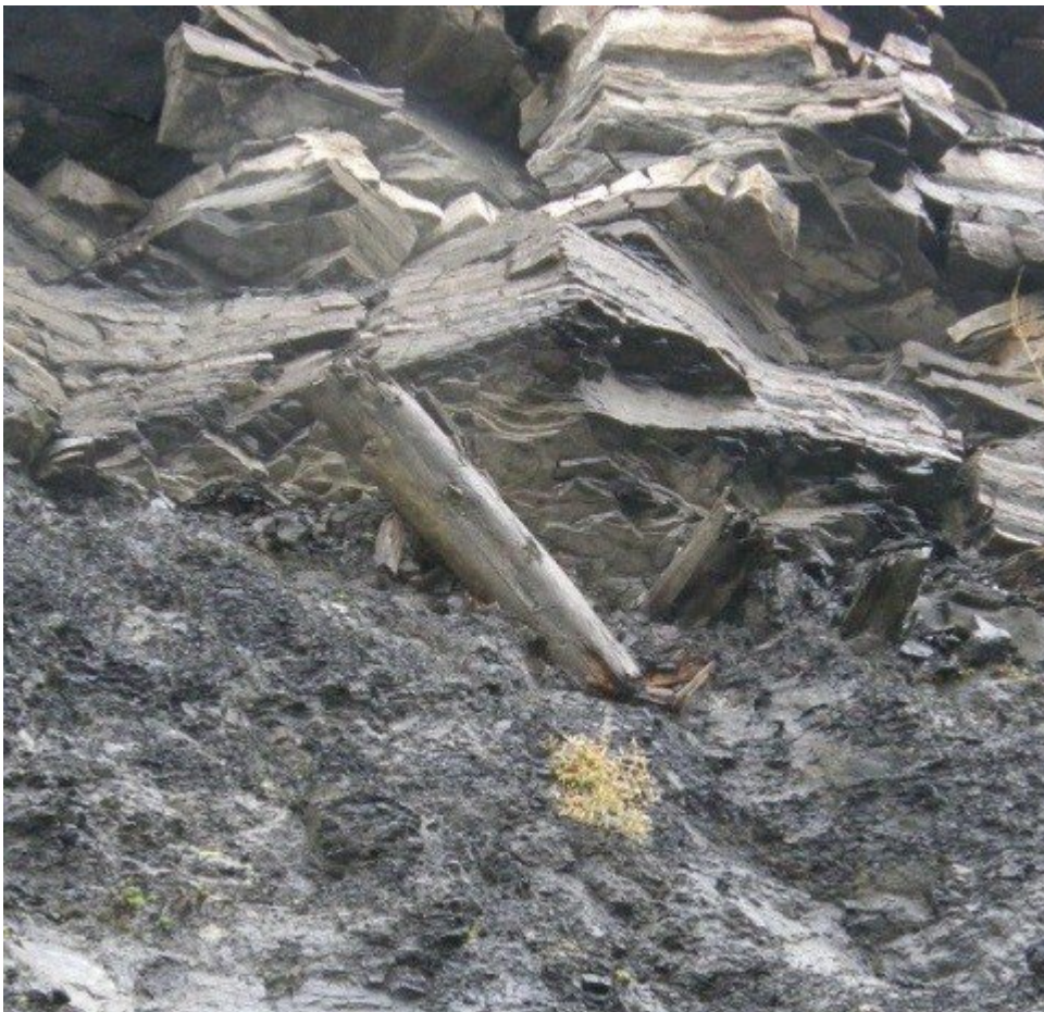
(Spireslack_11 P2) Wooden pit prop in situ within the coal workings. The wooden props were used to hold up the roof of the workings as the coal was extracted. The prop, sitting above packed mine waste in the photo, has since collapsed due to the overlying weight of rock (sandstone) above.