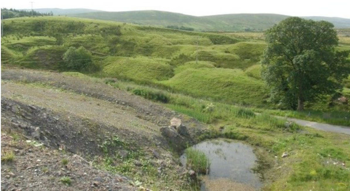
(Figure 8) Bell-pits at southern edge of Spireslack SCM. View looking toward the south-west. These disused bell-pits were historically associated with ironstone and limestone mining.