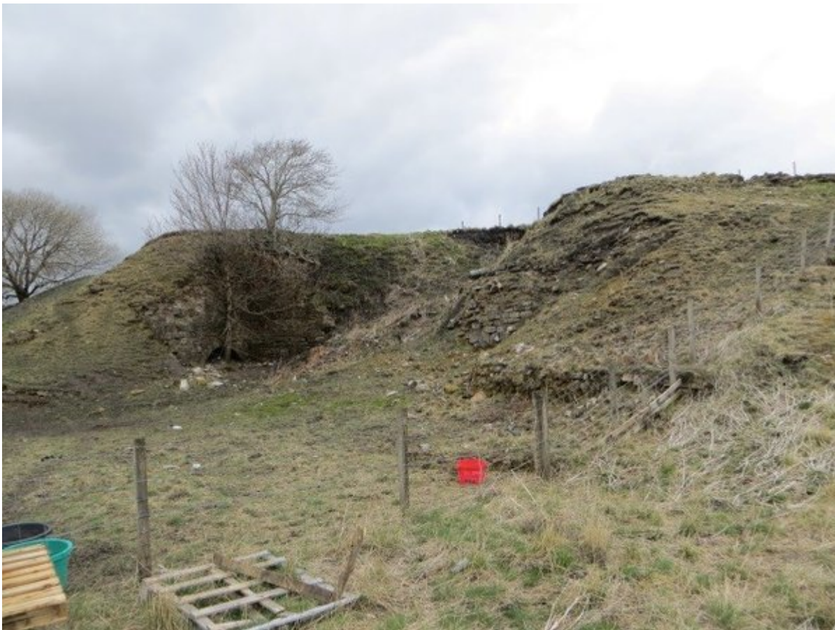
(Figure 9) The ruins of the Glenbuck Ironworks Furnace are visible at the base of the tree in the centre left of the photo. The furnace has been buried by later generations of mine waste.