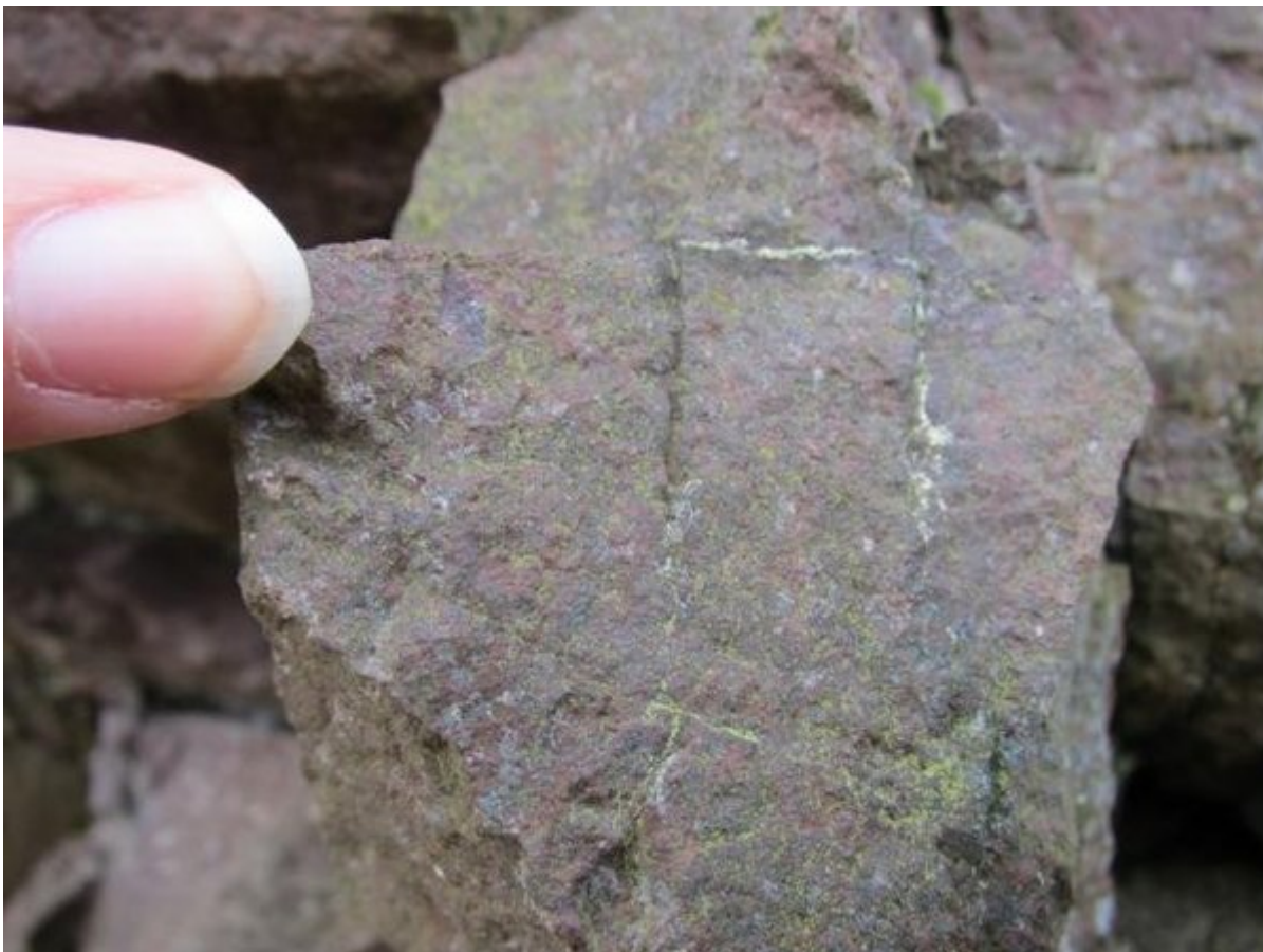
(ELC_8_P7) Detailed view of the trachybasalt flow. The rock is stained red, due to oxidisation of (pseudomorphed) hornblende phenocrysts.