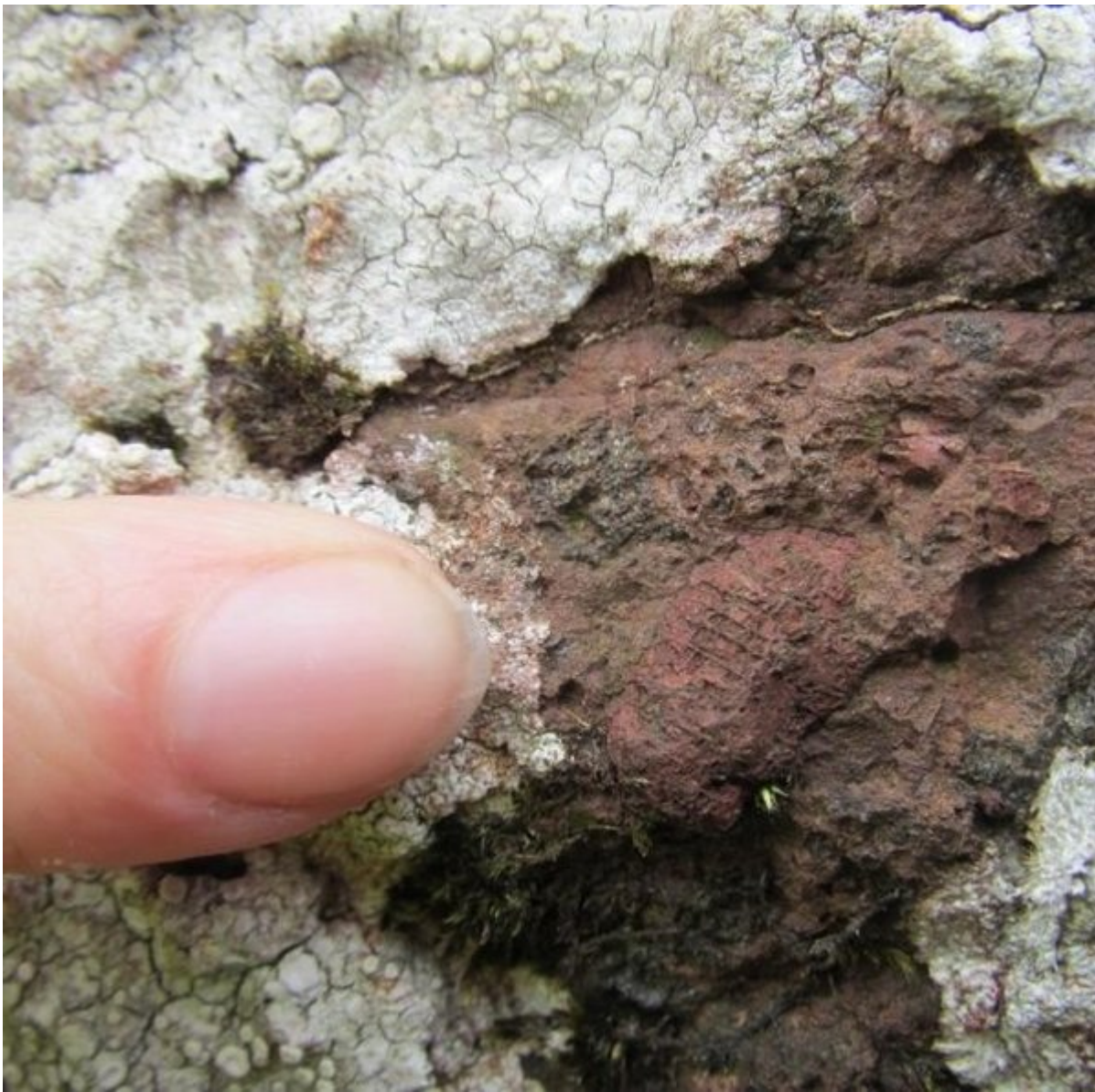
(ELC_8_P5) Detail of a pseudomorph after olivine within the olivine-clinopyroxene-macrophyric basalt, exposed in the Blaikie Heugh escarpment. Finger (resting on white lichen) is pointing toward a red-brown pseudomorphs after olivine. Fine mm-scale ribs, cutting across the pseudomorph from left to right, may represent relict crystal fractures of the original olivine.