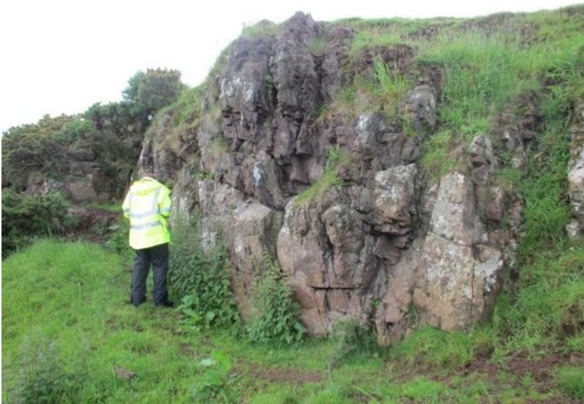
(ELC_8_P6) Minor escarpment to the east of Blaikie Heugh escarpment, displaying a massive, well-jointed trachybasalt flow. Photo looking east.