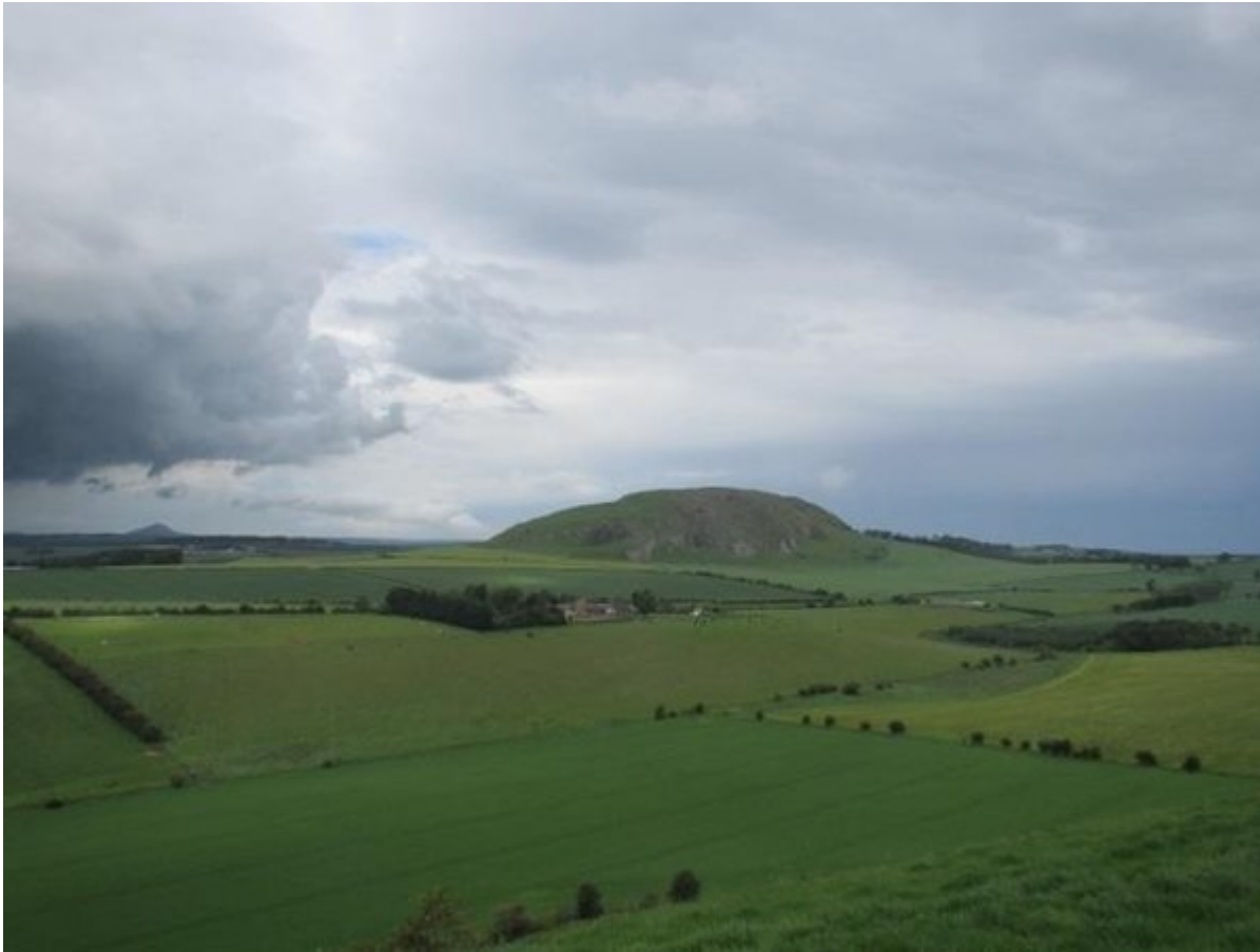
(ELC_8_P1) View of Traprain Law and Berwick Law from Balfour Monument, looking north-east.