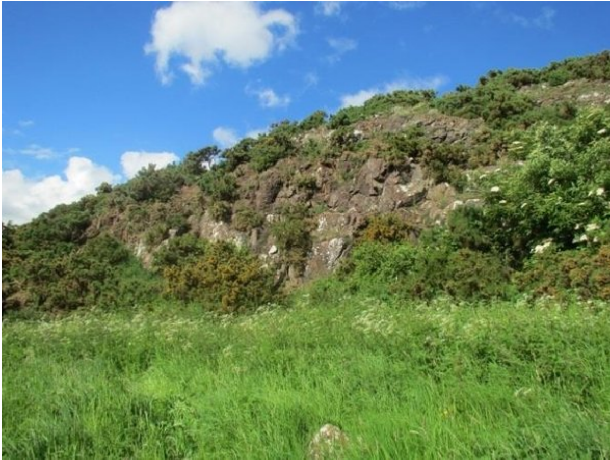
(ELC_9_P2) Old quarry within 'Dunsapie' type basalt, exposed in the Kippielaw Scarp. Randomly orientated joints cross the face, and likely formed during uplift and/or erosion of the basalt flow. Photo looking north-east.