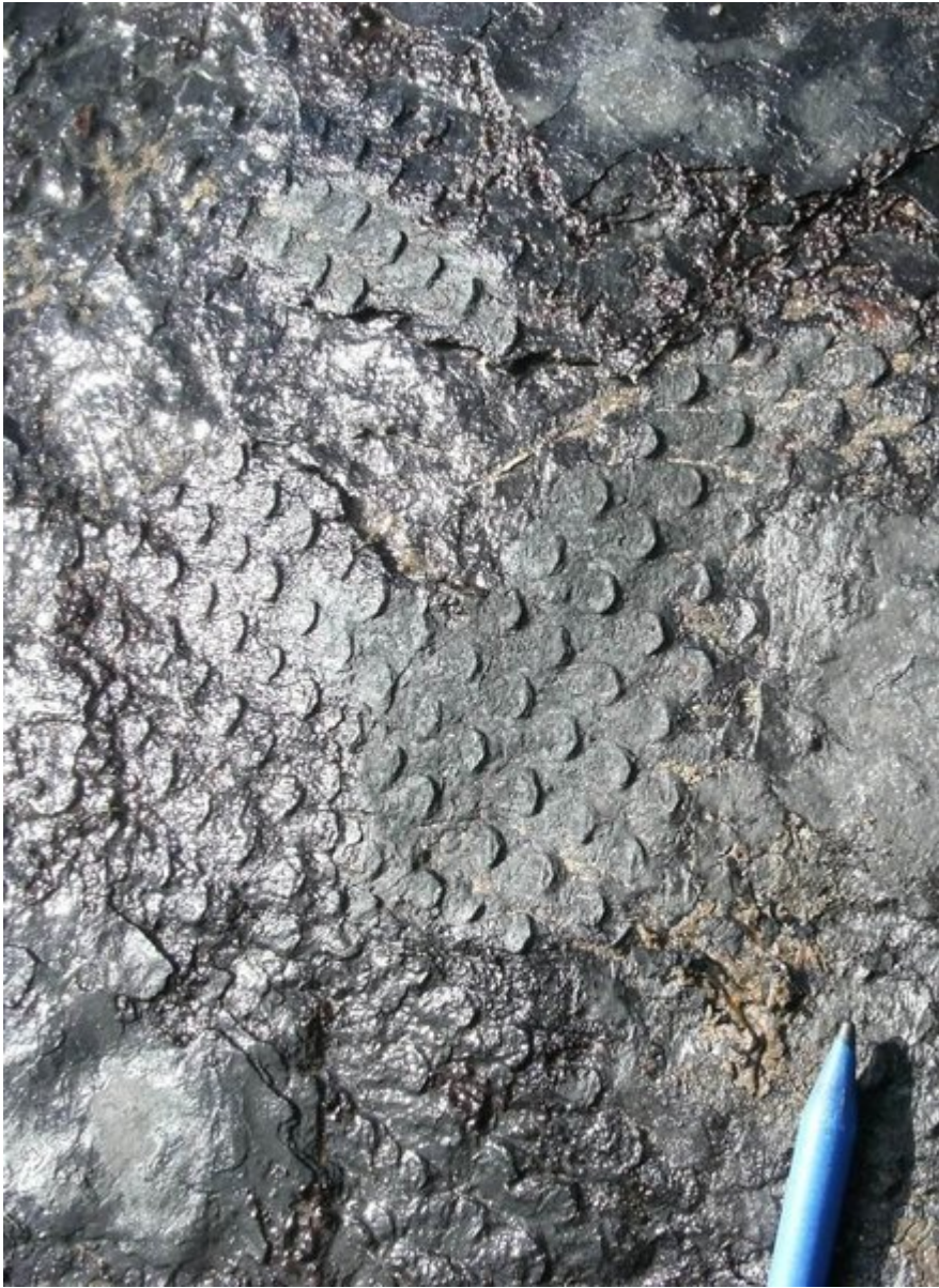
(ELC_13_P3) Lycopod Bark imprints in black shaly mudstone at Hummell Rocks.