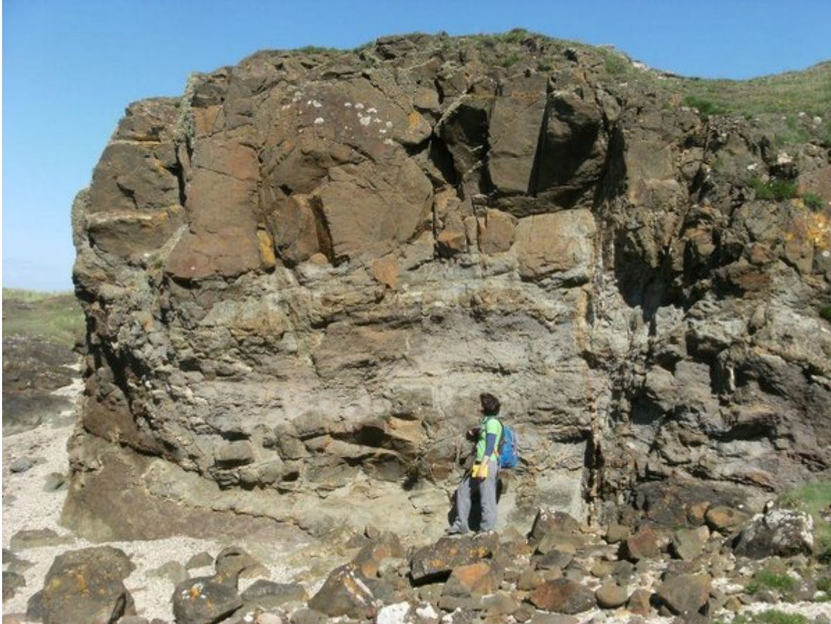
(ELC_13_P2) Intrusive igneous rocks of the Upper Gullane Sill at Gullane Point. The rocks have been extensively hydrothermally altered giving them a sandy, rubbly and veined appearance.