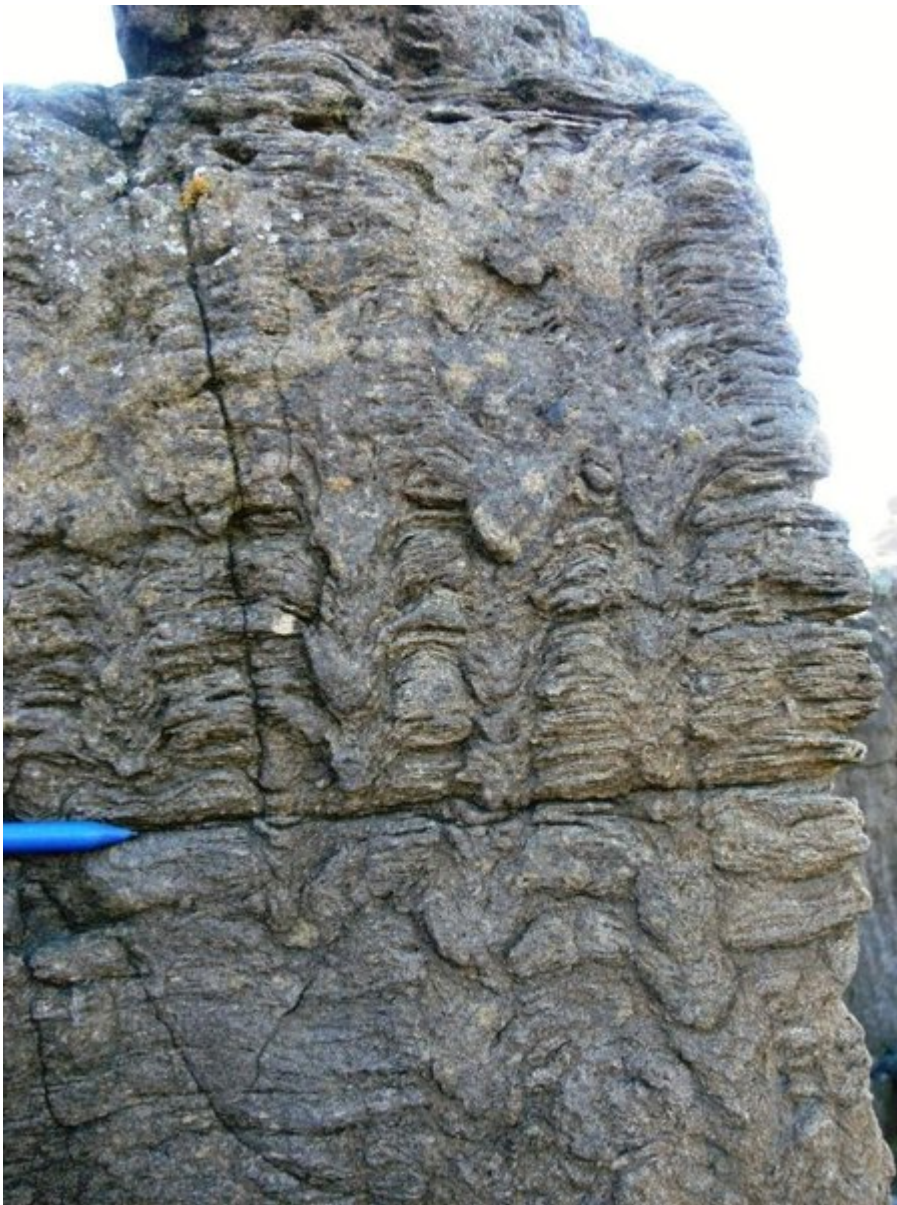
(ELC_13_P4) Burrow traces in sandstone at Hummell Rocks.