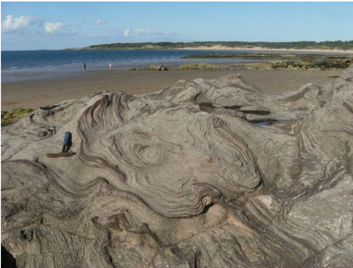
(ELC_13_P5) View of Gullane Bay looking north-east from the Bleaching Rocks. The bedding of the sandstone in the foreground, visible due to iron staining, has been distorted by soft sediment deformation arising from mass flows in the soft, waterlogged sand soon after it was deposited.