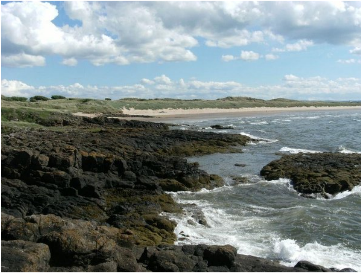
(ELC_13_P1) View of the Upper Gullane Sill (foreground) and the northern end of Gullane Sands looking south from Gullane Point.