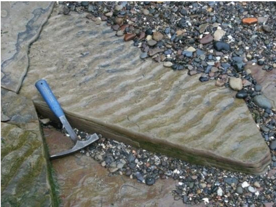
(ELC_15_P8) Ripple structures seen on the surface of the bedding plane. The ripples appear asymmetrical which indicates flow direction. In this case the more gently dipping side of the ripple (stoss side) appears to be to the left of the photograph whereas the steeper dipping side (lee side) appears to be to the right of the photograph. This indicates that the flow direction is from left to right.