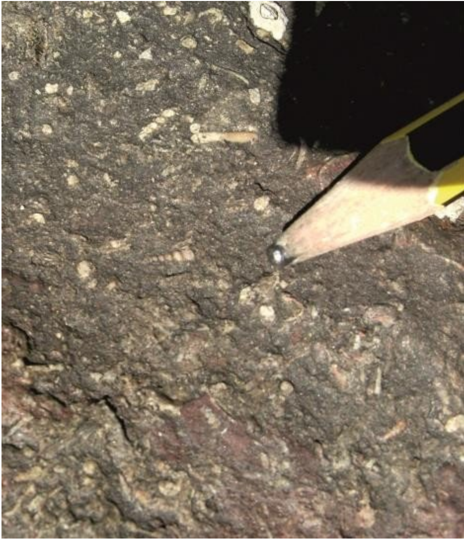
(ELC_15_P5) Shell debris including the spiral outline of a gastropod within the Index Limestone. Most gastropods are marine and live in shallow seas.