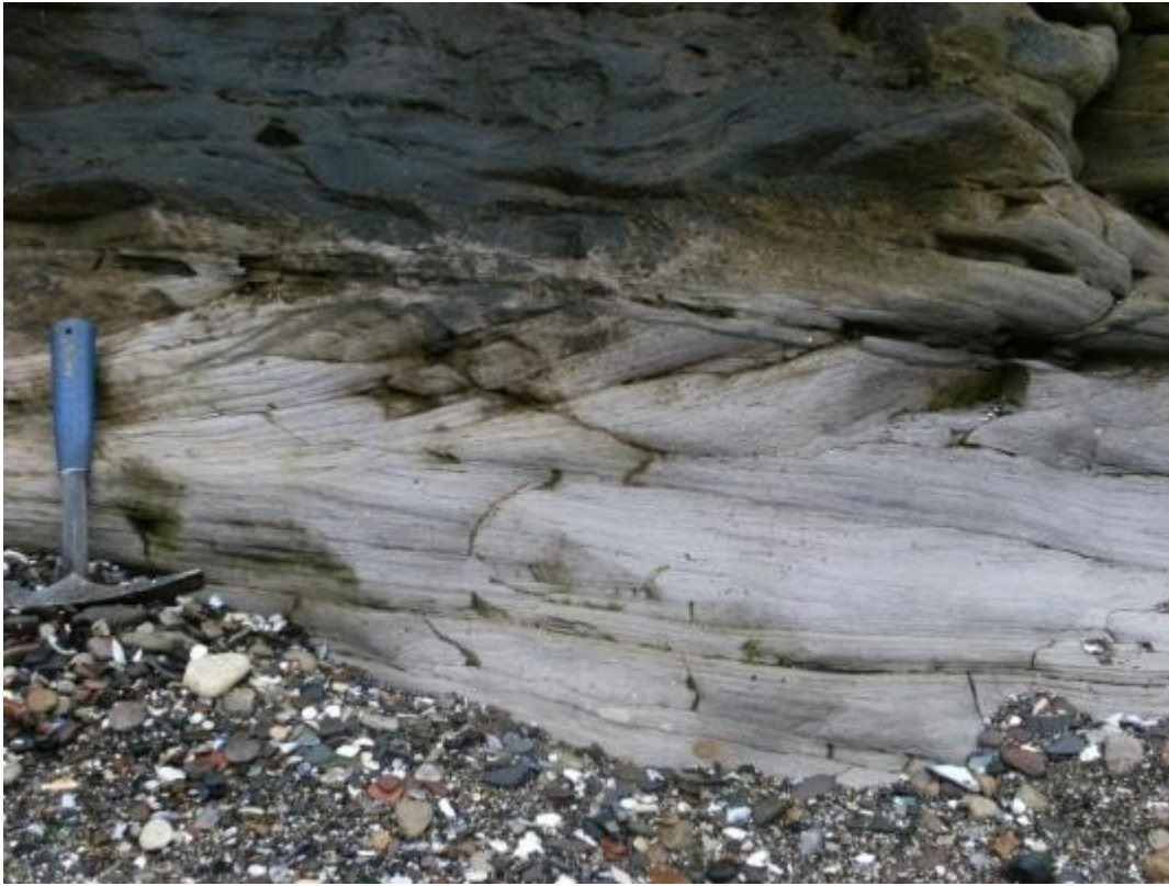
(ELC_15_P2) An example of cross-bedding showing a curved base with the darker area of rock showing a sharp erosive top. This type of sedimentary structure can indicate the possible environmental setting at the time the sands were deposited. In this case the sharp erosive top could indicate a deltaic palaeo environment.