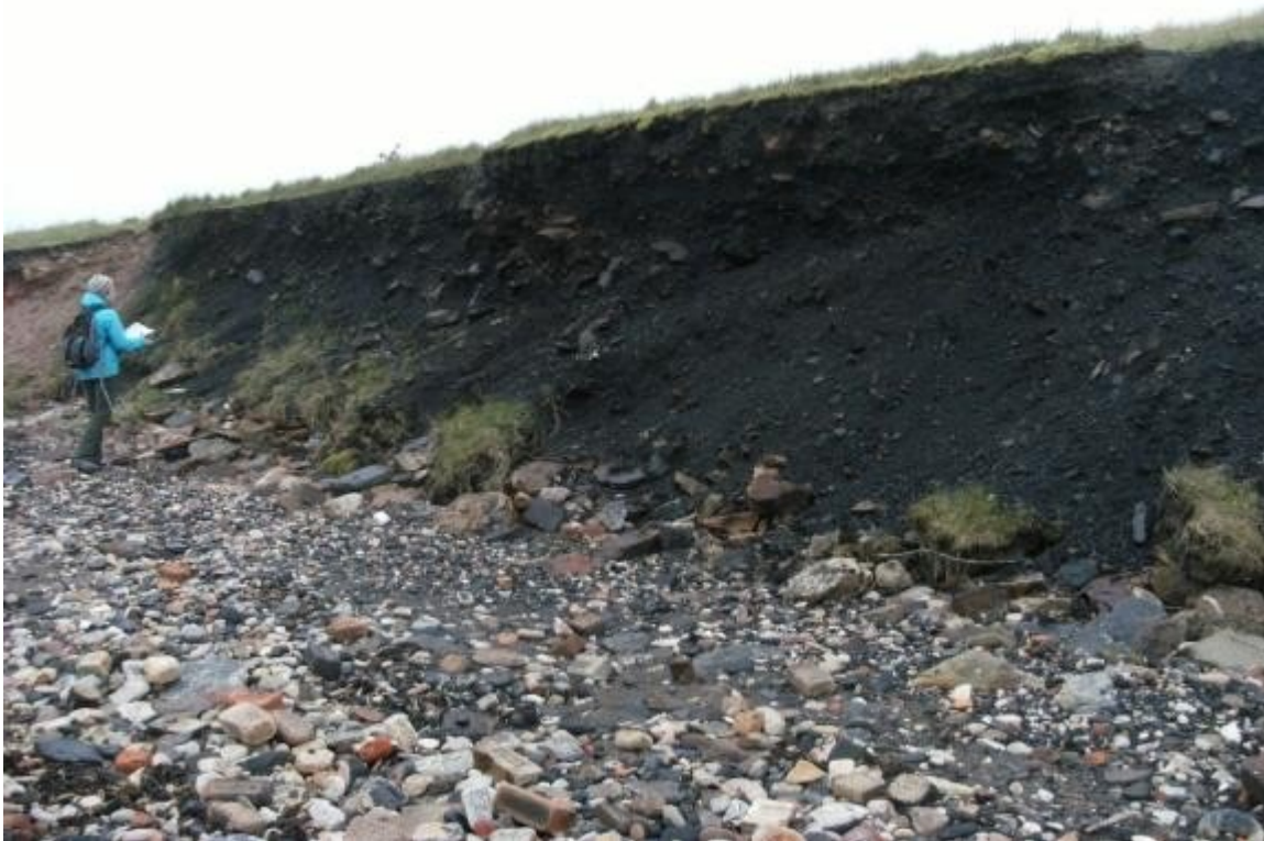
(ELC_15_P9) A cliff section near Morrisons Haven showing the material used to infill the harbour, creating an area of made ground. The spoil used to form this made ground would probably have come from the old coal mine workings within the Prestonpans area.