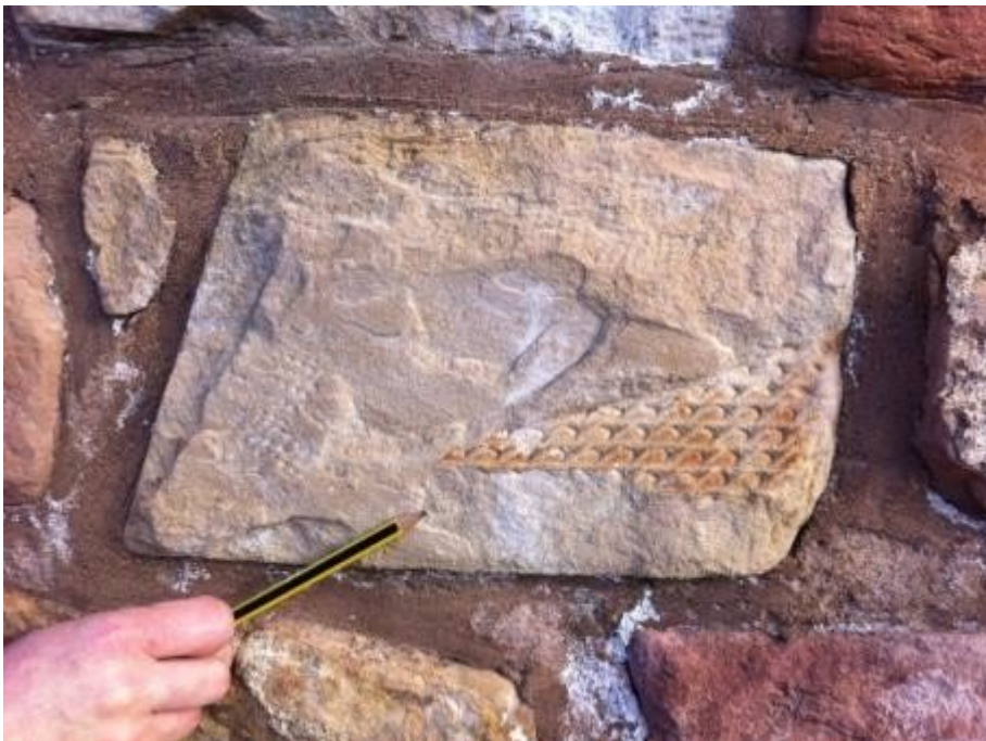
(ELC_15_P13) The buildings along the shoreline are composed mainly of local stone. Features such as cross-bedding and weathering processes can be seen in these building blocks. Here a plant fossil 'Lepidodendron' can be seen within the stone.