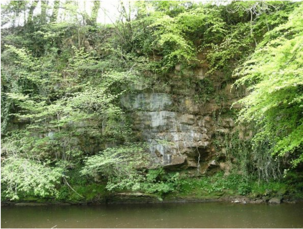
(ELC_17_P1) Cliff section on the west bank of the River Esk. The buff coloured sandstone can be seen resting on the softer mudstone/siltstone which is undercuts the sandstone.