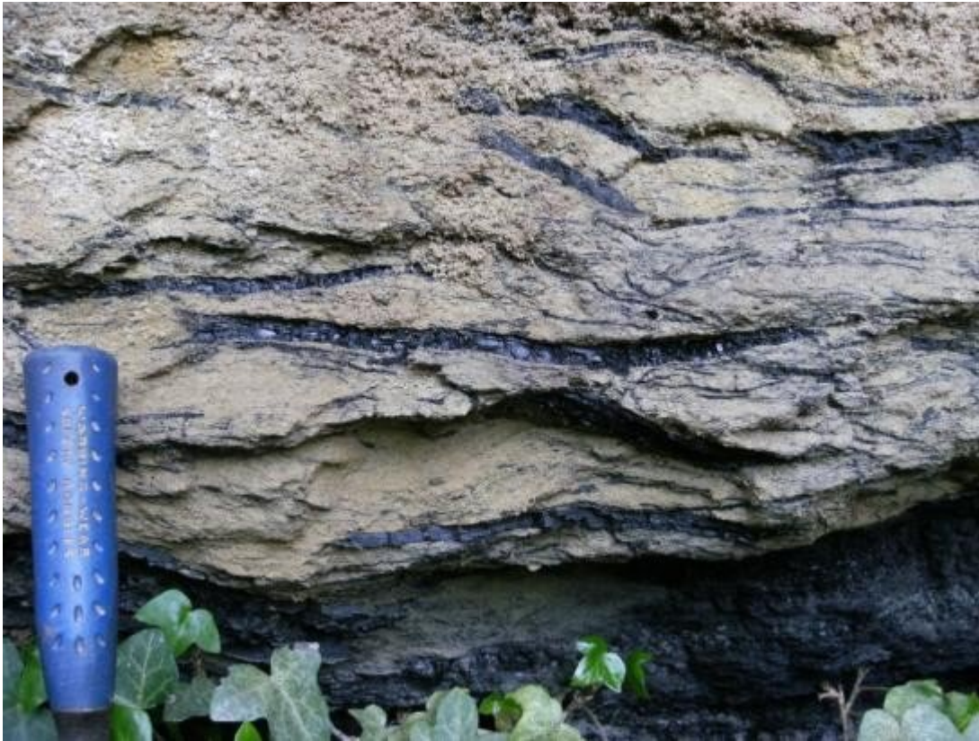
(ELC_17_P5) Coal rafts seen in consolidated material at the base of the sandstone. The coal deposits may have been transported by the sand during deposition in a fluvial environment or are plants remains which have been carbonised into coal.