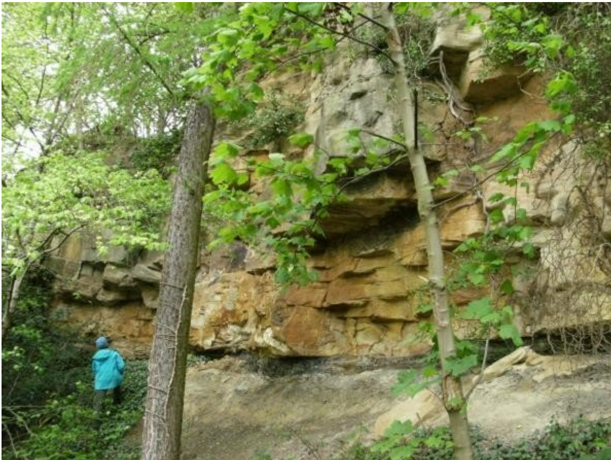
(ELC_17_P4) Cliff section on the east bank of the River Esk. Exposure is showing massive bedded yellow/orange sandstone with a thin layer of coal exposed at its base. Erosive debris at the base of the section is obscuring the true thickness of the coal.