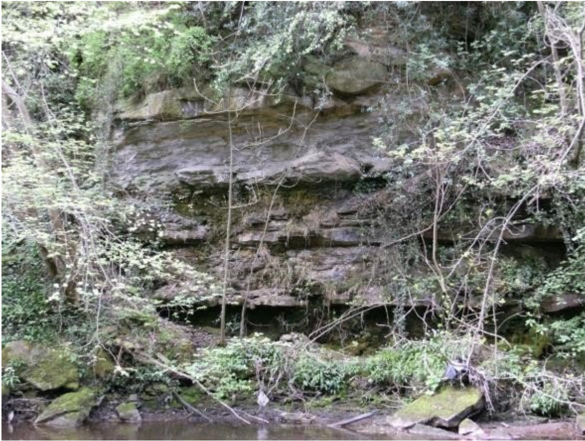
(ELC_17_P3) Interbedded sandston showing differing lithologies, the finer grained silty sandstone beds are being eroded more quickly giving rise to prominent beds of sandstone.