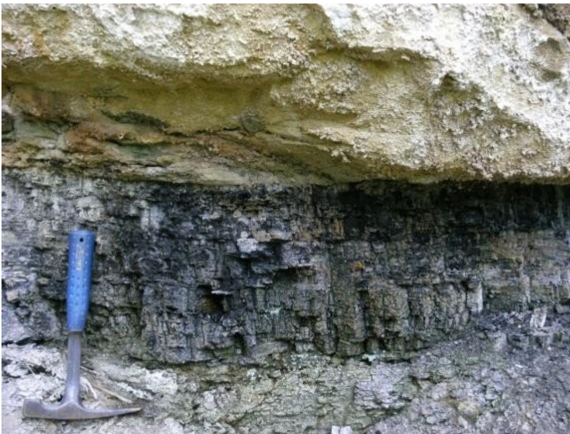
(ELC_17_P6) 20cm layer of coal at the base of the sandstone. The coal is dull black, fractured and sulphurous, yellow staining can be seen.