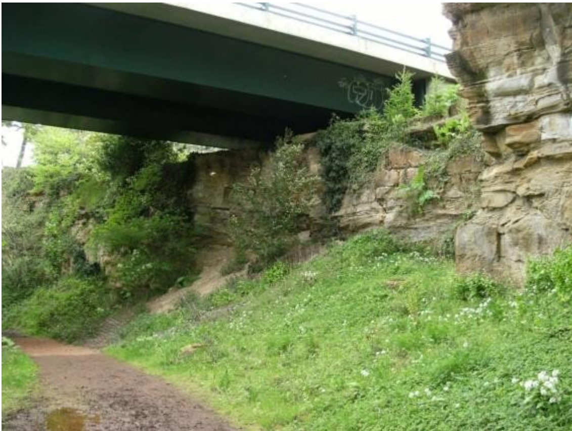
(ELC_17_P7) Cliff section continues along the east bank of the River Esk and has been used as a foundation for the A68 which crosses the river at this point.