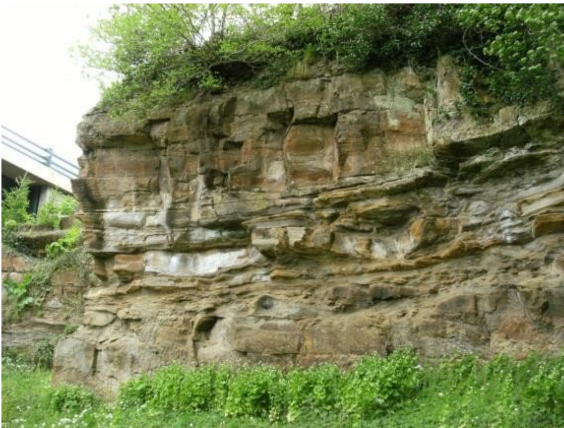
(ELC_17_P8) Cliff section exposing thick beds of sandstone interbedded with thinner beds of silty sandstone. Due to their lithology they are eroding more quickly than the thicker micaceous sandstone beds. The base of the thinner beds indicates a channel like structure. The coal exposed just north of this section is not seen at this location.