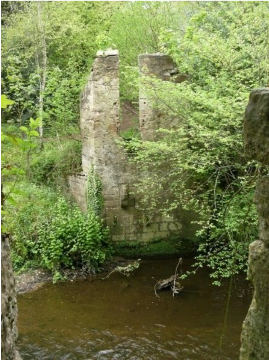
(ELC_17_P9) The footbridge at the 'Meeting of the Waters' is no longer in use.