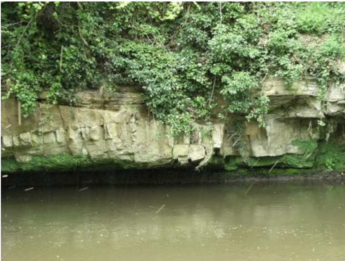
(ELC_17_P2) The thinly bedded sandstone slightly obscured by vegetation appears to be a channel which has cut into the thicker bedded sandstone below. The sharp, erosive contact between the sandstone and the undercutting mudstone/siltstone can be clearly seen © BGS, NERC.