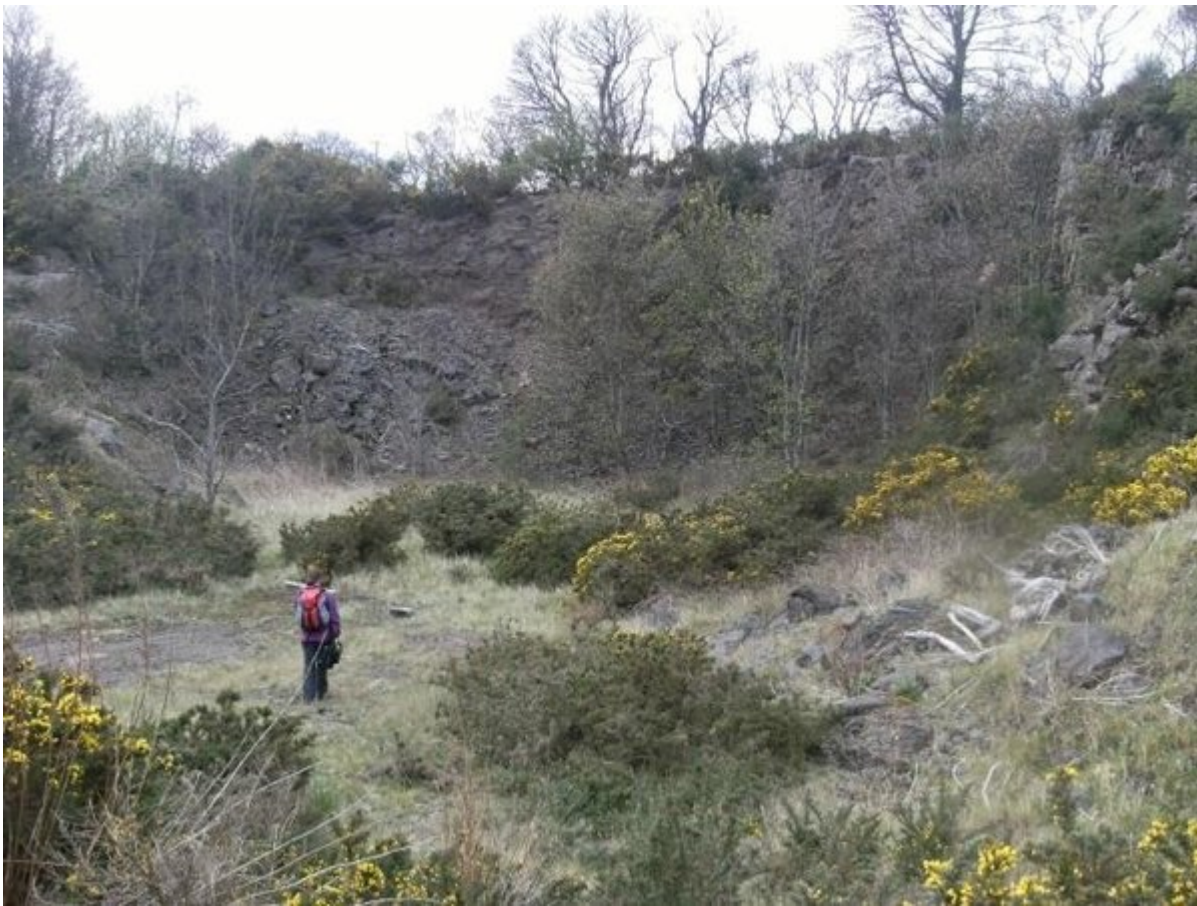
(ELC_18_P1) Pencraig Wood Quarry. The quarry walls are overgrown by gorse and trees, and are covered at their base by rock fall. Photo looking toward the north.