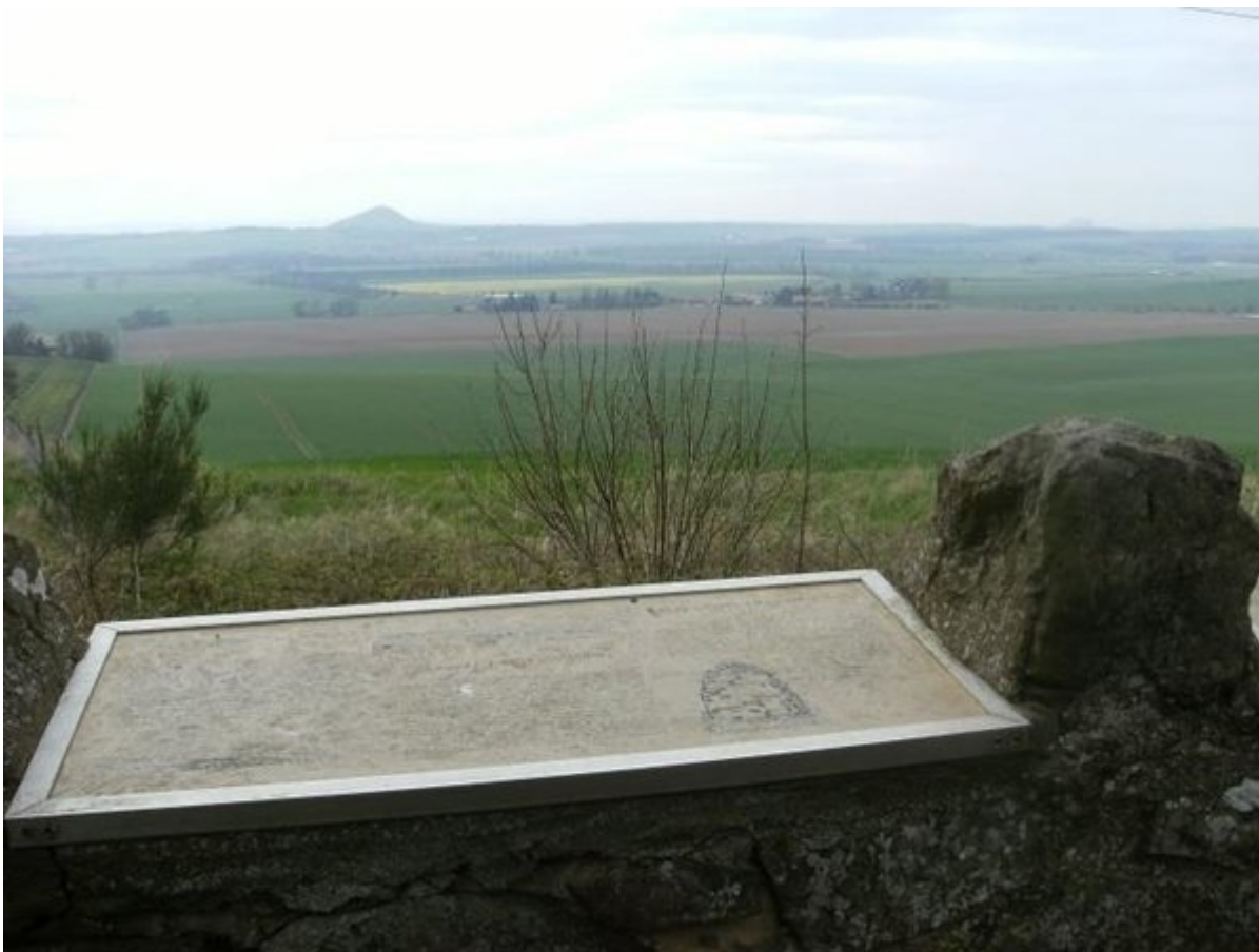
(ELC_18_P4) View from the viewpoint to the north of the car park, looking northward toward North Berwick Law. © BGS, NERC.