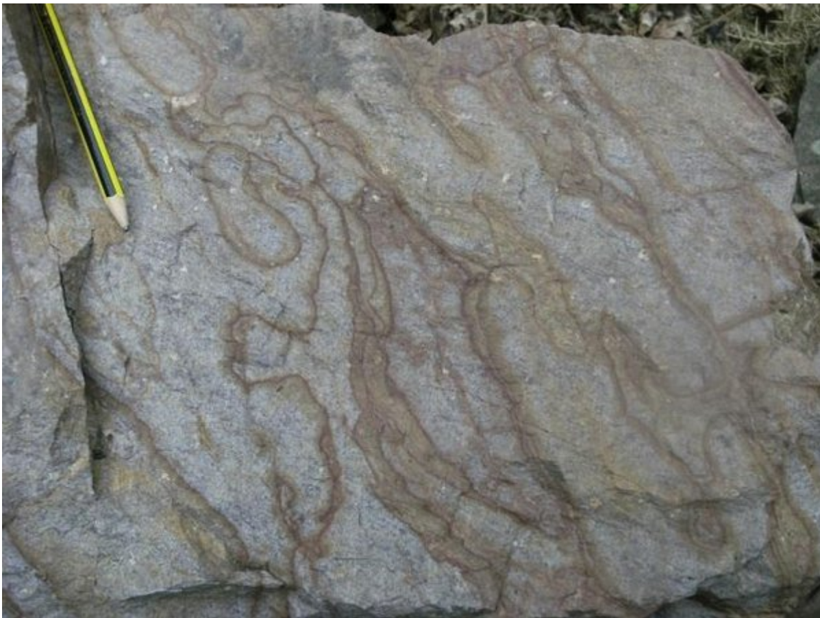
(ELC_18_P2) Iron staining of the trachyte within the quarry, caused by movement of fluids along pore space within the rock.