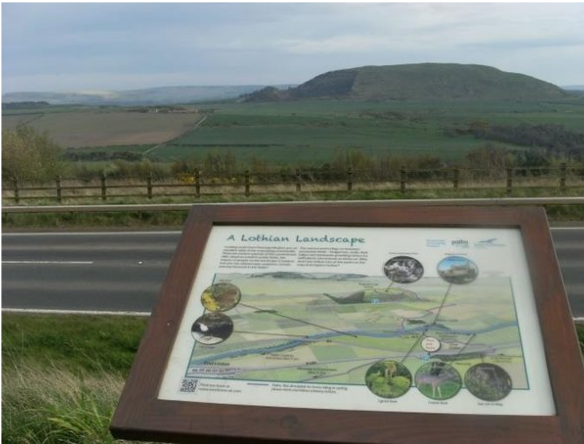
(ELC_18_P3) View from the car park in the east of the site, looking southward toward Traprain Law.