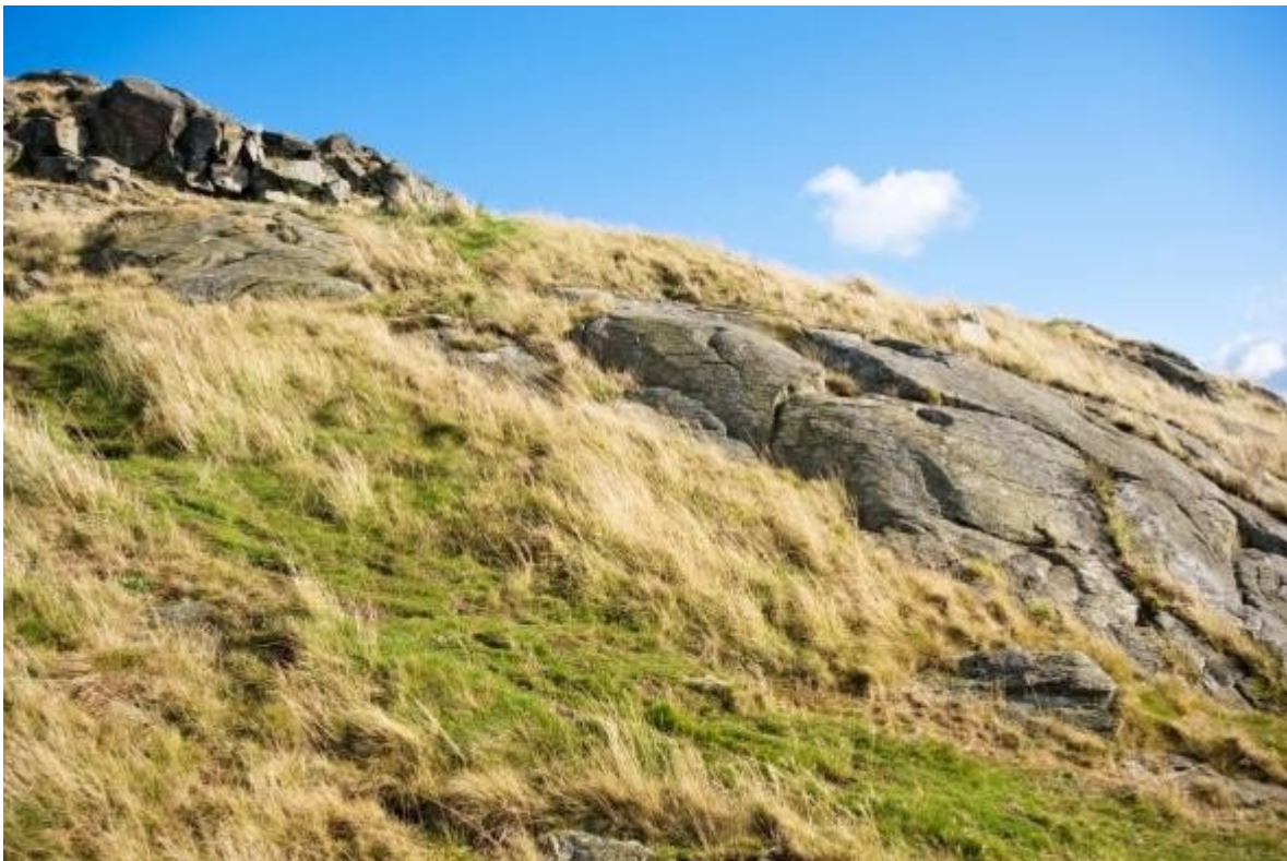
(ELC_19_P4) Ice-moulded bedrock near the summit of North Berwick Law