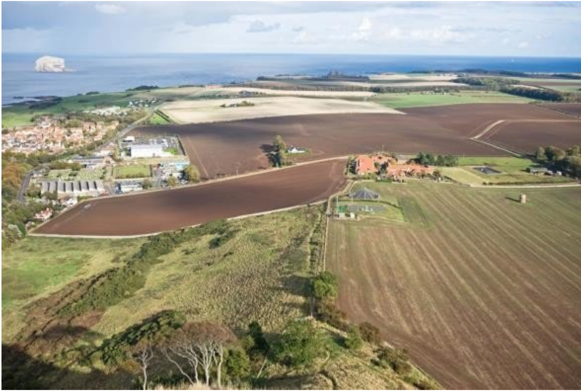
(ELC_19_P3) North Berwick Law crag and tail: view looking down on the 'tail' from near the summit of the Law.