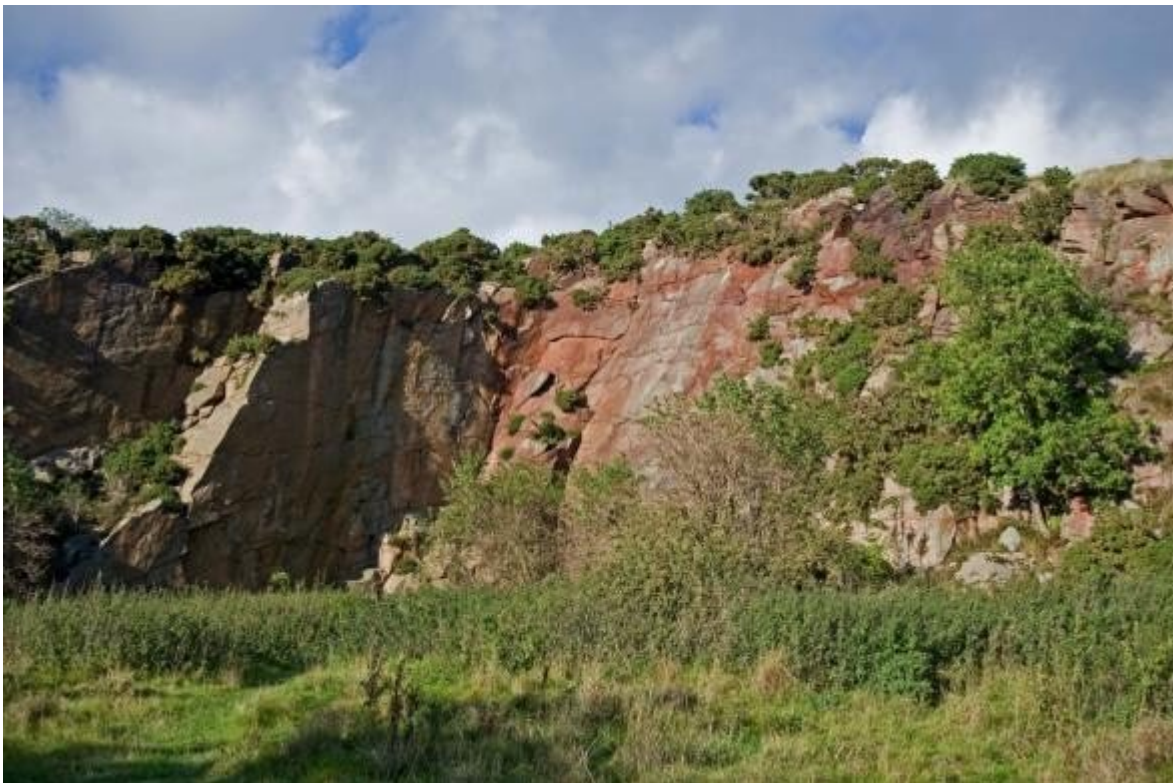
(ELC_19_P2) Former quarry on the south-west side of North Berwick Law showing exposures of phonolitic trachyte. The quarry floor and faces are becoming overgrown in places.