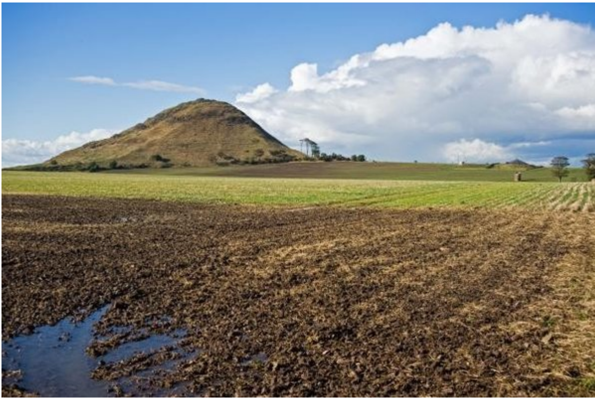
(ELC_19_P1) North Berwick Law crag and tail viewed from the south-east.