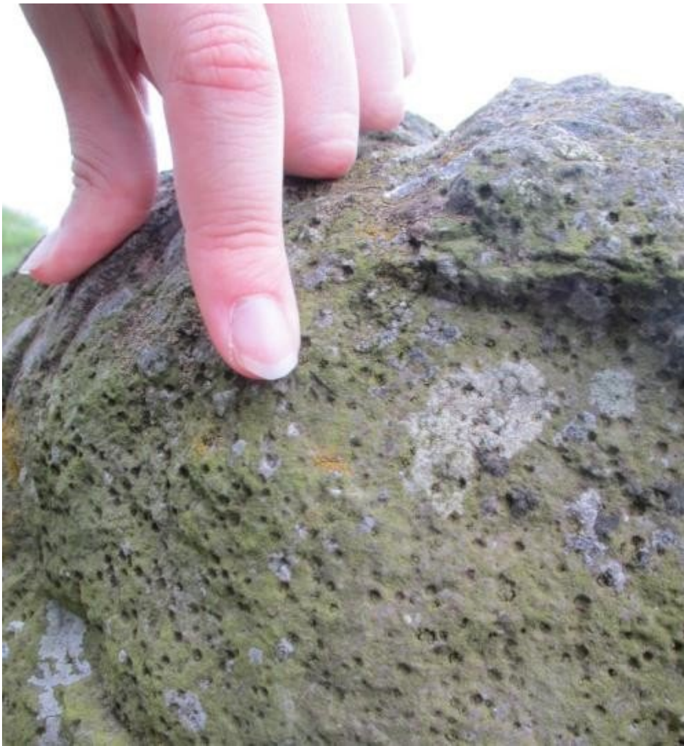
(ELC_20_P5) The speckled appearance of some of the weathered surfaces within the basanite is due to weathering of alkali feldspar with analcime. These weathered out crystals are around 2mm in diameter.