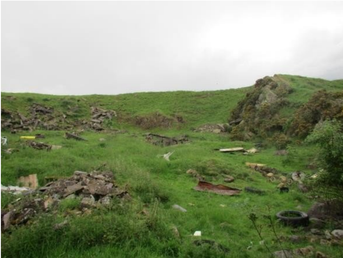
(ELC_20_P2) Kidlaw Quarry. Basanite outcrops to the right of the photo, with the tuff and breccia dyke cropping out in the centre of the photo on the grass bank. The quarry is littered with recent rubbish including tyres, bits of concrete, bits of machinery etc. Photo looking west.