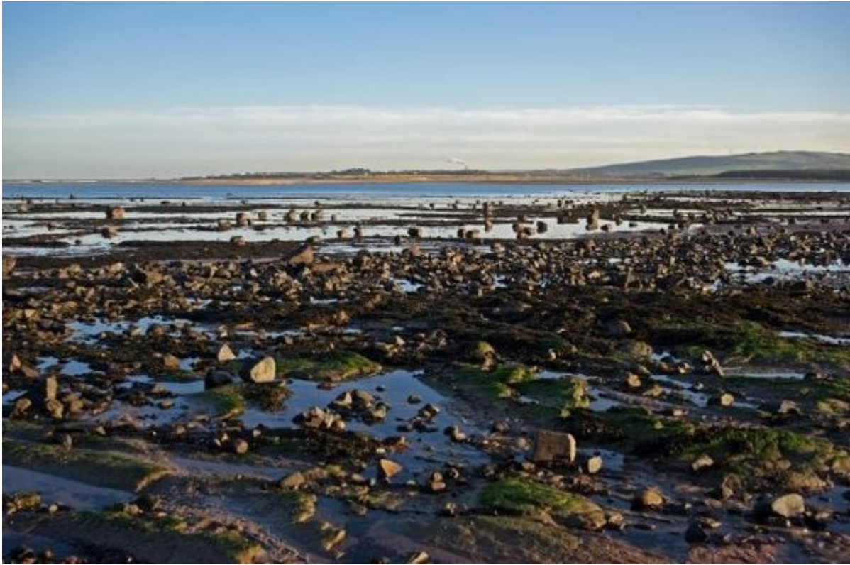
(ELC_28_P4) Intertidal shore platform littered with glacial erratics, north of Sandy Hirst.