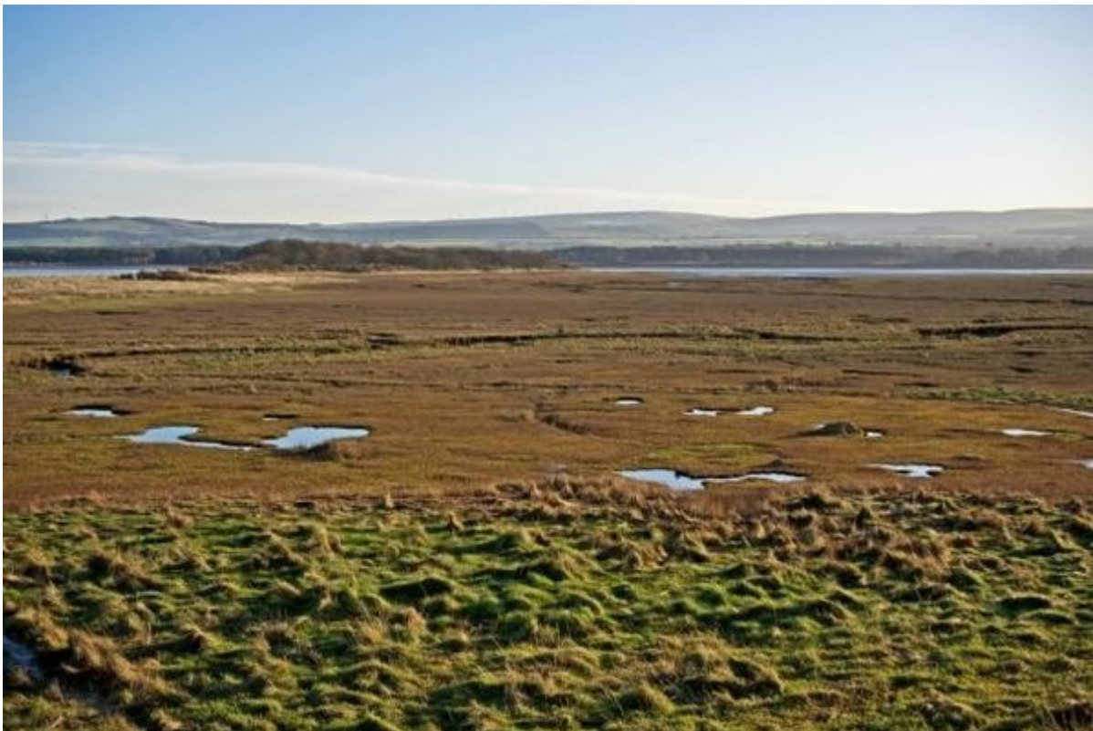
(ELC_28_P5) Saltmarsh on the west side of Sandy Hirst.