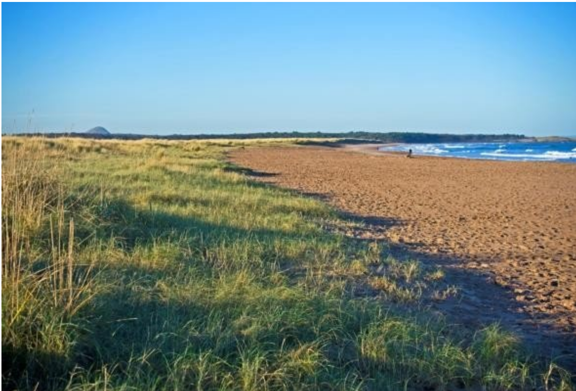
(ELC_28_P7) Present coastal edge of Spike Island.