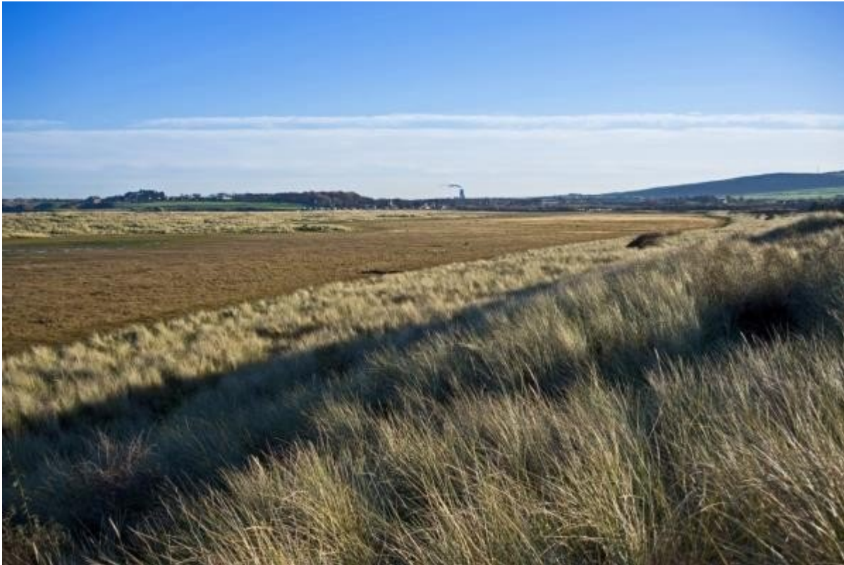
(ELC_28_P6) Saltmarsh development between Spike Island spit (left) and the former coastal edge marked by the line of sand dunes (right).