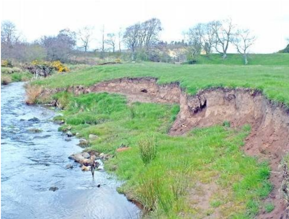
(Figure 18) SP 15. Slumping on River Bank. [NT 3627 5974].