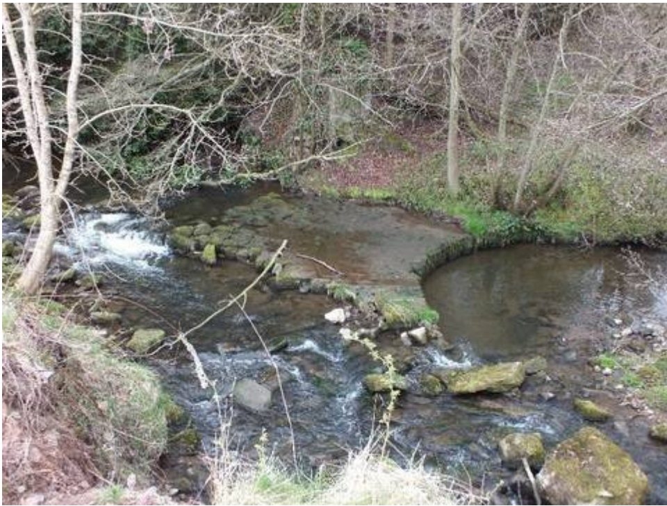
(Figure 24) SP 21. Ford? [NT 3501 6048].