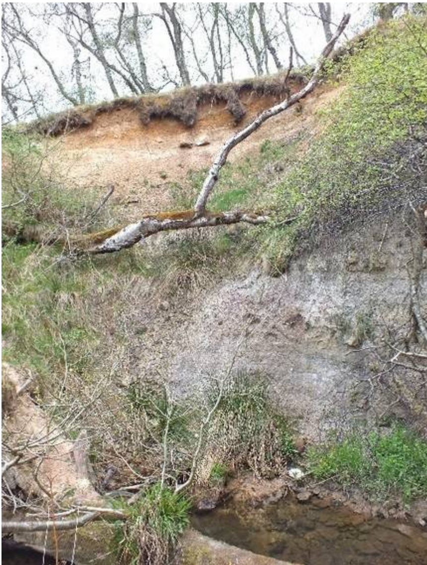
(Figure 11) SP 6. Tyne Water exposure. [NT 3804 6052]