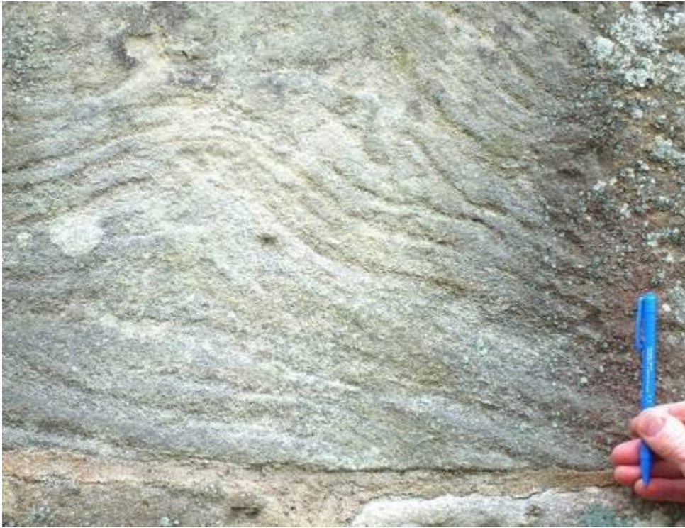
(Figure 7) SP 4. Crichton Kirk. [NT 3811 6161]. Soft sand deformation: north wall, left buttress.