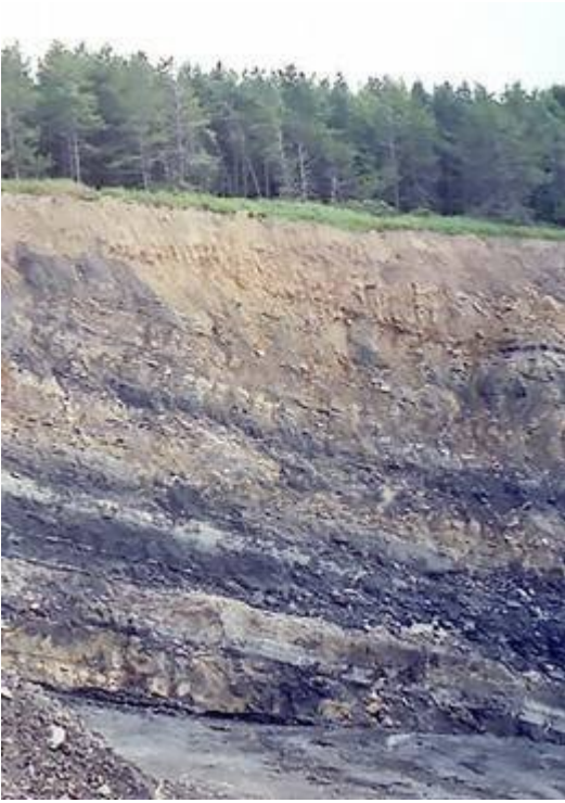
(Figure 29) SP 26. [NT 3536 6212]. Open-cast Coal Mine. Typical rock face.