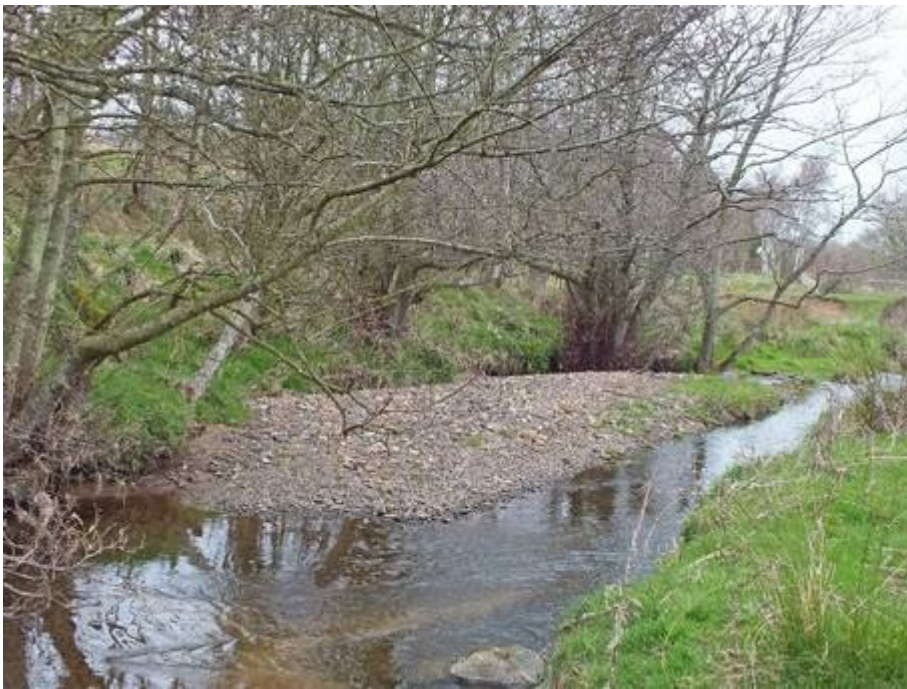
(Figure 20) SP 17. Point bar and alluvial terrace.[ NT 3523 6007]. 26th April 2016.