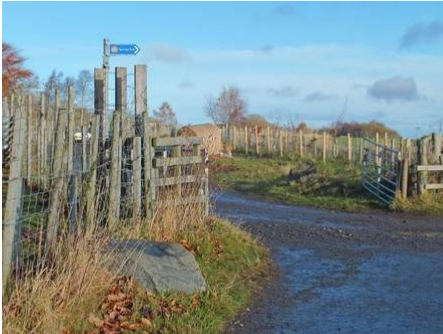
(Figure 32) SP 29. Limestone Boulders [NT 3521 6303]. Two boulders can be seen either side of the gate at the entrance to the track towards Newlandrig.