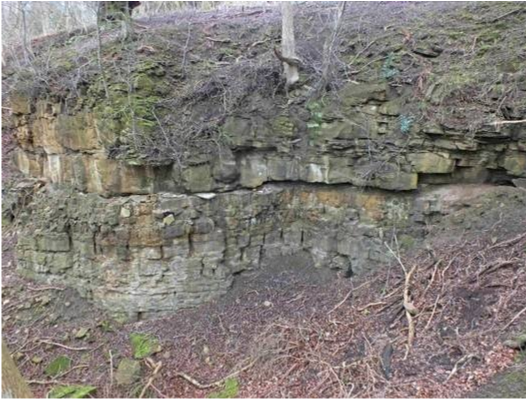
(Figure 4) Quarry below Crichton Kirk [NT 3803 6168]. This shows the upper part of the Upper Crichton Limestone with overlying cross bedded sandstone.