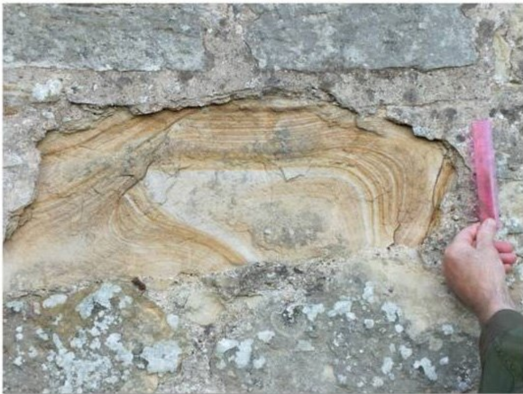
(Figure 16) SP 12. Sandstone in the walls of Borthwick Castle. [NT 370 598]. Leisagang rings.