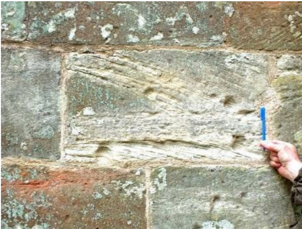
(Figure 6) SP 4. Crichton Kirk. [NT 3811 6161]. Geologically, this block is laid upside-down: the first layers deposited are at the top of the block, and were laid down at an angle. Then the tops of these layers were eroded before the second set of layers were laid down horizontally