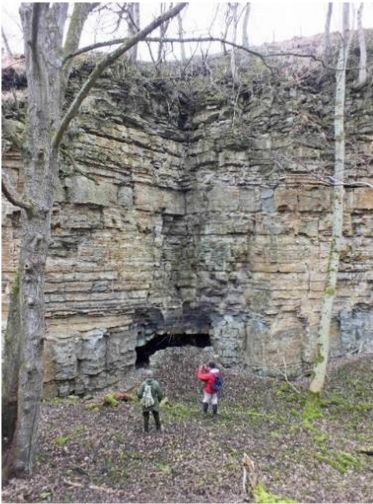
(Figure 2) SP 1a. Currie Lee Limestone Quarries. [NT 3817 6240].