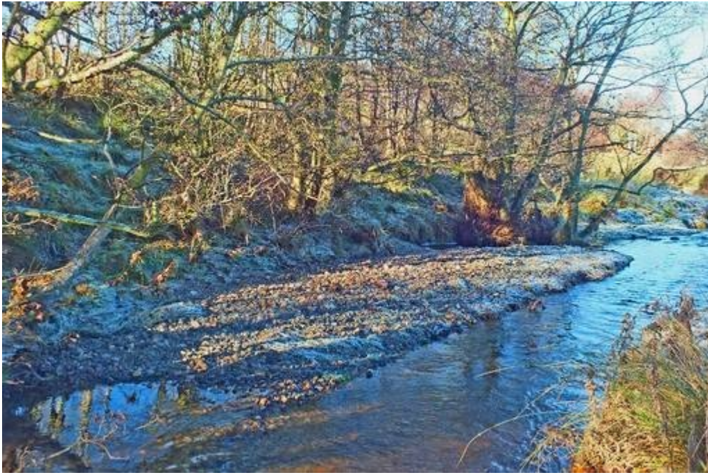
(Figure 21) SP 17. Point bar and alluvial terrace. [NT 3523 6007]. 30th November 2016