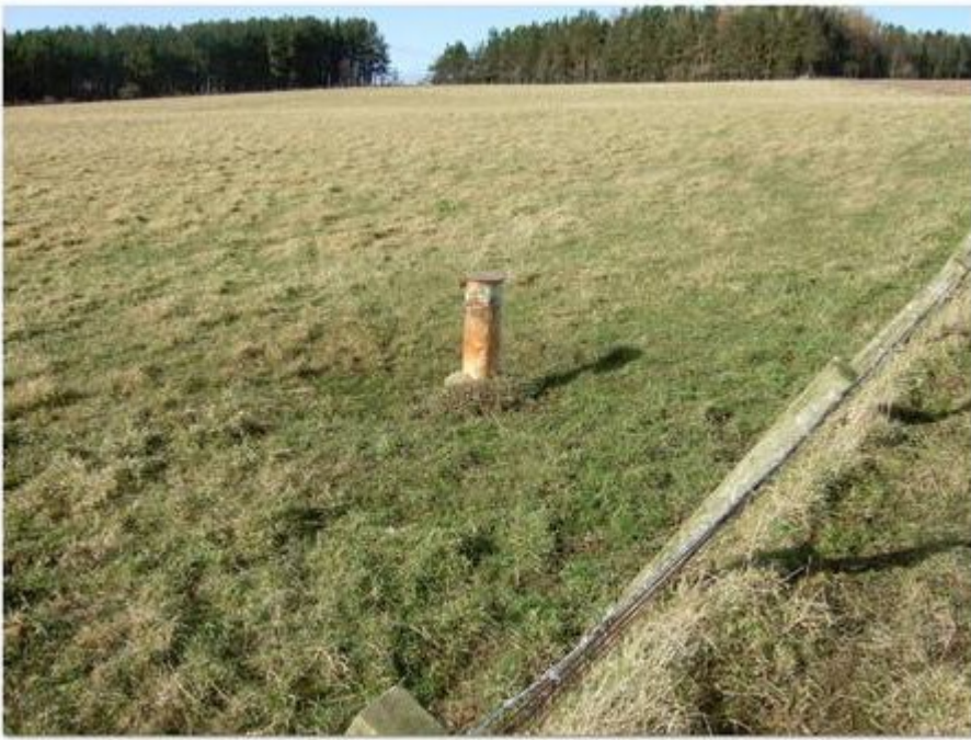
(Figure 35) SP 34 (Walk 1 SP 6) .Metal capped borehole. [NT 364 632].