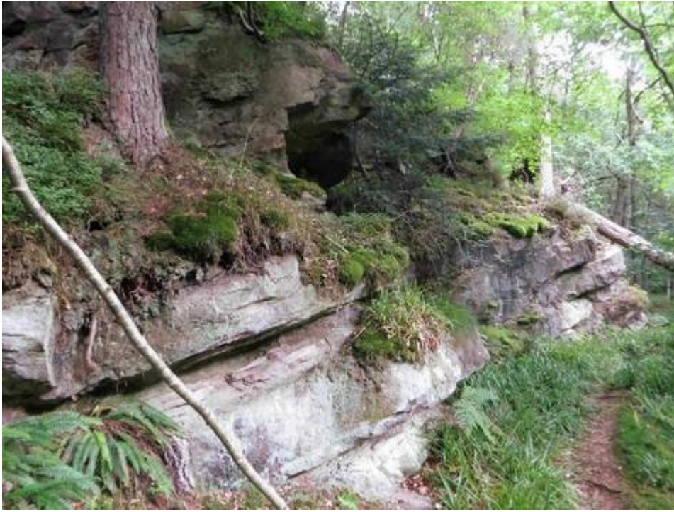
(Figure 13) SP 9. 10 m thick sandstone exposure on Gore Water. [NT 376 595].