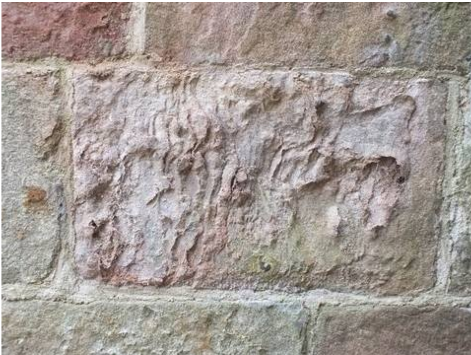
(Figure 8) SP 4. Crichton Kirk. [NT 3811 6161]. Cross bedding. Weathering has accentuated the features.