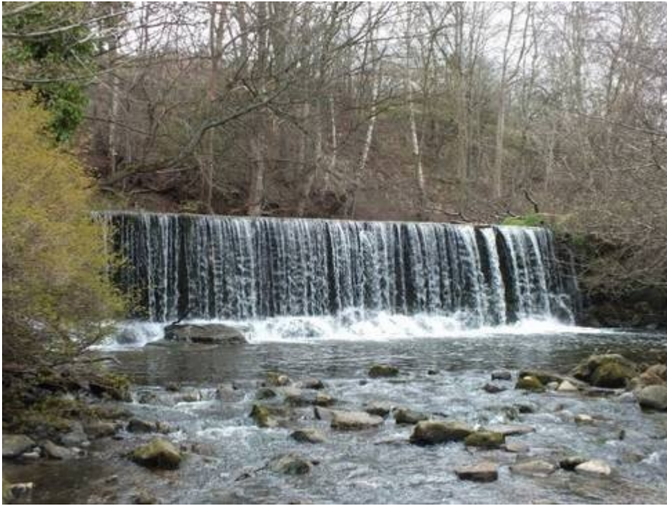
(Figure 23) SP 20. Weir, downstream from Catcune Mills. [NT 3502 6050]