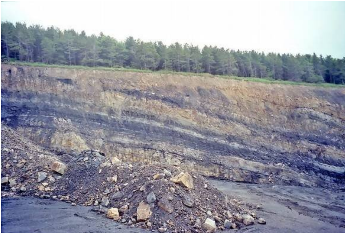
(Figure 28) SP 26. [NT 3536 6212]. Opencast Coal Mine. Typical rock face.