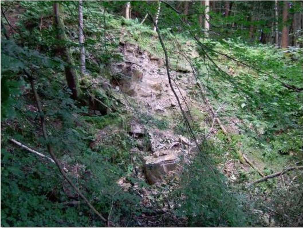
(Figure 15) SP 11. Rockfall. [NT 3728 5960]