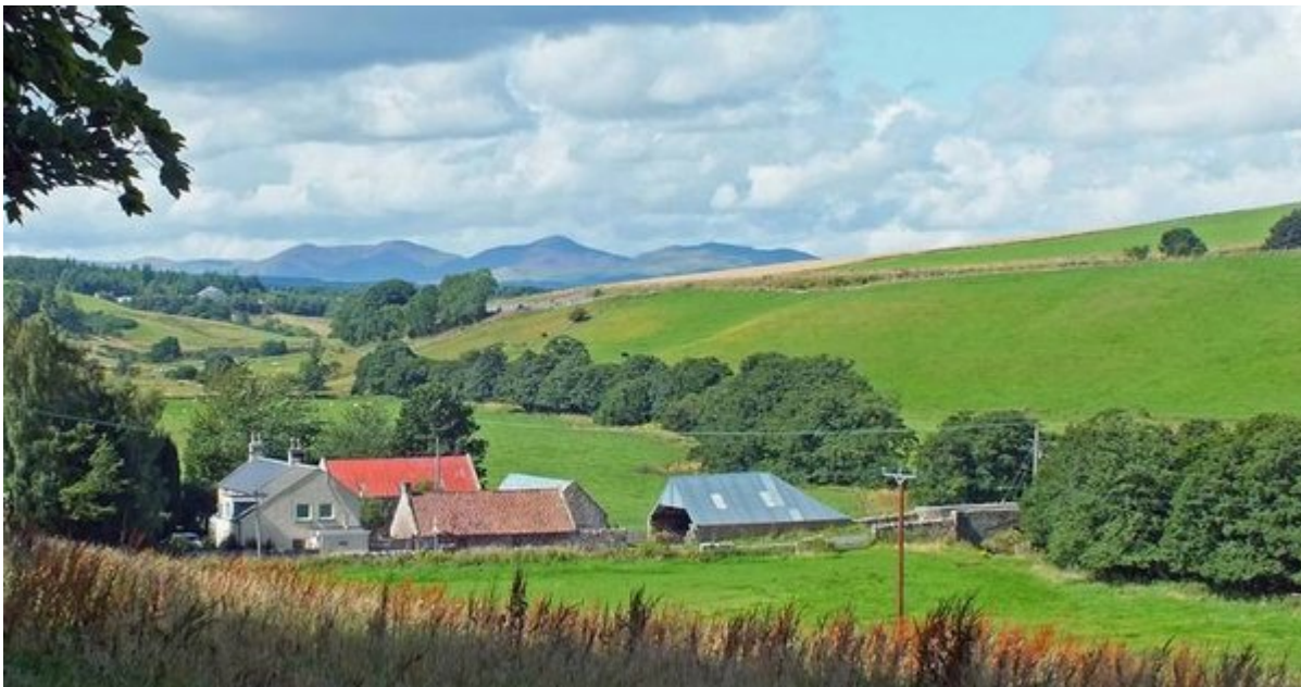
(Figure 17) View down the Gore Valley from the entrance to Borthwick Castle.