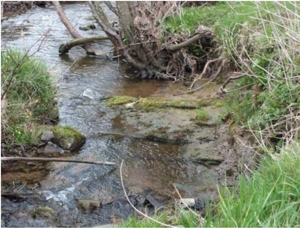
(Figure 22) SP 19. Sandstone. [NT 3505 6044].