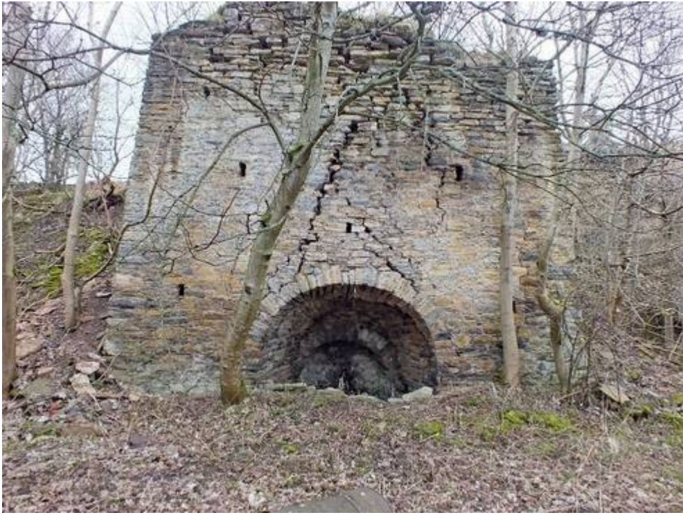
(Figure 3) SP 1b. Lime Kiln.