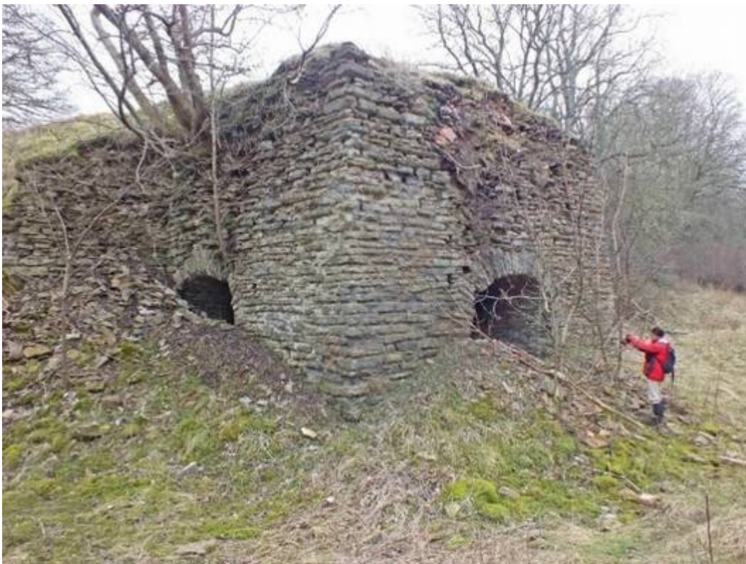
(Figure 5) SP 2. Currie Lee Limestone Quarries. SP 3. Lime Kiln at [NT 3795 6205].