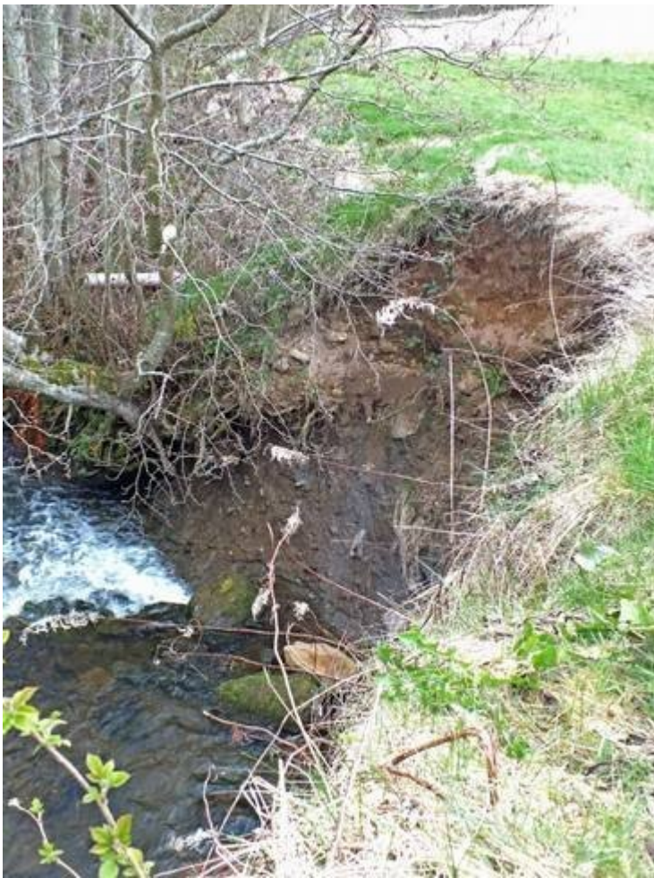
(Figure 25) SP 22. Glacial Till in River Bank. [NT 3490 6072]