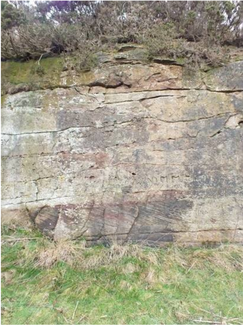
(Figure 9) SP 5. Crichton Castle. NT 3807 6103]. Quarry of yellow sandstone, Aberlady Formation