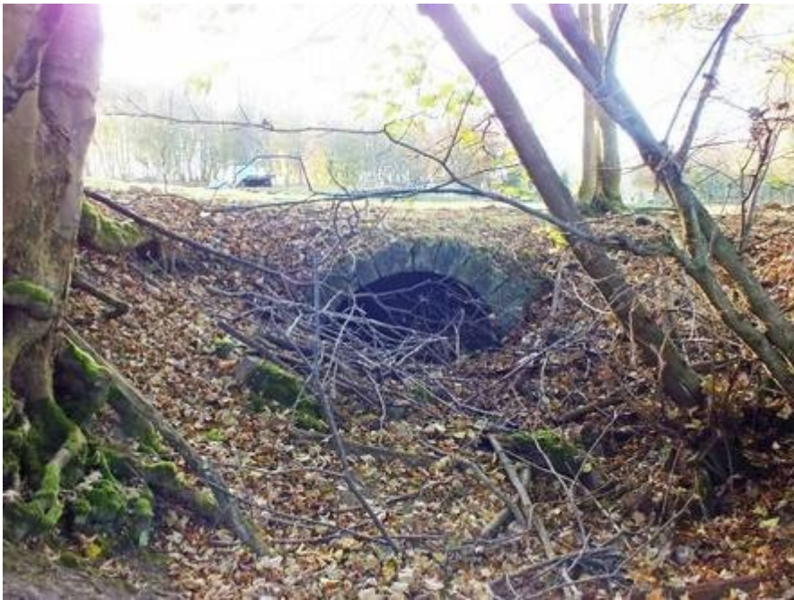
(Figure 34) SP 30. Arch over a shallow trench. A former waggonway for hauling lime down to Mayfield and beyond. [NT 3519 6335].