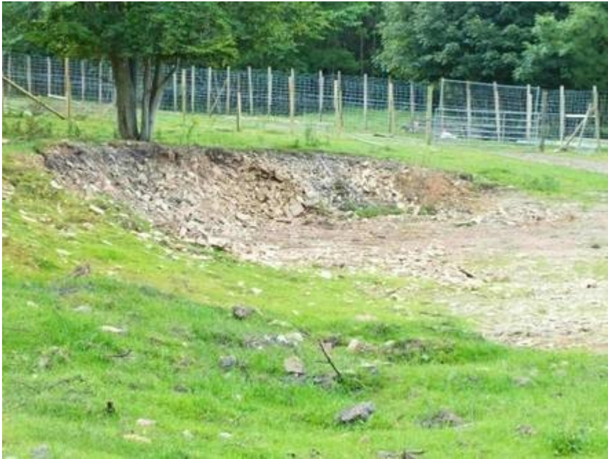
(Figure 33) SP 30. Spoil heap from old limestone quarry. [NT 3519 6335].