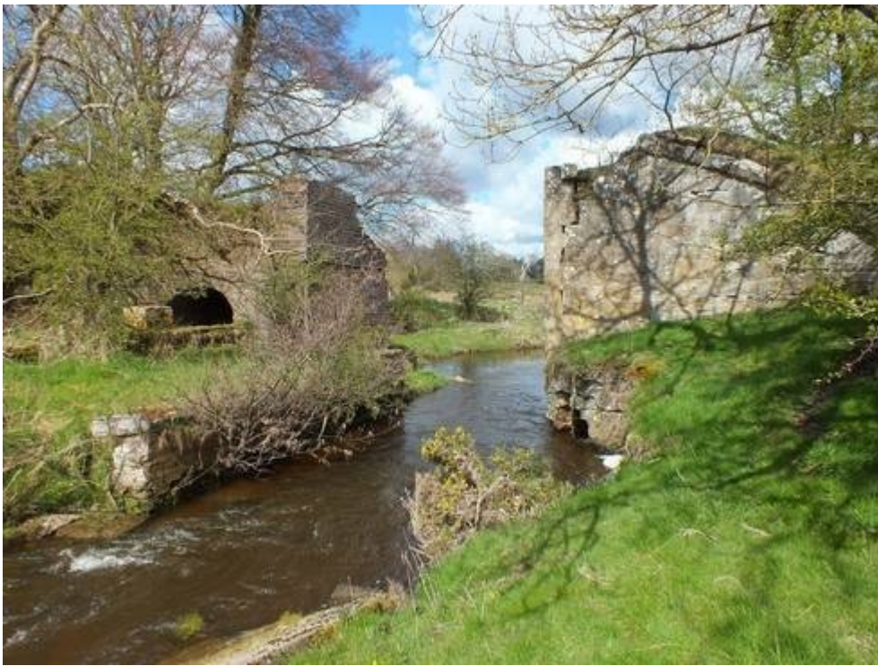
(Figure 19) SP 16. Broken Bridge. [NT 3539 5990].