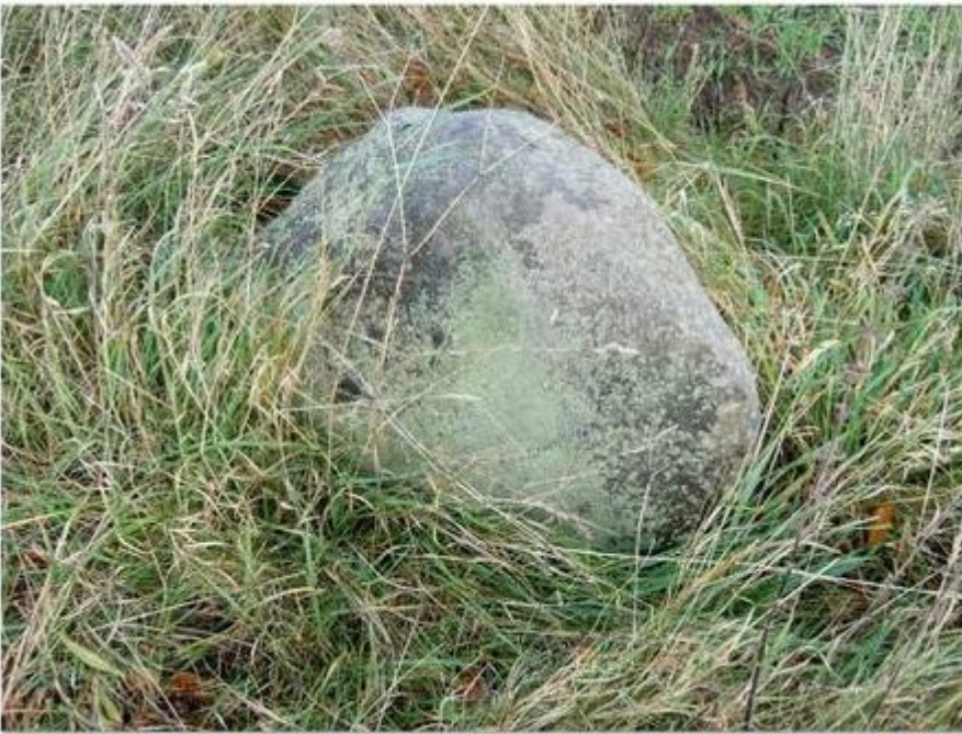
(Figure 36) SP 36 (Walk 1 SP 4) . Boulders beside path. Left after the retreat of the ice after the last glaciation. [ NT 366 630].