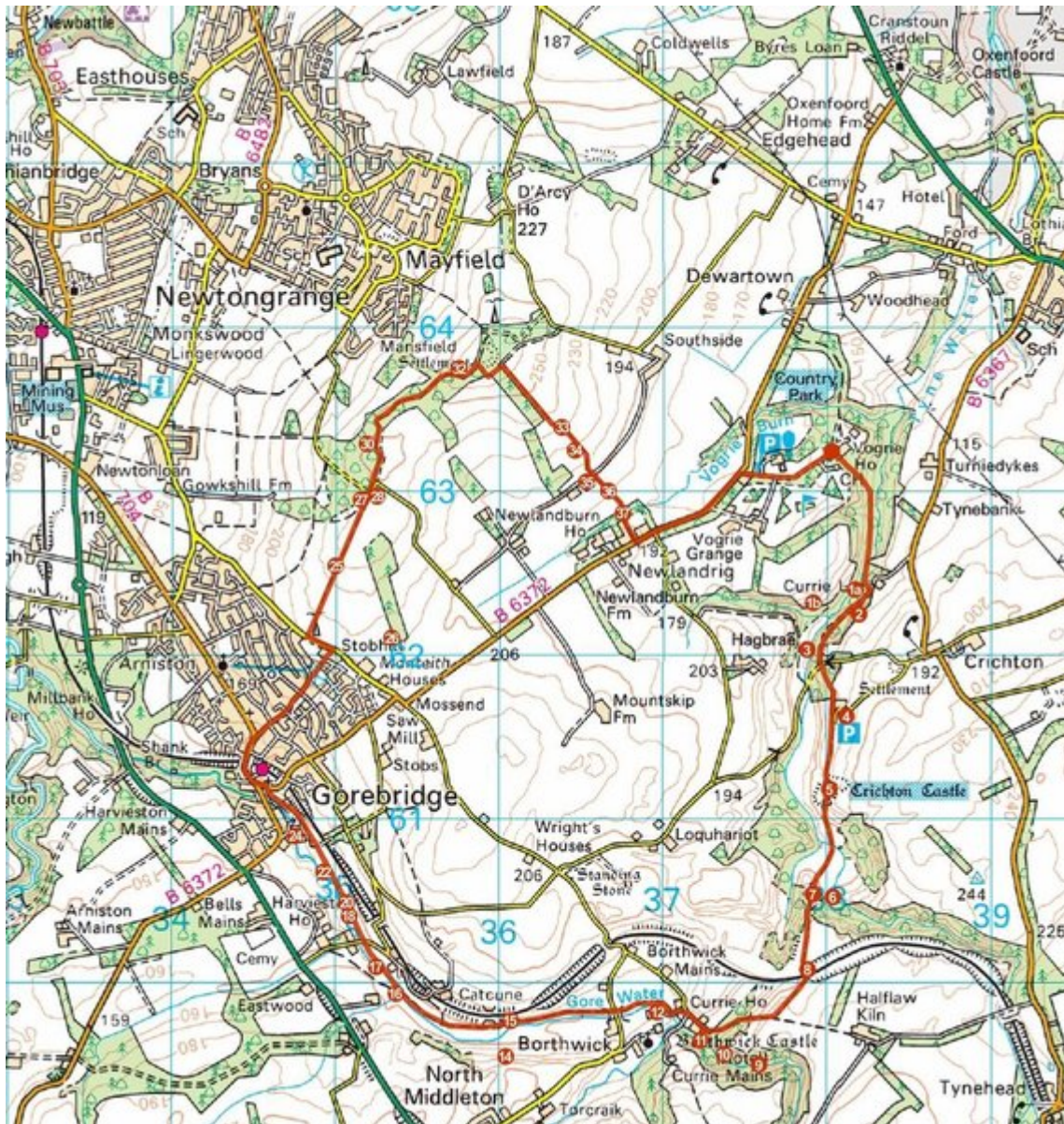
(Figure 1) Location map.

(Figure 36) SP 36 (Walk 1 SP 4). Boulders beside path. Left after the retreat of the ice after the last glaciation. [NT 366 630].