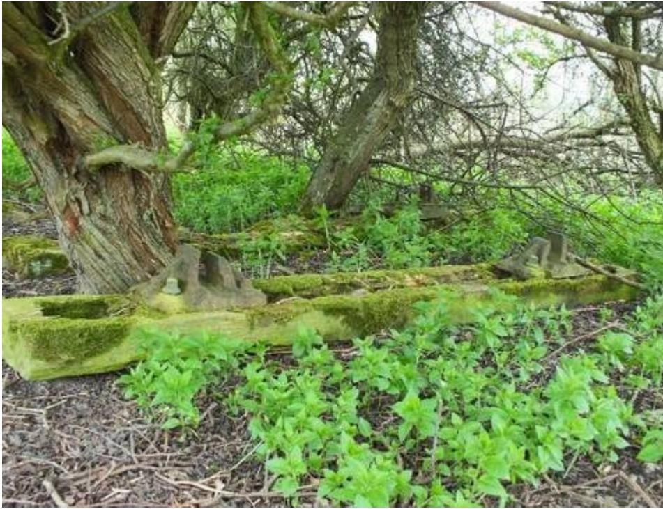
(Figure 12) SP 8. Former Railway. [NT 3788 6036]. Old sleeper left behind after dismantling of the railway sidings.