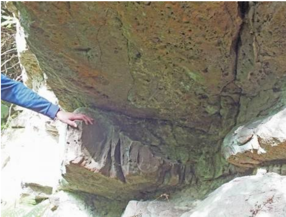
(Figure 14) SP 10. Sandstone exposure. [NT 3745 5963] Trough cross-bedding..