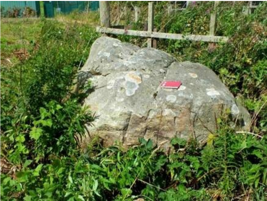
(Figure 30) SP 27. Coarse-grained well cemented sandstone. [NT 3518 6298].