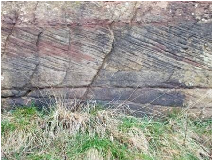
(Figure 10) SP 5. Crichton Castle. [NT 3807 6112]. Quarry of red sandstone, Aberlady Formation