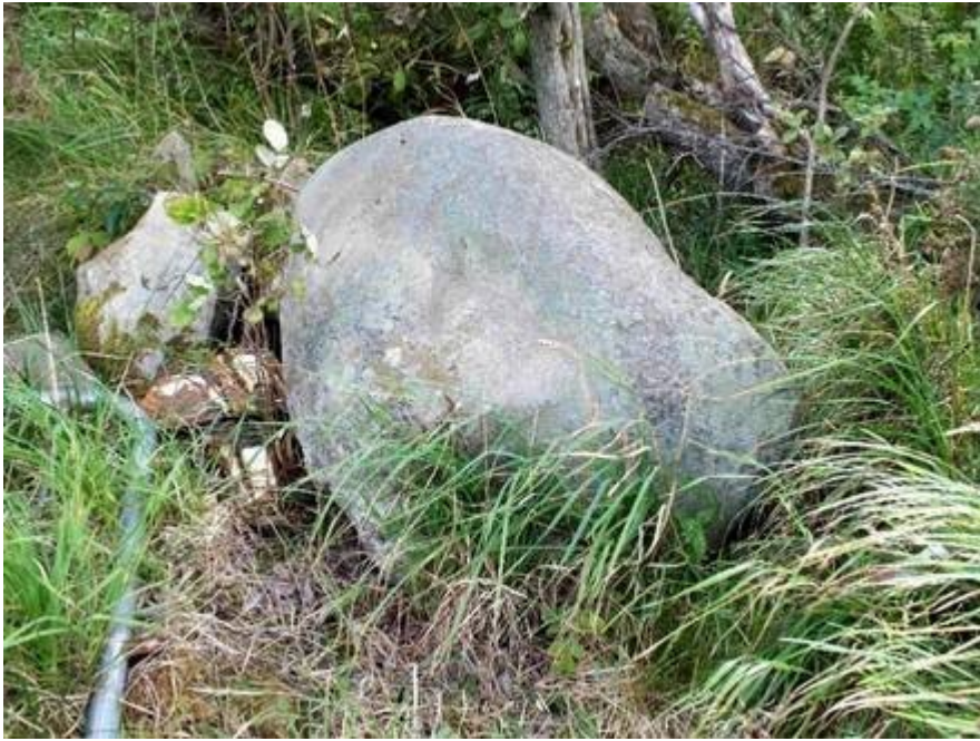
(Figure 31) SP 28. Igneous Boulder carried along by glacier ice until it melted and was dumped here 15,000 years ago. [NT 3522 6295].