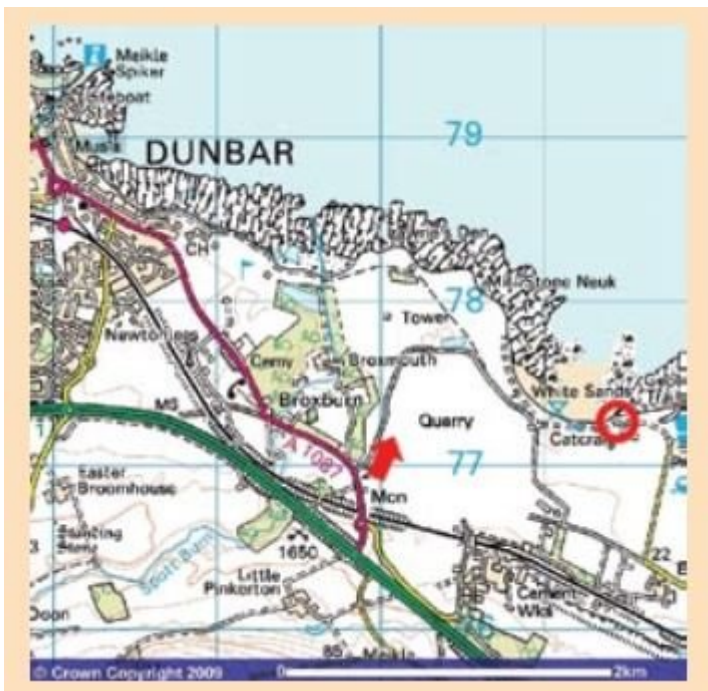
(Figure 1) Location map.

Proceed around the small headland of lumpy limestone and look out for rare fossils called Chaetetes. This is a demosponge and was a common reef-building organism of the Carboniferous. Look closely and you can see tiny holes similar to a bath sponge.