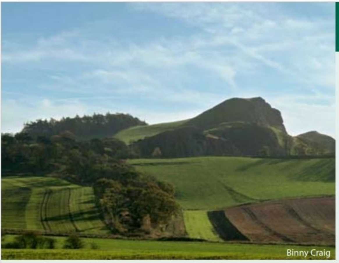
(Figure 2) Binny Craig.