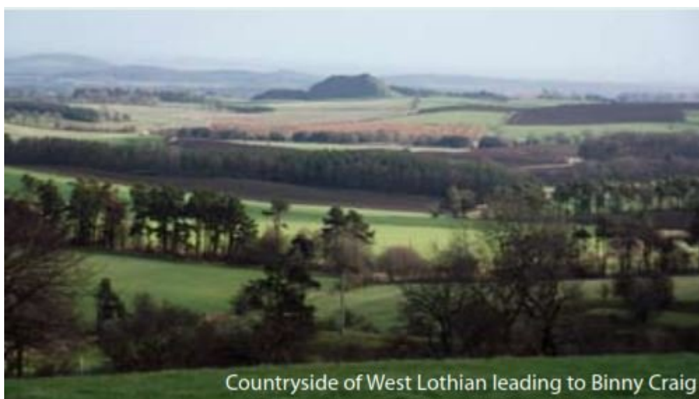
(Figure 4) Countryside of West Lothian leading to Binny Craig.